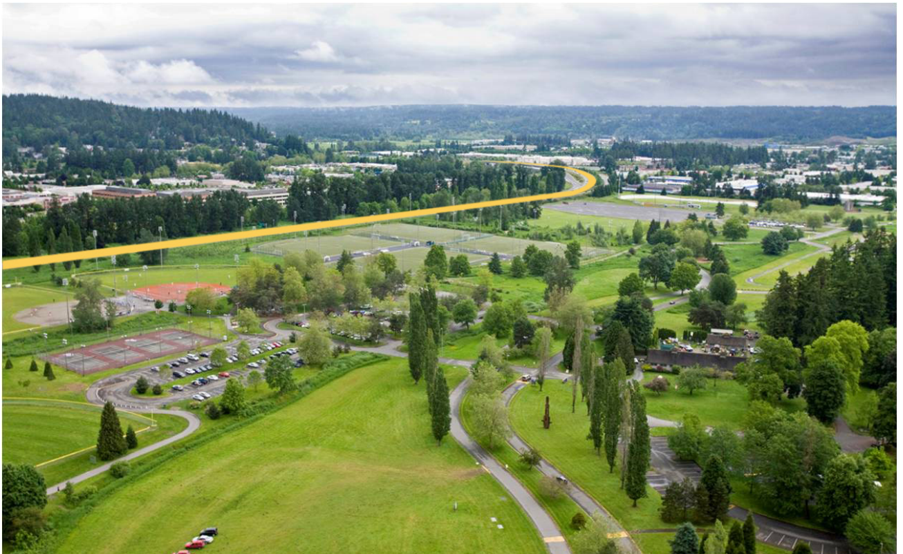
Marymoor Park in Redmond

As part of the ST2 plan, voters approved funding for the preliminary design and environmental study of light rail to Redmond. However, funding has not been approved for the construction of light rail between Overlake Transit Center and downtown Redmond. Additional funding will need to be identified before light rail will serve Redmond Town Center and communities northeast and southeast of Redmond.