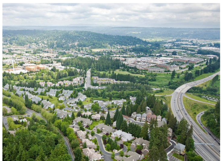
Redmond Town Center