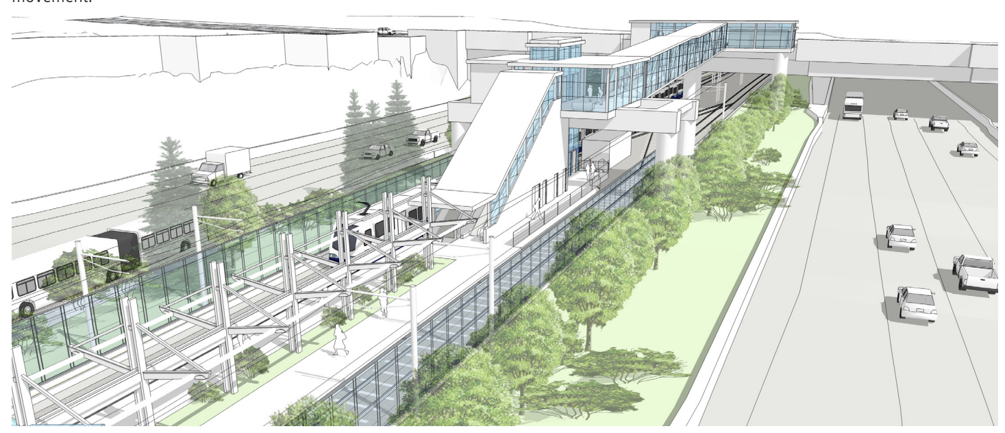
Simulation of Rainier Station in Seattle

An Independent Review Team (appointed by the Washington State Legislature) looked at technical issues related to running light rail on the I-90 bridge. Their conclusion was that through careful design and testing the bridge can accommodate light rail.