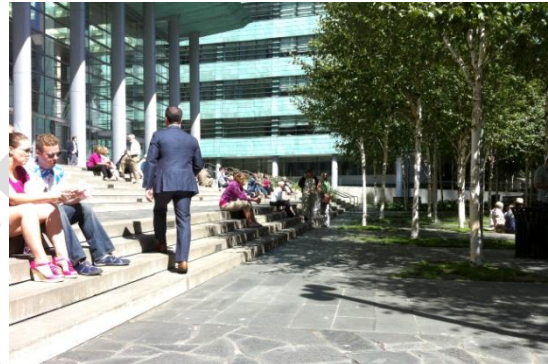
The grade change where a building faces a plaza helps with activation and provides places to sit.