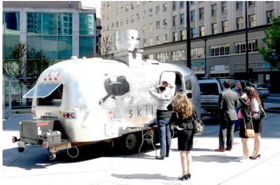
Utility hookups in the plaza allow for street food at certain times.

Within the plaza, consider appropriate substructures, built elements and utility connections to ensure the proposed plaza can be used for Farmer's Markets, performance and other temporary uses that provide interest and activity. Take advantage of grade changes between the plaza level and adjacent sites to create transitions that can be used for seating or other amenities.