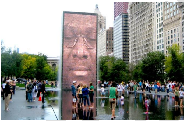
A public art display on a vertical element in the plaza provides a focal point and helps to activate.

Explore architectural features within ground level facades at the proposed plaza such as recesses, bays, colonnades to ensure interest and variety.