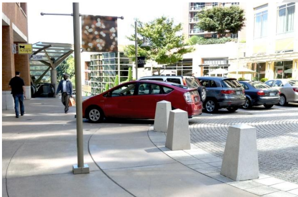
Materials and design help indicate that the space is shared between pedestrians and vehicles.

Design the drivecourt entry from E John St. as a private street for residents of Sites A and B not as a through street or transit drop-off. Vehicles should be encouraged to move slowly, and urban design elements and softening features such as pavement treatments, landscaping, lighting fixtures and other elements should be used to indicate the shared nature of the space.