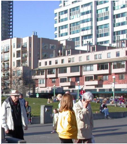
The mass and height of the buildings preserves sun exposure onto the plaza space.

Site specific supplemental design guidance: Scale mass of buildings on sites A and C facing the Plaza and the E. Denny Way Festival Street so as to provide favorable sun and air exposure to the proposed plaza and Festival Street.