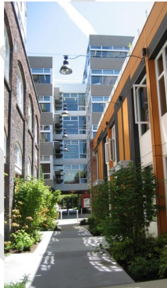
Changes in materials and textures combined with sizeable recesses and alterations in building height create visual massing breaks.