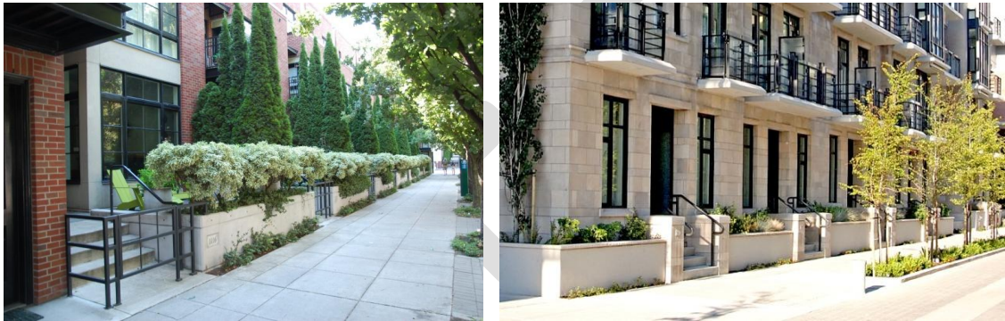
Street facing front entries with small terraces, entry stairs, a slightly raised first floor, and landscaping.

Provide townhome-style units with individual unit entries facing the 10 th Ave E. side of site B. Provide stoops, front entries and terraces that encourage residents to use the 10 th Ave E. frontage. Use stairs to units and landscaping to screen the potential ½ level of above grade parking that will likely be necessary at this location.