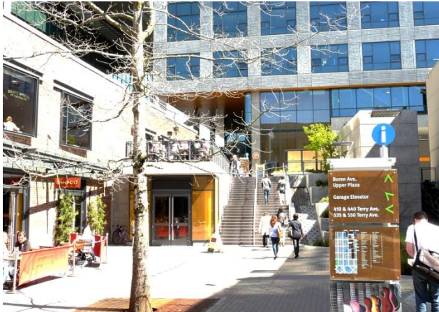
Prominent walkways, wayfinding, and placement of active uses help draw people into plaza spaces.

Design the mid-block crossing of Site A and Site B in a way that draws the public into the proposed plaza.