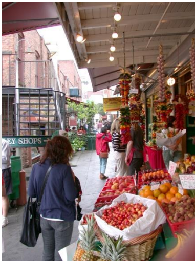
Retail uses opening onto a publicly accessible place provides activity.

Include active ground floor retail spaces on the Broadway Ave. and E. Denny Way-facing ground floors of buildings on sites A and C. Consider designing flexible retail spaces facing Broadway Ave. to potentially accommodate a larger 'anchor' or destination retail tenant. Encourage activating uses in the ground level façades fronting the interior of sites A and B to provide eyes on the proposed plaza and other publicly accessible spaces during the day and evening.