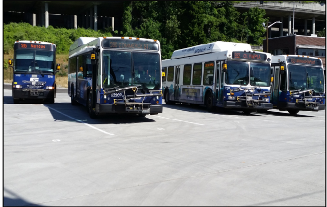
Midday bus storage site for ST Express

In 2015 this area will be needed to support S. 200th Link and University Link start-up and testing activities. Sound Transit will construct a permanent midday bus storage area on property Sound Transit owns along Stevens Way.