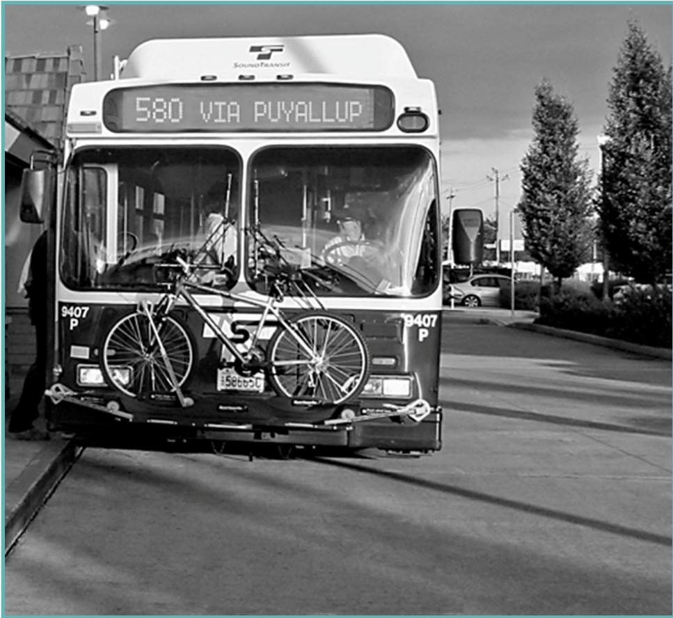
New ST Express Route 580 providing Lakewood riders with better access to all Sounder trains on the south line.