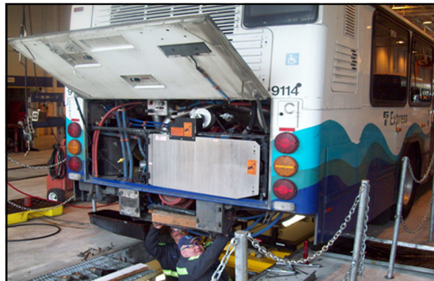
ST Express bus maintenance currently performed by transit partners

Sound Transit is evaluating the need for an operations and maintenance base for the ST Express bus fleet. Initial project development activities including confirmation of fleet operating assumptions, facilities and site programming evaluations and review of alternative project delivery methods have been completed. Alternative site identification, site evaluations and environmental analysis activities are being initiated.