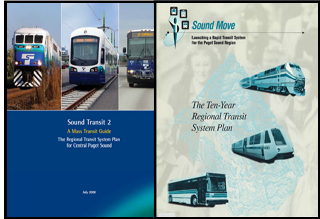
Long Range to be updated for future transit investments

The basis for both the Sound Move and Sound Transit 2 (ST2) initiatives approved by the voters in 1996 and 2008 respectively was a regional long-range transit improvement plan. An updated Long-Range Plan was adopted by the Board in December 2014.