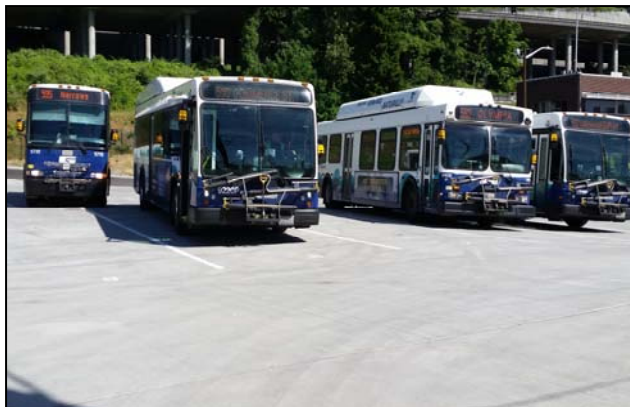
Midday bus storage site for ST Express

To gain operational efficiencies, Sound Transit formerly stored up to 30 forty-five buses that provide peak commuter service to downtown Seattle from remote areas of the Sound Transit District at the Link Operations and Maintenance Facility (OMF) parking area midday, during periods of non-use. The Midday Bus Storage facility has relocated these buses and area at the OMF to support South 200th Link and University Link start-up and testing activities.