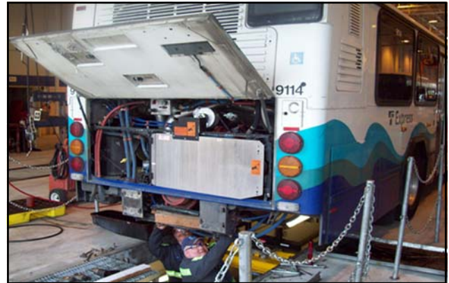
ST Express bus maintenance currently performed by transit partners

Sound Transit is evaluating the need for an operations and maintenance base for the ST Express bus fleet. Initial project development activities including confirmation of fleet operating assumptions, facilities and site programming evaluations and review of alternative project delivery methods have been completed. Identification of alternative sites, site evaluations, and environmental analysis activities are being initiated.