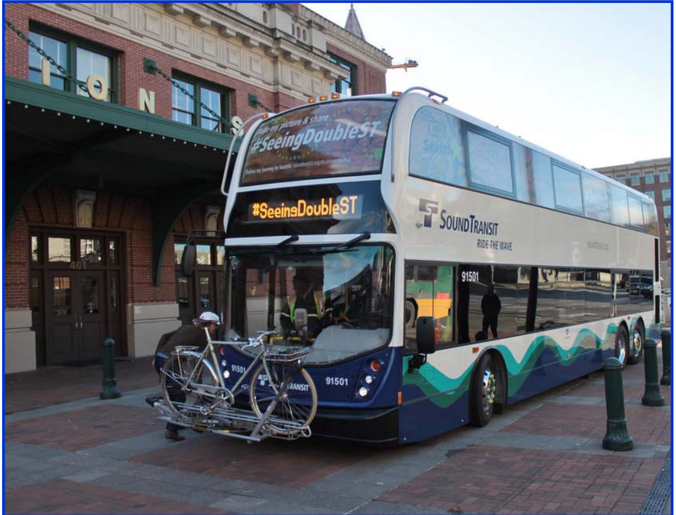
Welcome Fab Five; the first double decker buses in Sound Transit history.