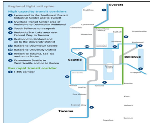
Central & East Study Area