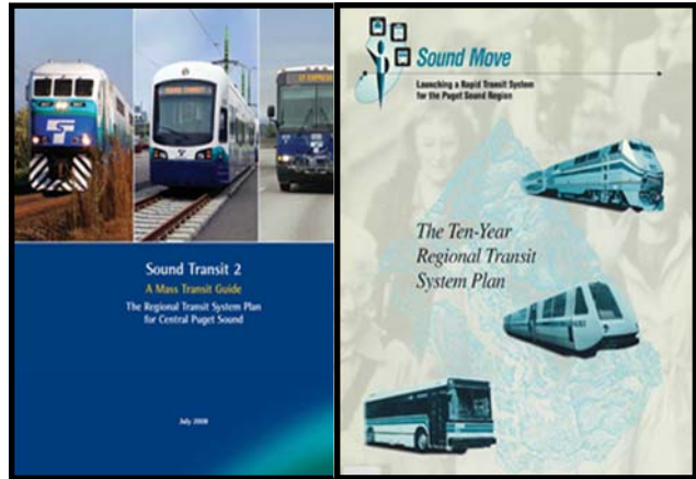
Long Range to be updated for future transit investments

The basis for both the Sound Move and Sound Transit 2 (ST2) initiatives approved by the voters in 1996 and 2008 respectively was a regional long-range transit improvement plan. An updated Long-Range Plan was adopted by the Board in December 2014.