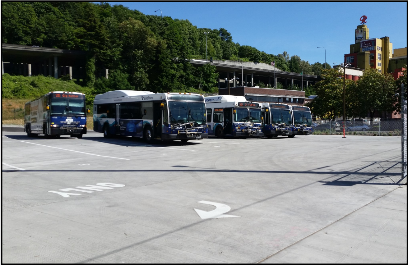
Mid-day Bus Storage site for ST Express Buses.