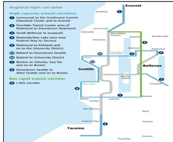
Central & East Study Area

The studies will inform ST Board’s consideration of potential updates to Sound Transit’ Long Range Plan.