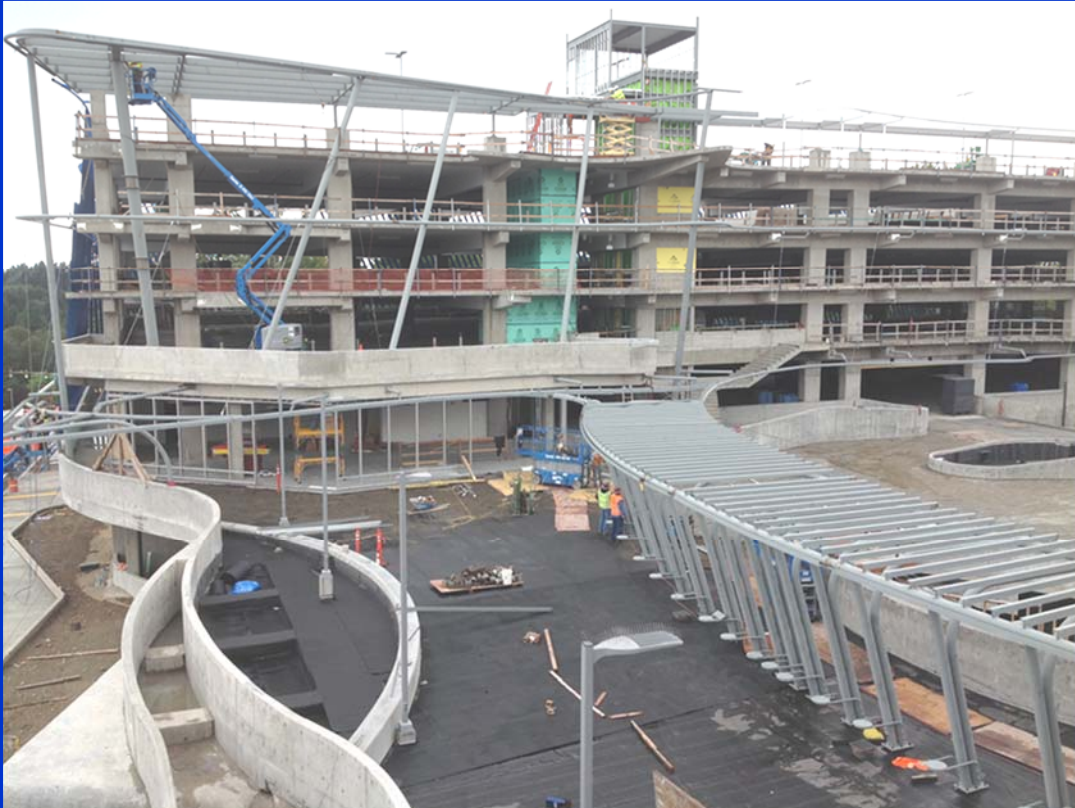
The Angle Lake Parking Garage