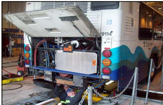
ST Express bus maintenance currently performed by transit partners

Sound Transit is evaluating the need for an operations and maintenance base for the ST Express bus fleet. Initial project development activities including confirmation of fleet operating assumptions, facilities and site programming evaluations and review of alternative project delivery methods have been completed. Identification of alternative sites, site evaluations, and environmental analysis activities are being initiated.