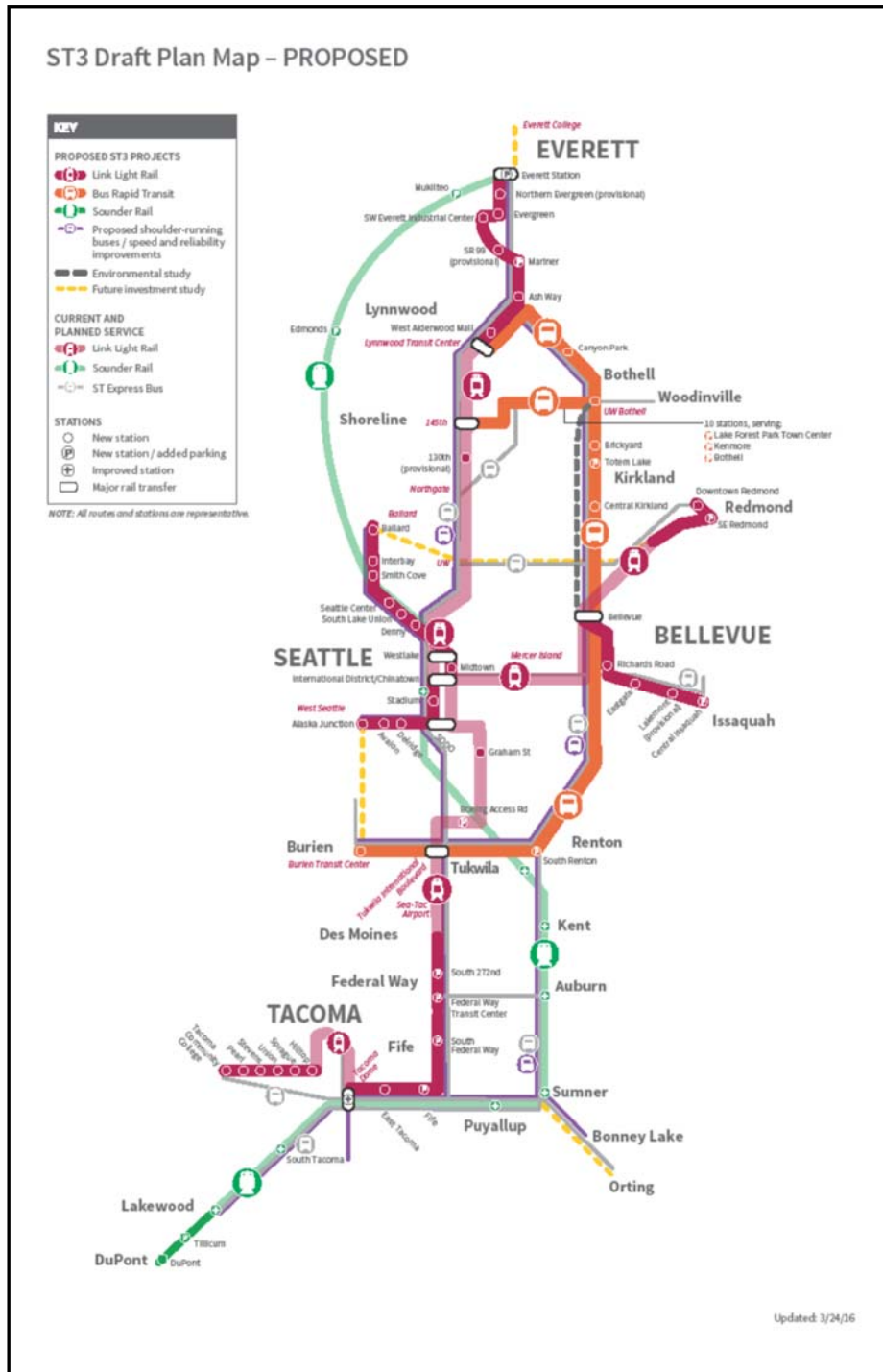
ST Draft Plan Map