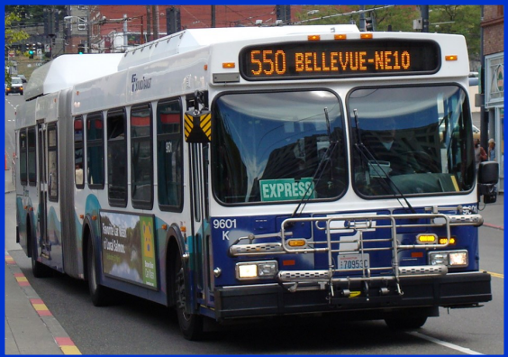
ST Express bus routes connect riders with major urban and employment centers in King, Pierce, and Snohomish counties