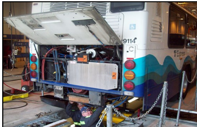
ST Express bus maintenance currently performed by transit partners

Sound Transit is evaluating the need for an operations and maintenance base for the ST Express bus fleet. Initial project development activities including confirmation of fleet operating assumptions, facilities and site programming evaluations and review of alternative project delivery methods have been completed. Identification of alternative sites, site evaluations, and environmental analysis activities are being initiated.