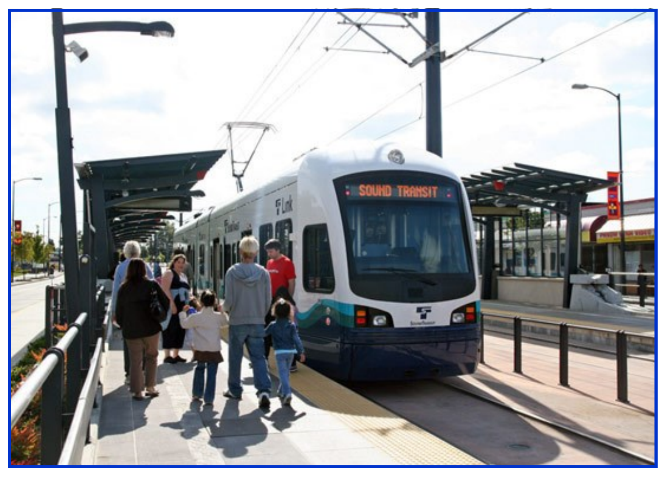
Preparing for population economic growth, responding to rising congestion, and meeting public demand for expansion.