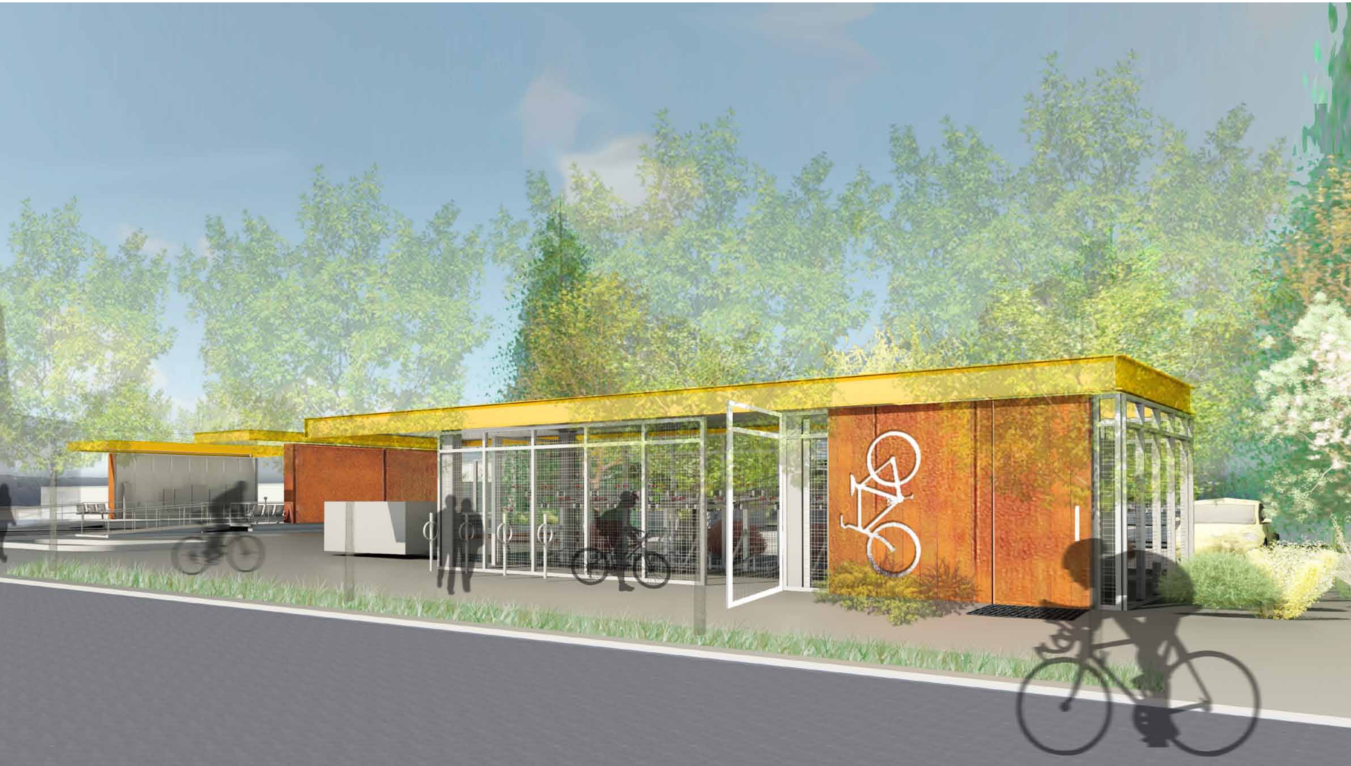
View of bike plaza from 132nd Ave NE