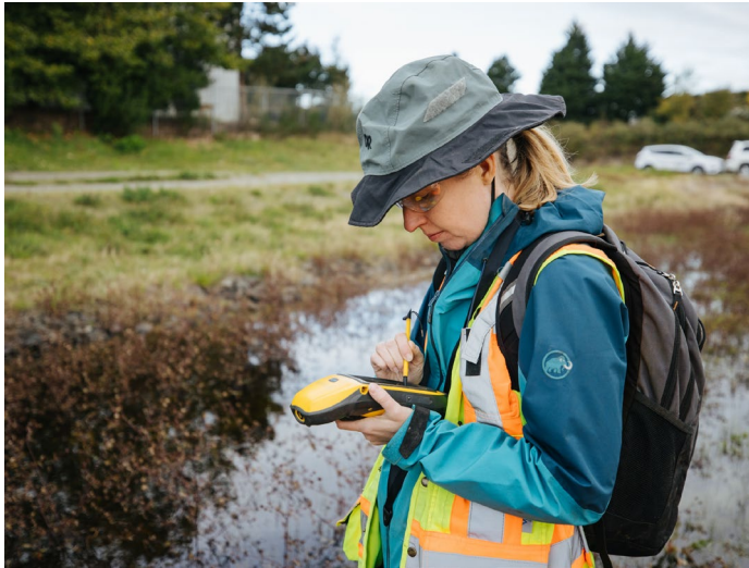
Example of wetland delineation