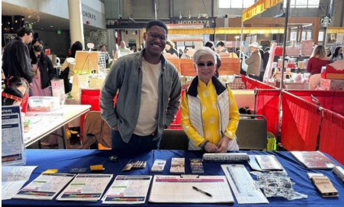
Ballard Link booth staffers during Tét at Seattle Center on February 14, 2026.