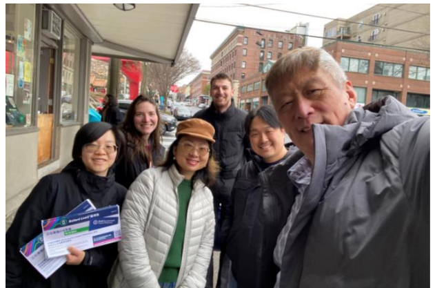
Ballard Link team members conducting door-to-door outreach to businesses in the Chinatown / International District on March 19, 2026