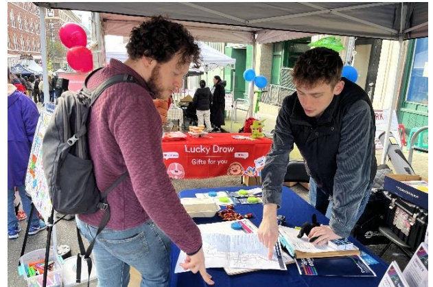
A Ballard Link booth staffer chats with a community member about system expansion at Lunar New Year Celebration on March 7, 2026.