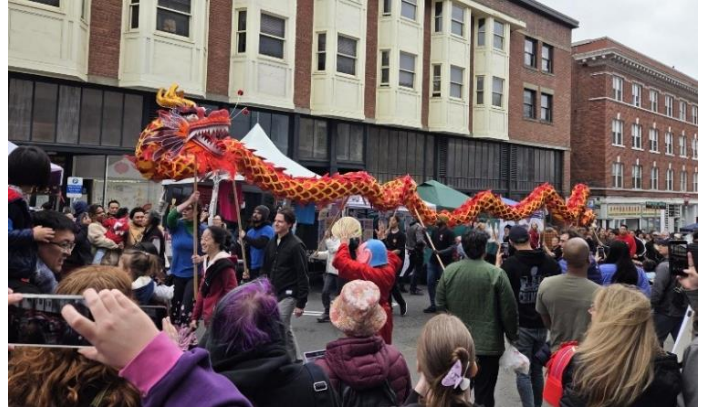
Community members raise the iconic Chinese dragon during Lunar New Year Celebration on March 7, 2026.