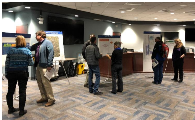
Oct.,30, 2018: Open house participants talk to Sound Transit staff at Auburn City Hall.

The following summary includes common themes from the community feedback with responses from Sound Transit.