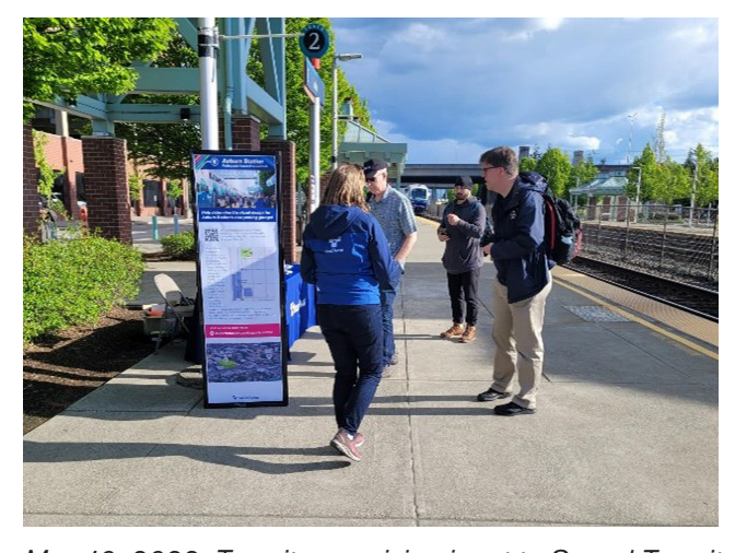
May 10, 2022: Transit user giving input to Sound Transit staff.

We will use this feedback to inform the visual design of the new garage. We have drafted a Vision Statement (see below) based on public and stakeholder feedback, which will be included in the project requirements for the design-build contractor. We expect to share final designs with the community in mid-2023 and to begin construction in late 2023.