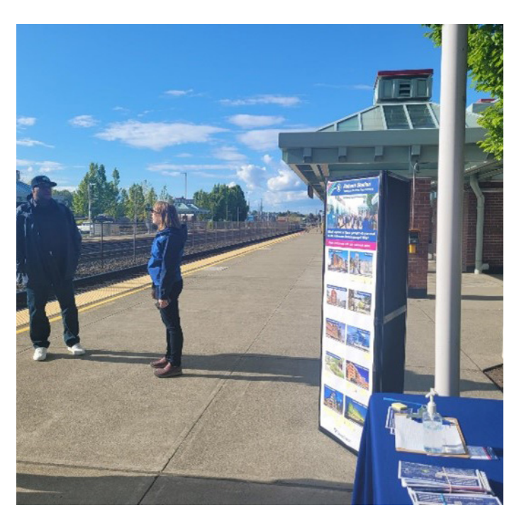
May 10, 2022: Sound Transit staff talking to a transit rider about the survey.