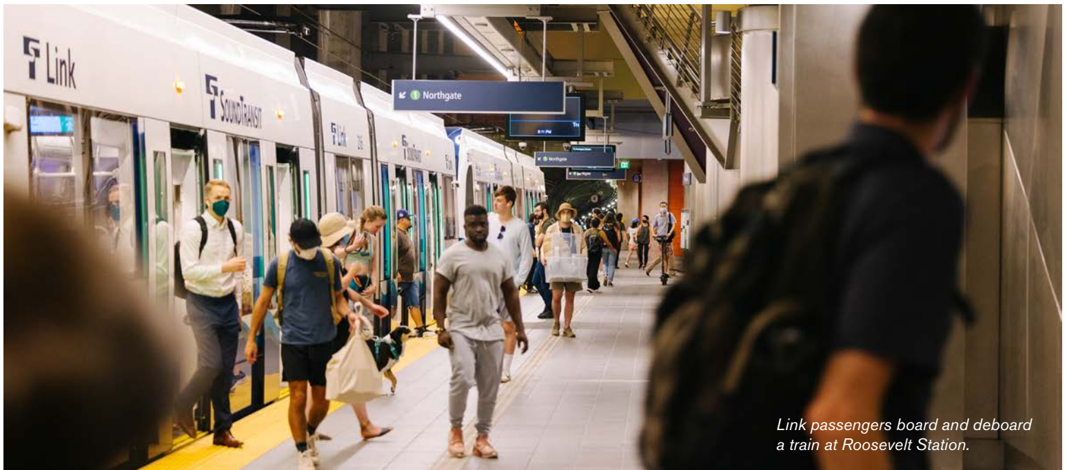
Link passengers board and disembark a train at Roosevelt Station.