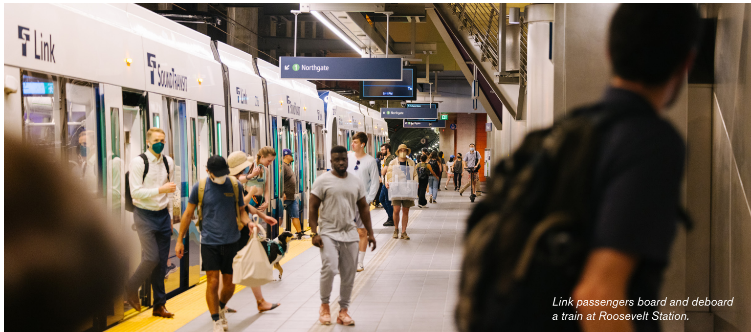
Link passengers board and disembark a train at Roosevelt Station.