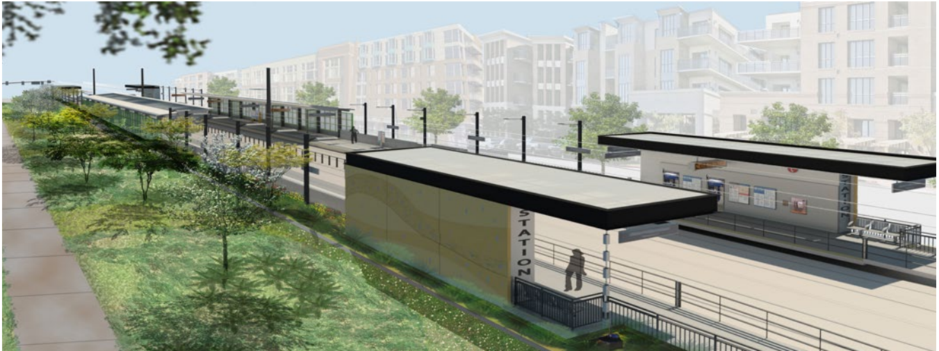
Platform view looking east

Located between 130th and 132nd avenues NE, this at-grade station supports future growth in the corridor and will be situated adjacent to a future City of Bellevue transit oriented development project that will include bicycle parking and 300 parking spaces for transit users.