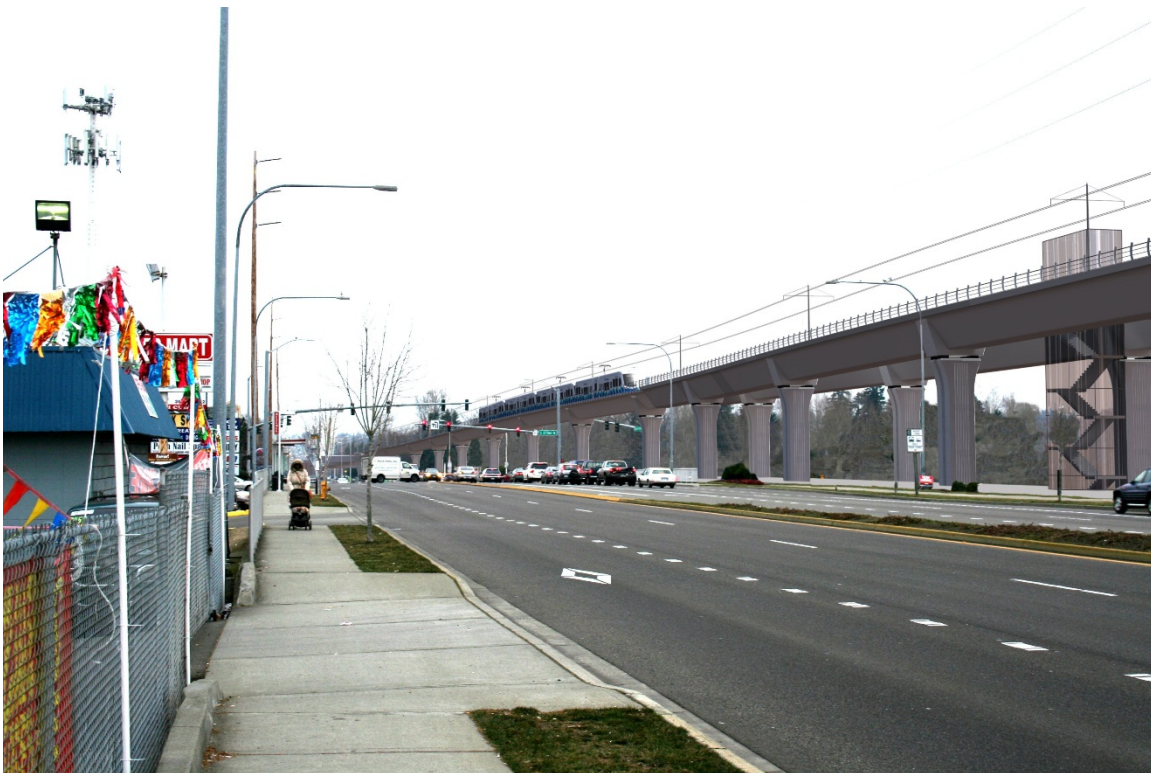
Exhibit 6b. KOP 6: Simulation of the SR 99 Alternative (Note Edge of Station on Right Side of Exhibit).