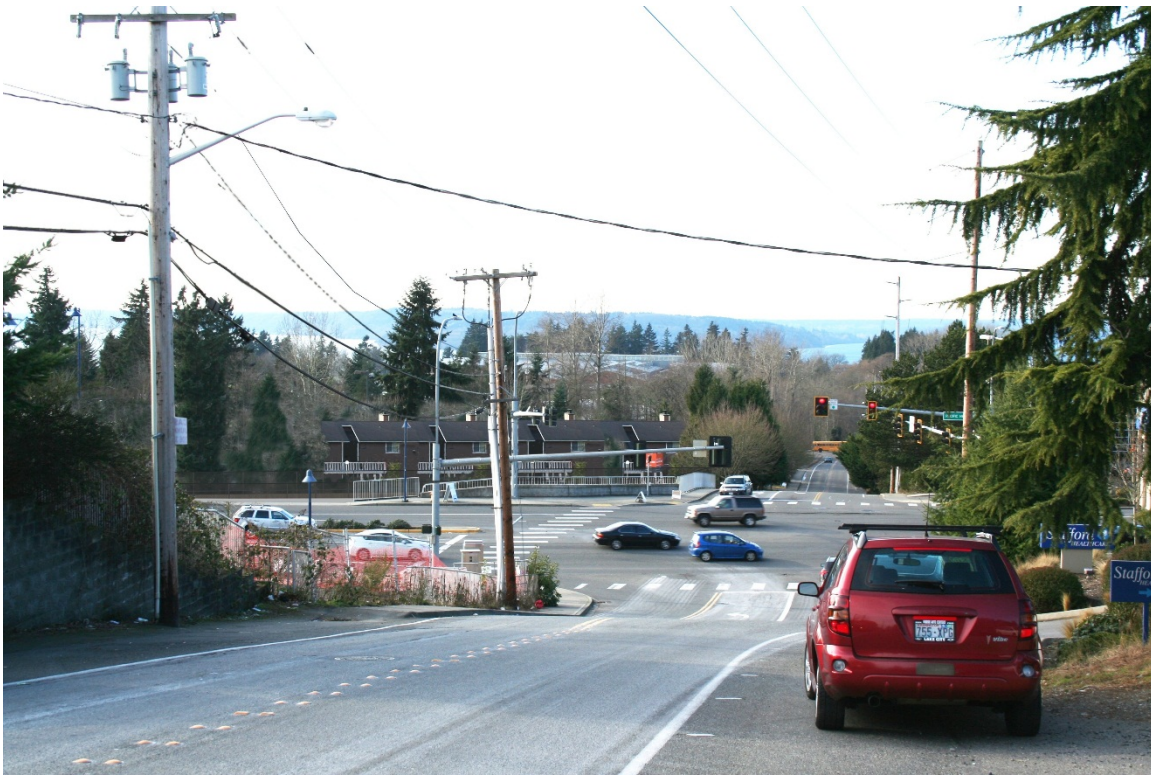
Exhibit 2d. KOP 2: Simulation of Kent/Des Moines HC Campus Station Option from S 216th West Station Option.