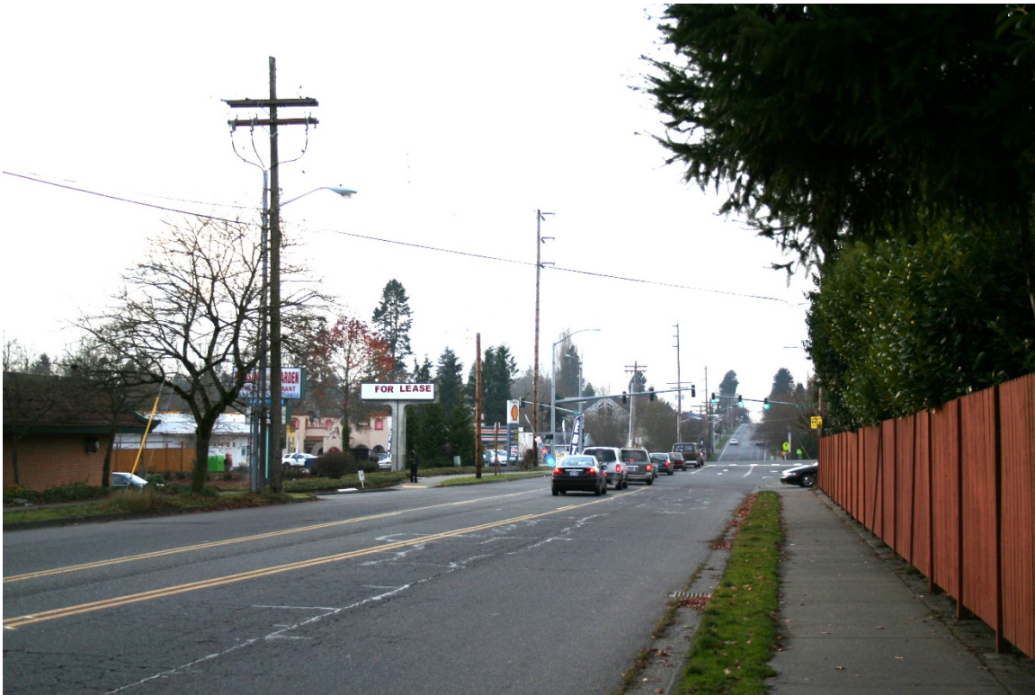
Exhibit 5a. KOP 5: Existing Condition – Looking West from S 260th Street toward SR 99.