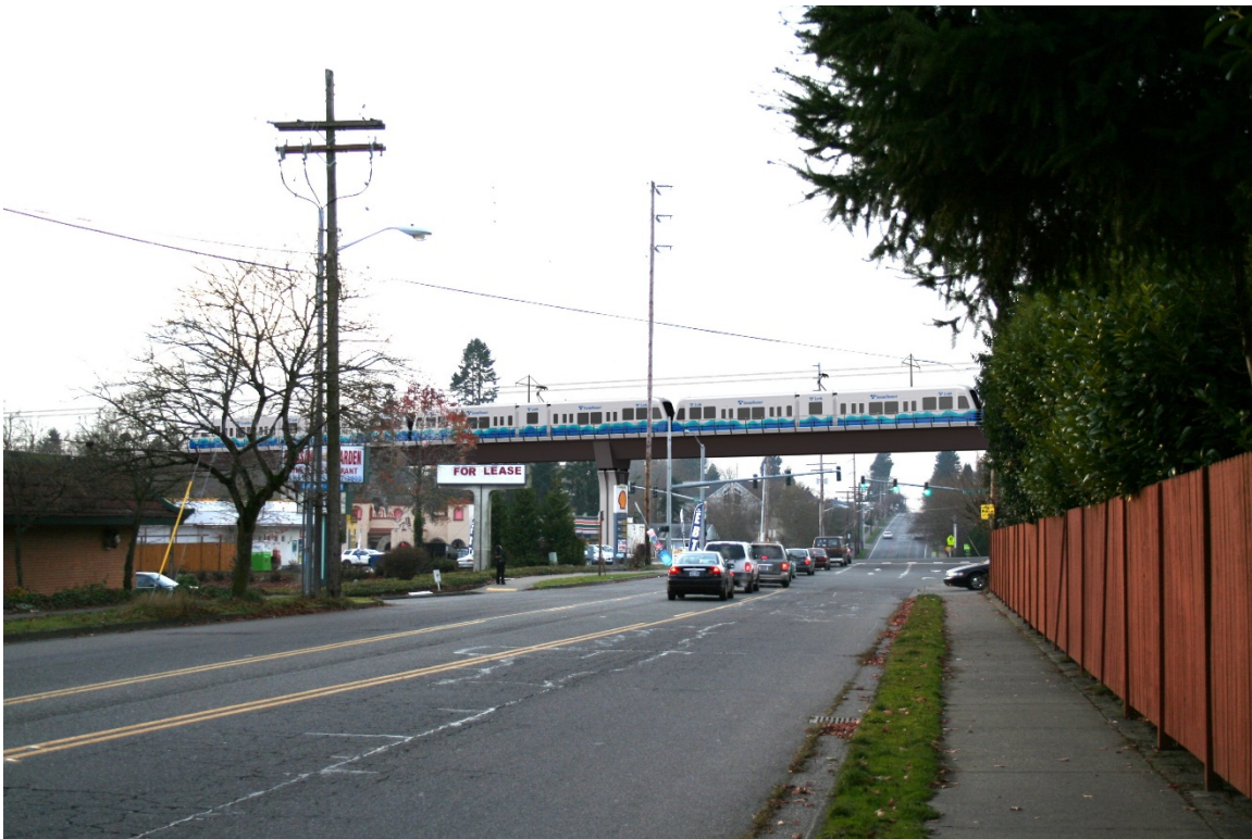
Exhibit 5b. KOP 5: Simulation of the SR 99 Alternative.