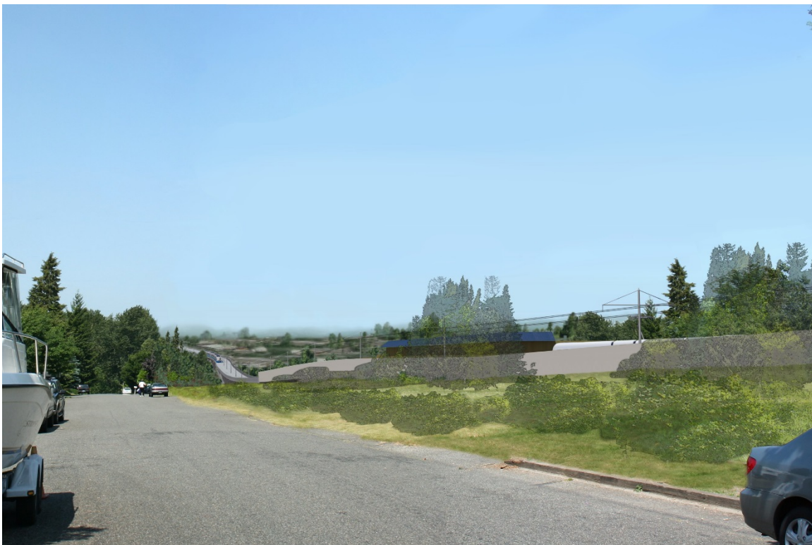
Exhibit 4b. KOP 4: Simulation of the Kent/Des Moines HC Campus Station Option (With Potential Landscaping Conceptually Depicted).