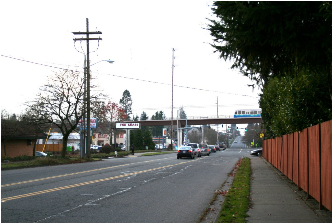
Exhibit 5c. KOP 5: Simulation of the S 260th West Station Option.