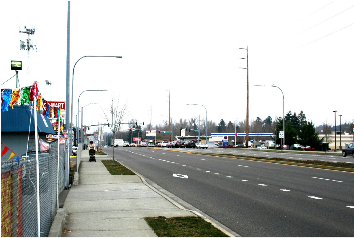
Exhibit 6a. KOP 6: Existing Condition – Looking Northeast at S 272nd Street from SR 99.