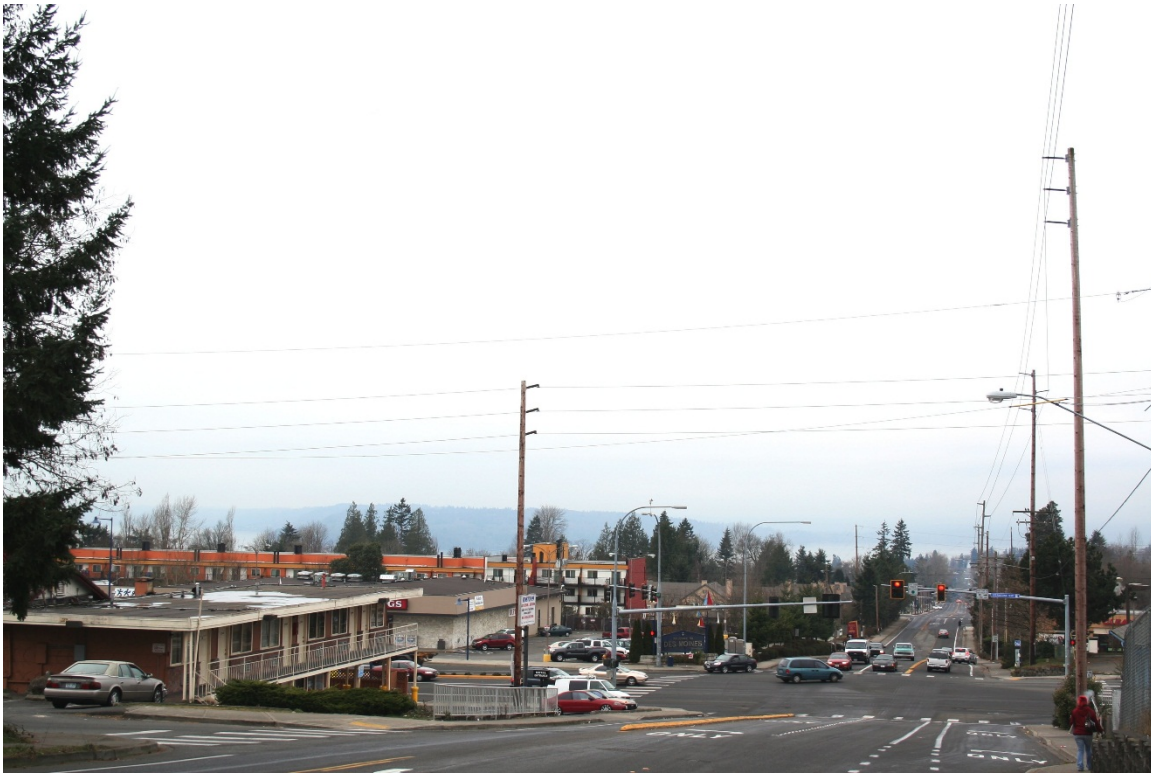
Exhibit 1a. KOP 1: Existing Condition – Looking West from S 216th Street toward SR 99.