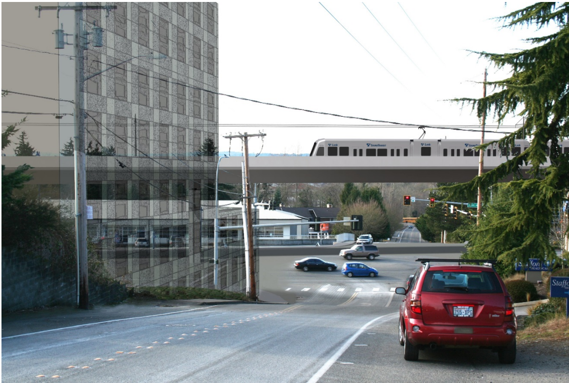
Exhibit 2b-2. KOP 2: Simulation of the SR 99 Alternative Illustrating What the View from this Location Would Look Like with a Building at the Intersection of S 224th Street and SR 99.