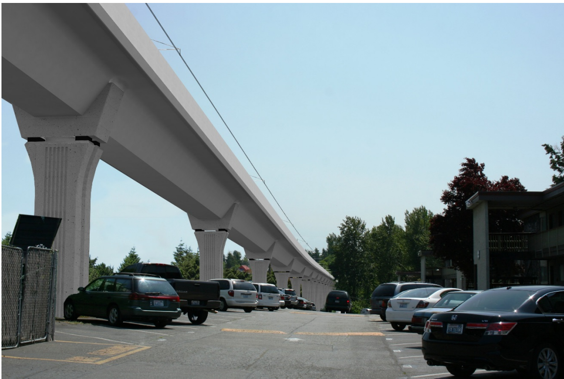
Exhibit 3b. KOP 3: Simulation of the Kent/Des Moines HC Campus Station Option.