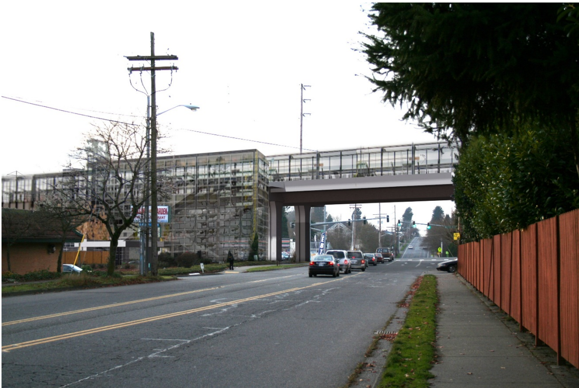
Exhibit 5d. KOP 5: Simulation of the S 260th East Station Option.