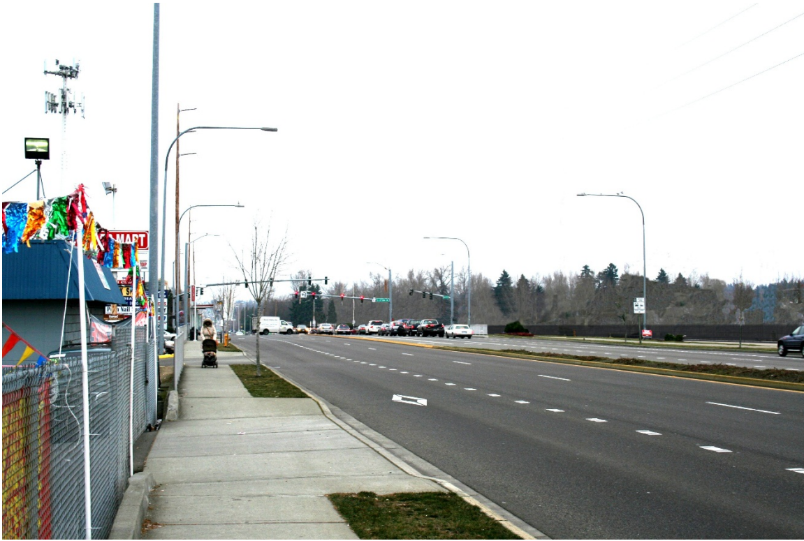
Exhibit 6c. KOP 6: Simulation of the S 272nd Redondo Trench Station Option.