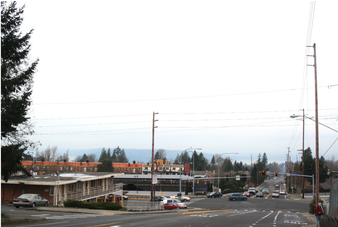
Exhibit 1c. KOP 1: Simulation of the S 216th West Station Option.