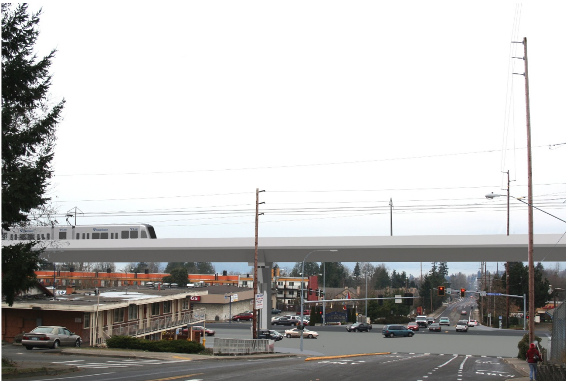
Exhibit 1b. KOP 1: Simulation of the SR 99 Alternative.