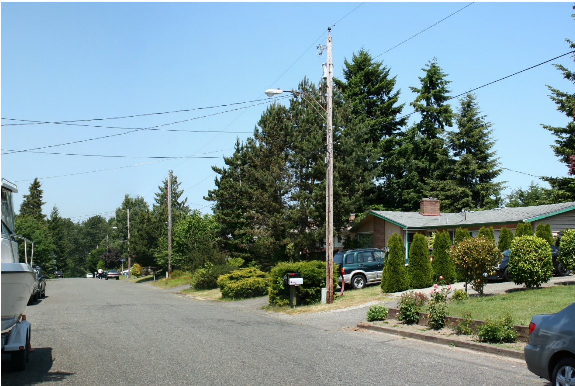
Exhibit 4a. KOP 4: Existing Condition – Looking North along 28th Avenue S.