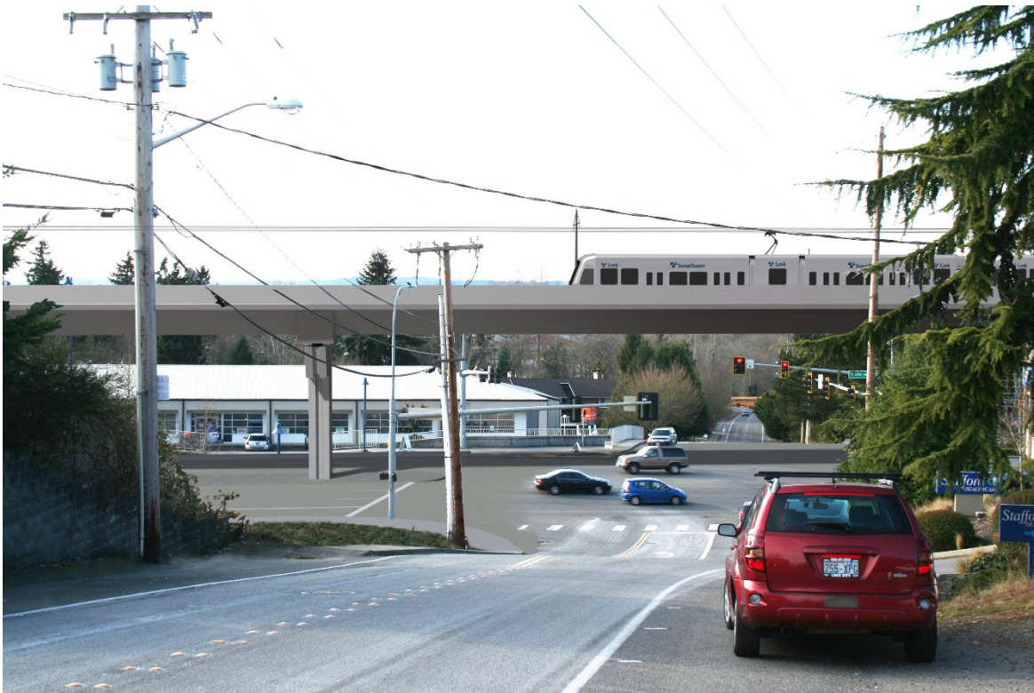
Exhibit 2c. KOP 2: Simulation of the Kent/Des Moines HC Campus Station Option.