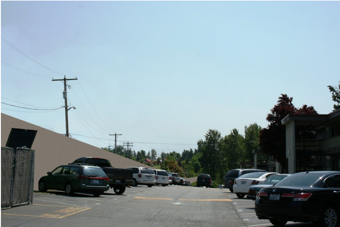
Exhibit 3c. KOP 3: Simulation of the Kent/Des Moines HC Campus Station Option from S 216th West Station Option