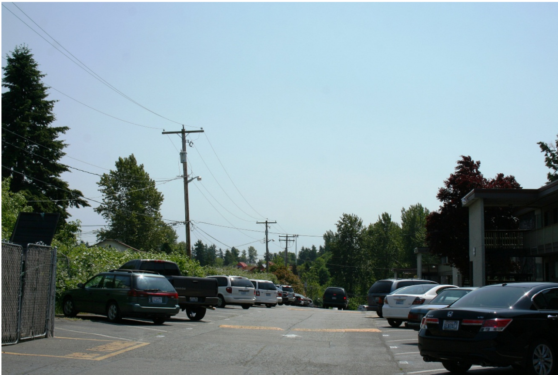
Exhibit 3a. KOP 3: Existing Condition – Looking South from S 226th Street at Area between 28th Avenue S (to right) and SR 99 (to left).