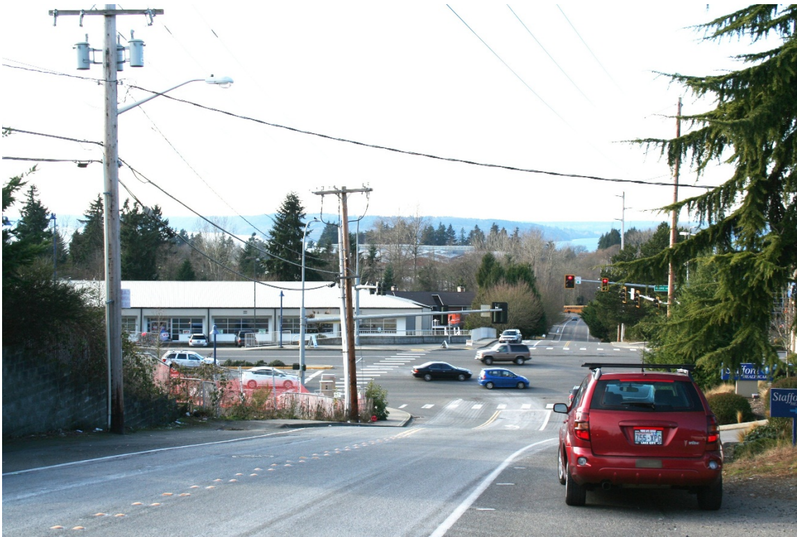
Exhibit 2a. KOP 2: Existing Condition – Looking West from S 224th Street toward SR 99.