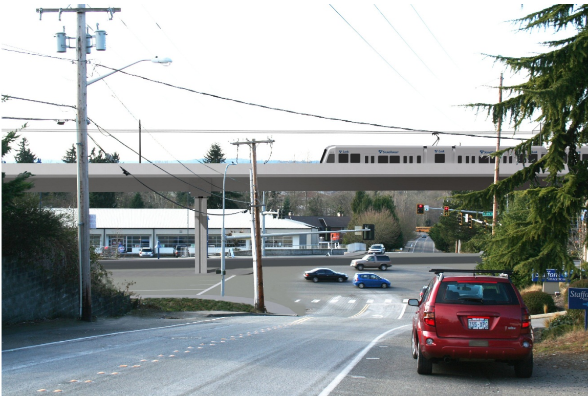
Exhibit 2b-1. KOP 2: Simulation of the SR 99 Alternative.