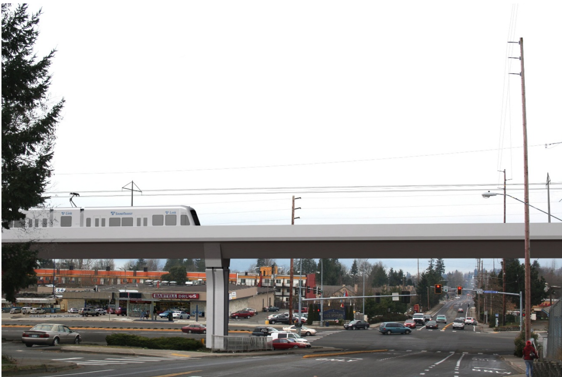
Exhibit 1d. KOP 1: Simulation of the S 216th East Station Option.