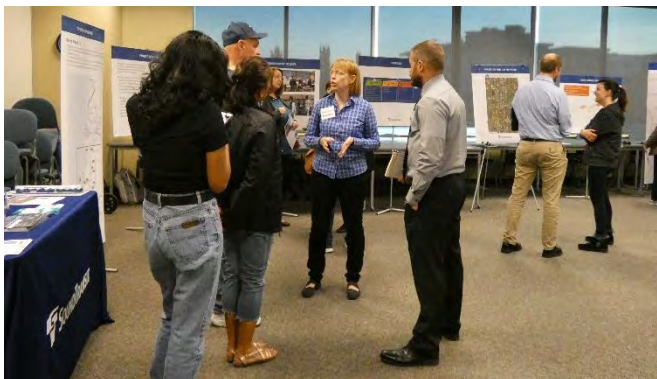
October 18, 2018: Open house participants talk to Sound Transit staff about future improvements to Kent Station.

The following summary includes common themes from the community feedback with responses from Sound Transit.