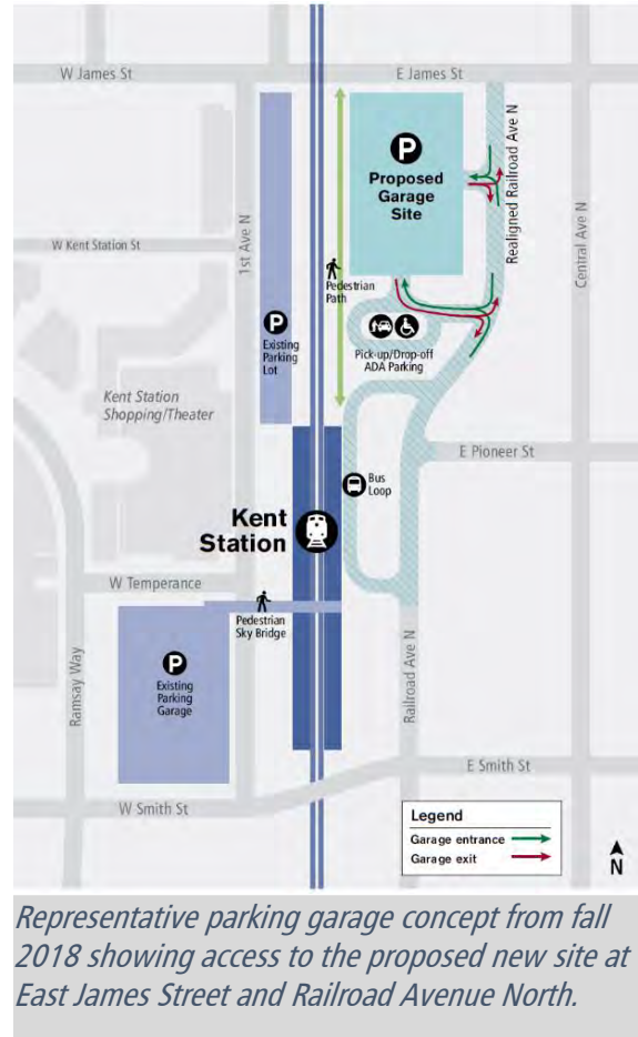
Representative parking garage concept from fall 2018 showing access to the proposed new site at East James Street and Railroad Avenue North.

We are working with our partner at the City of Kent to advance design of the garage and complete environmental review, permitting, property acquisition, contractor selection, and construction as quickly as possible. We anticipate beginning construction in 2021 and opening the garage in 2023.