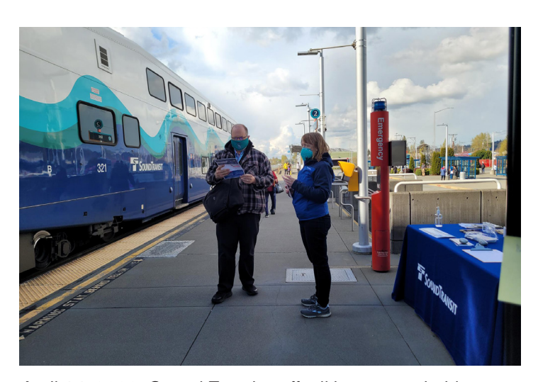
April 14, 2022: Sound Transit staff talking to transit rider about how to take the online survey.