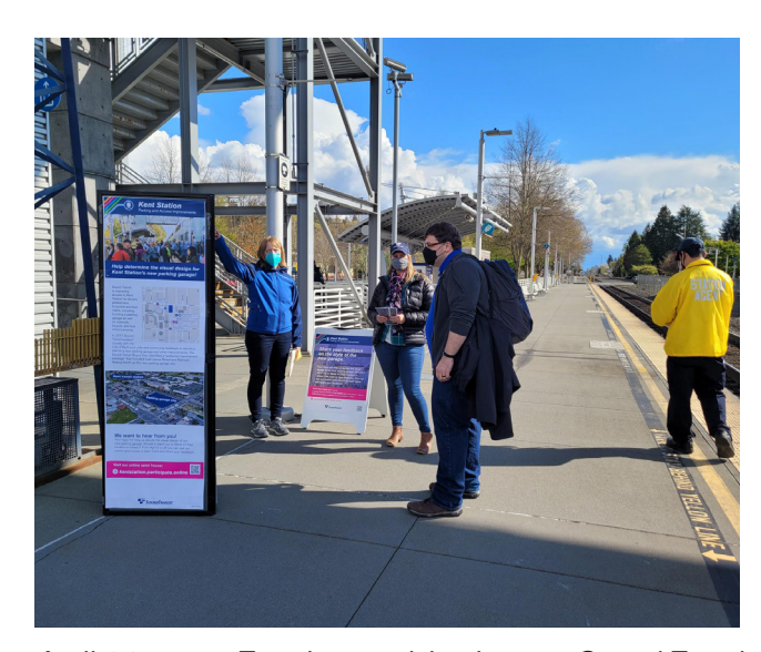
April 14, 2022: Transit user giving input to Sound Transit staff.

We hosted an online open house April 5 - April 26 where visitors could read about the project and take an online survey about the garage visual design. We also hosted an in-person drop-in session at the station on April 14 and a virtual Q&A session on April 18. Overall, more than 220 people participated, either online or in person (Appendix A) resulting in 231 written comments.