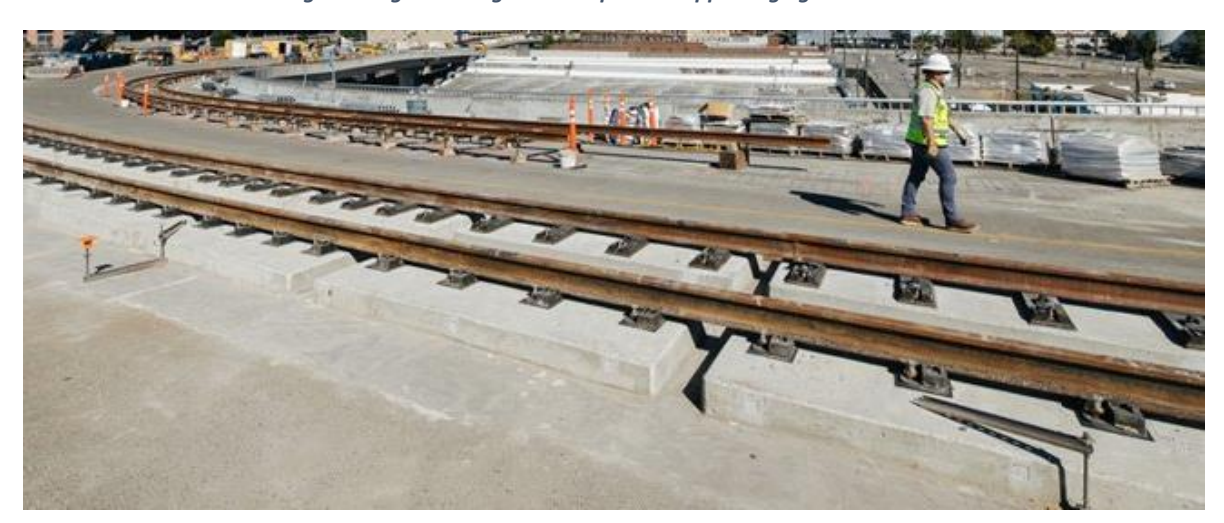
Fig. 2: Image showing concrete plinths supporting light rail tracks.

As seen in the image below, plinths are raised concrete structures that support the tracks in locations where they aren't resting on ties supported by ballast rock. Quality issues affect nearly all the plinths and rail fasteners in this segment.