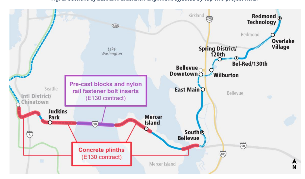
Fig. 1: Sections of East Link Extension alignment affected by top two project risks.

Work to open the project also includes implementing less intensive mitigation efforts that are not summarized here.