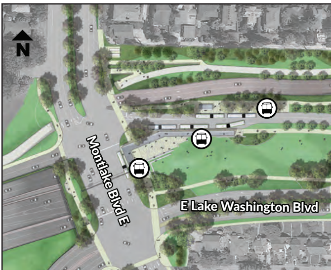
Bus stop locations on new Montlake lid