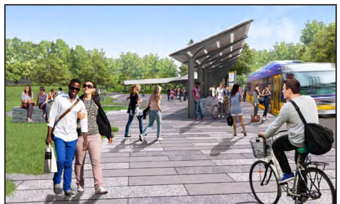
Rendering of the new Montlake lid mobility hub

kingcounty.gov/depts/transportation/metro/programs-projects/routes-and-service/north-eastside-mobility