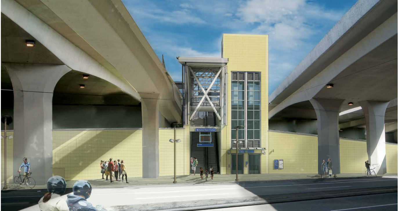
ENTRY AT RAINIER AVENUE S.