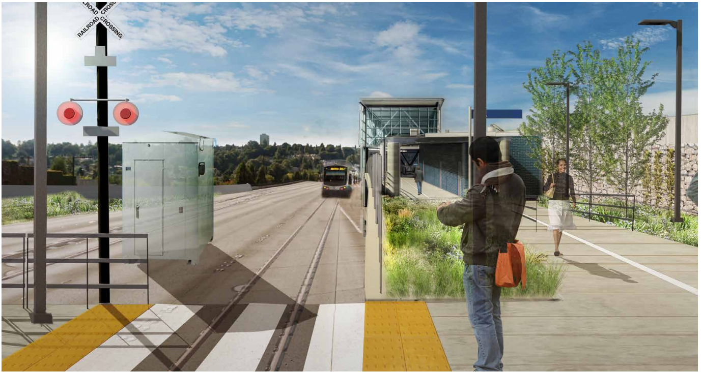
WEST WALKWAY LOOKING TOWARD WEST ENTRY