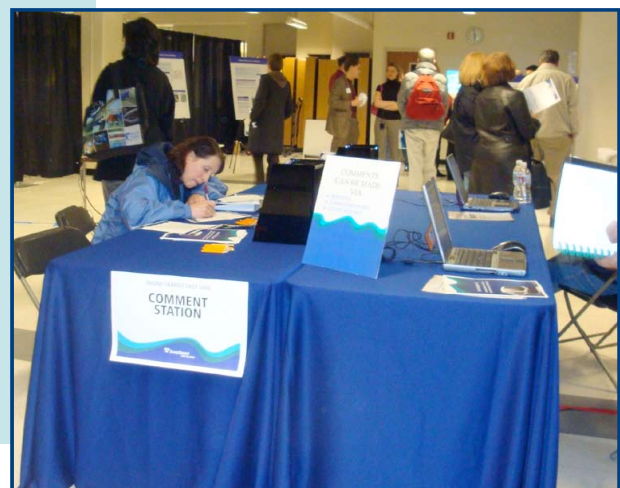
Citizens providing comments during the Bellevue Draft EIS Open House