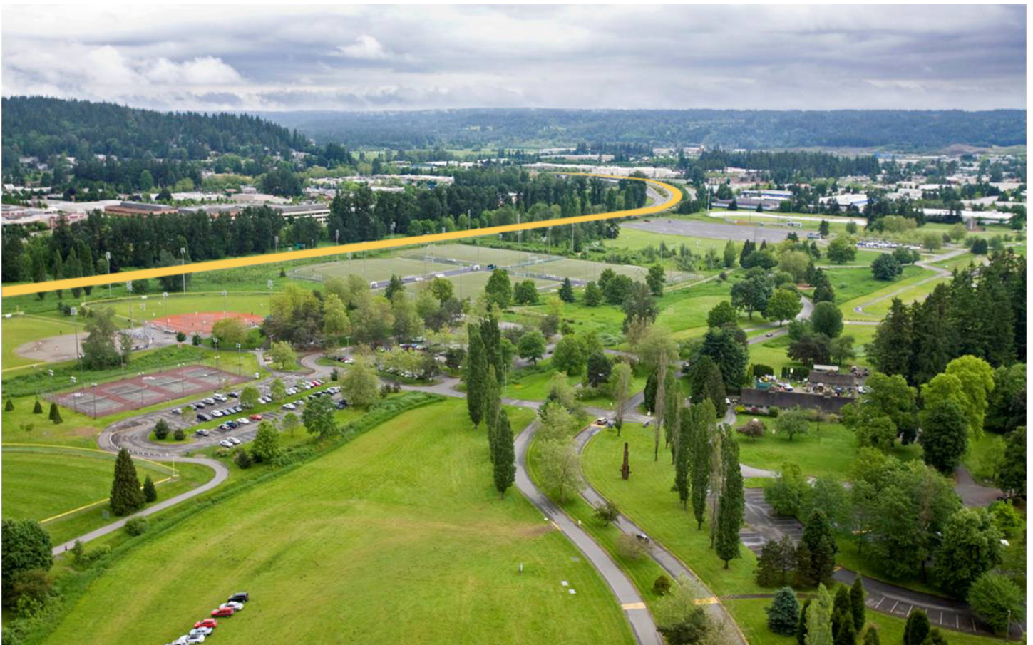
Marymoor Park in Redmond

* Reflects preferred alternative travel times