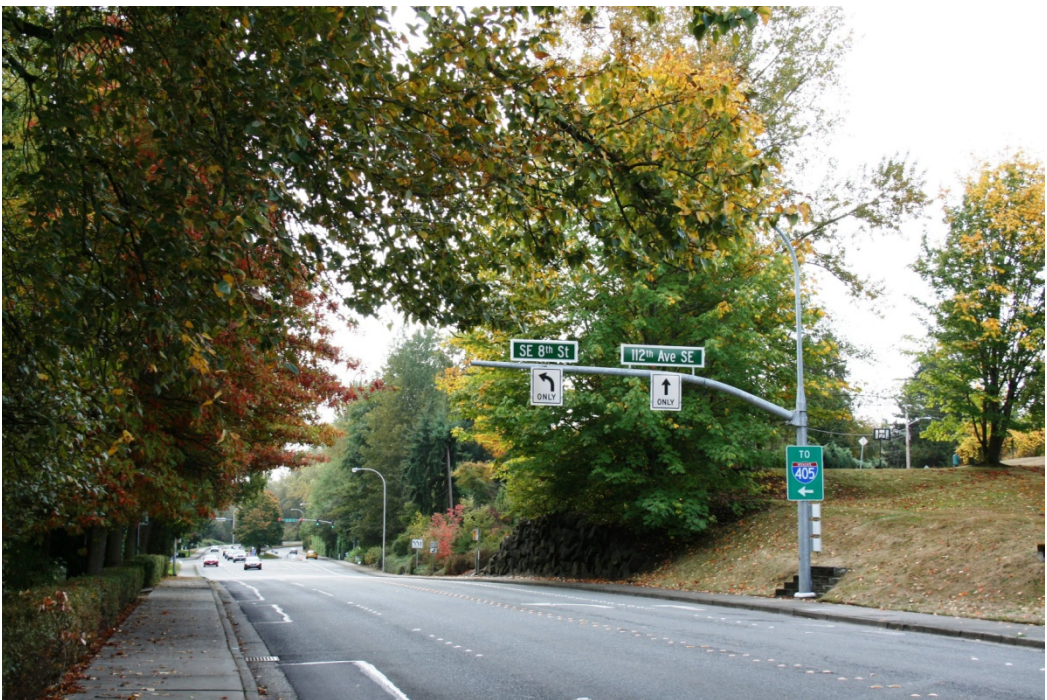
EXHIBIT D-3A Photograph of Existing 112th Avenue SE Looking Southbound from SE 8th Street Intersection toward Surrey Downs Park