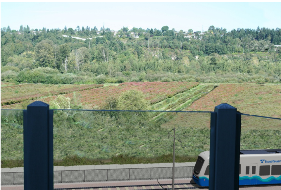
EXHIBIT D-1B Simulation of Shift Bellevue Way Option – Bellevue Way SE from Residence Looking East over Mercer Slough Nature Park and Blueberry Farm

Note: The noise analysis indicates a noise wall between the residences and the light rail would mitigate noise impacts.