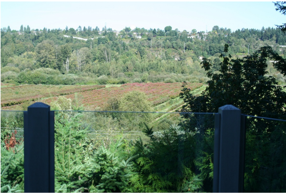
EXHIBIT D-1A Photograph of Existing View from Residence Looking East over Mercer Slough Nature Park and Blueberry Farm