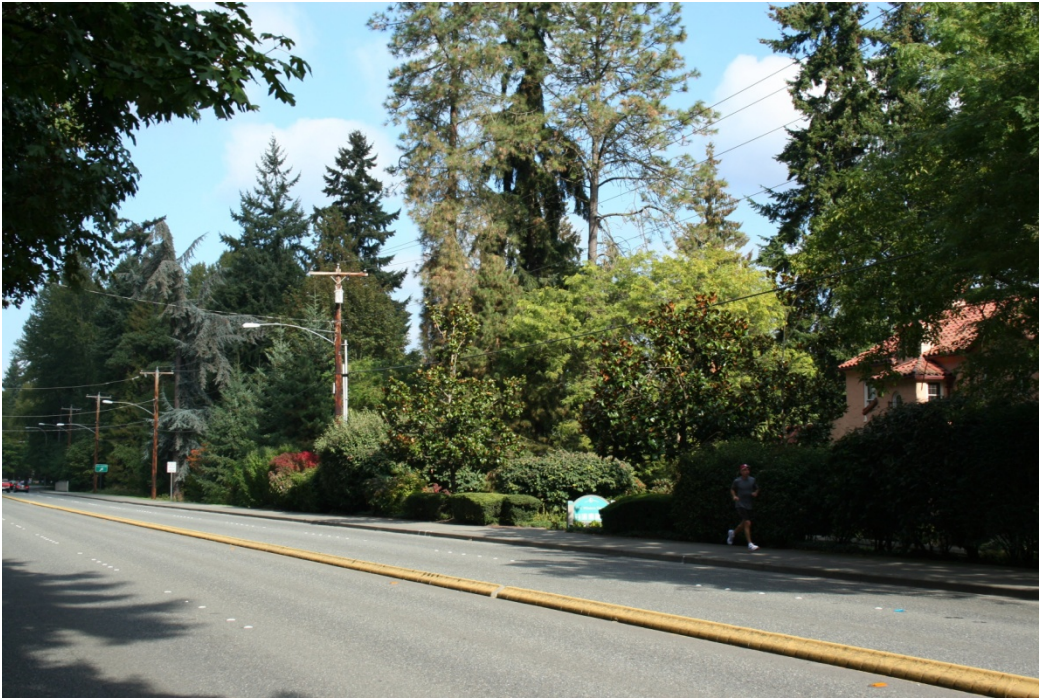
EXHIBIT D-2A Photograph of Existing Northbound View of Winters House from Bellevue Way SE