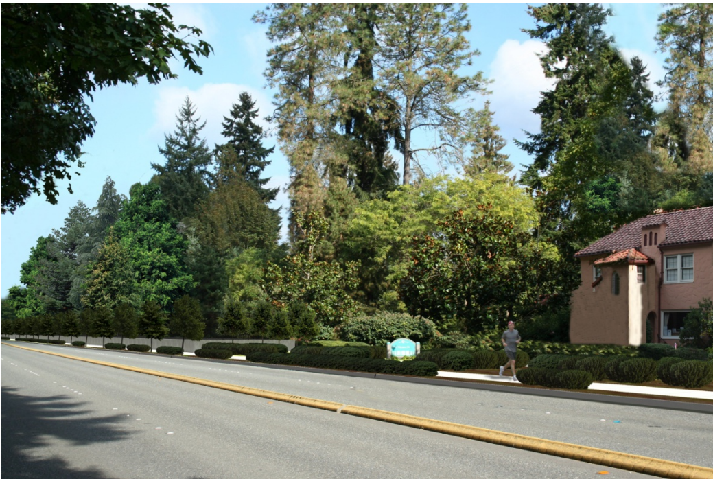
EXHIBIT D-2B Photograph of Selected Alternative Northbound View of Winters House from Bellevue Way SE