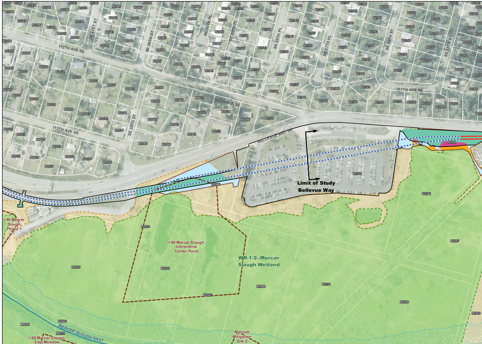
Exhibit F-1a Proposed Refinements Wetland and Wetland Buffer Impacts