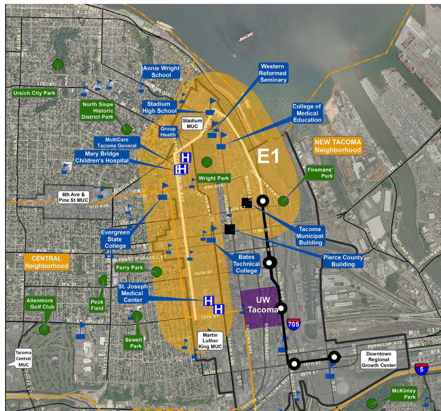
Tacoma Link Expansion: North Downtown Central Corridor (E1)

Stadium Mixed Use Center; Martin Luther King Mixed Use Center; Downtown Regional Growth Center