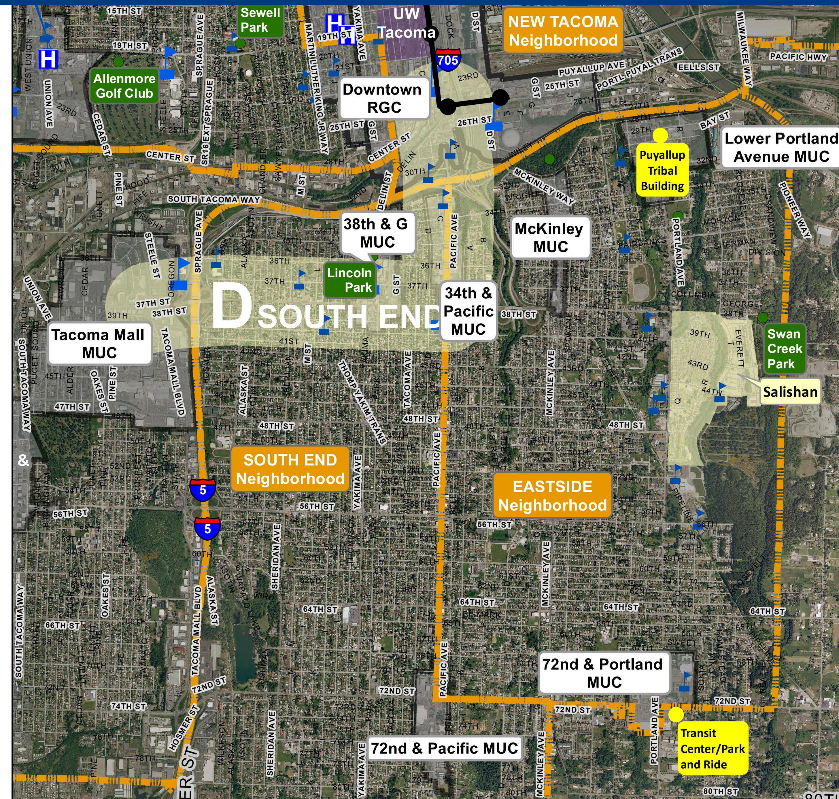
Tacoma Link Expansion: South End Corridor