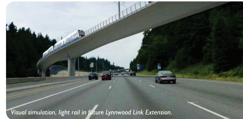
Visual simulation, light rail in future Lynnwood Link Extension.