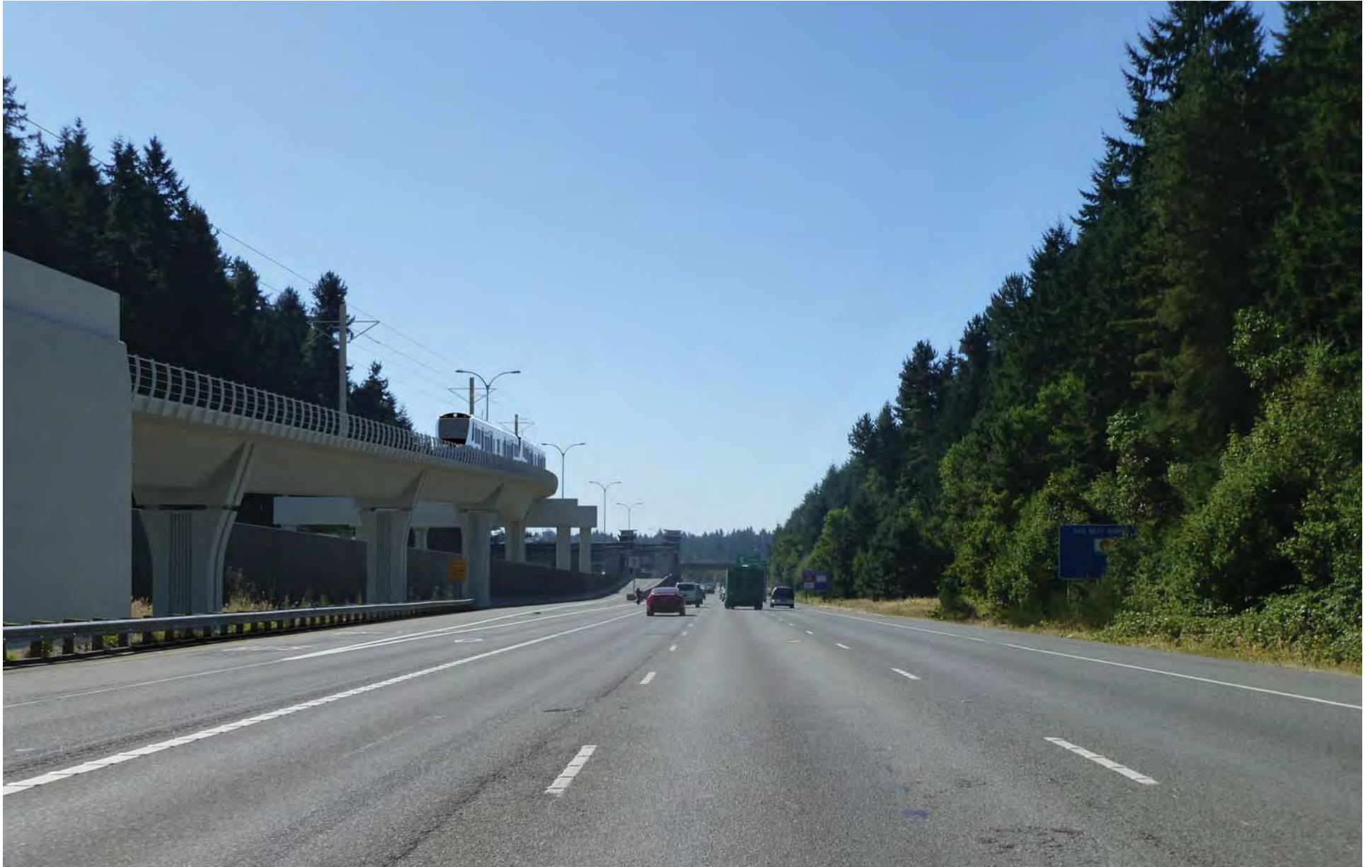
Figure G-113. Viewpoint 34 I-5 Southbound at 230th Street SW View to the south Simulation: Alternative B1