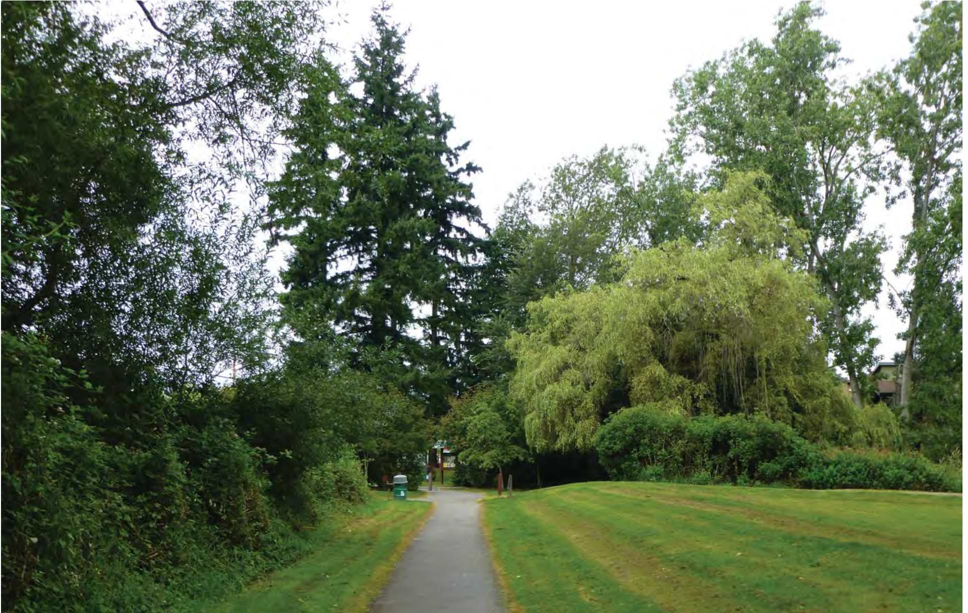
Figure G-137. Viewpoint 43 Scriber Creek Park View to the north Existing View