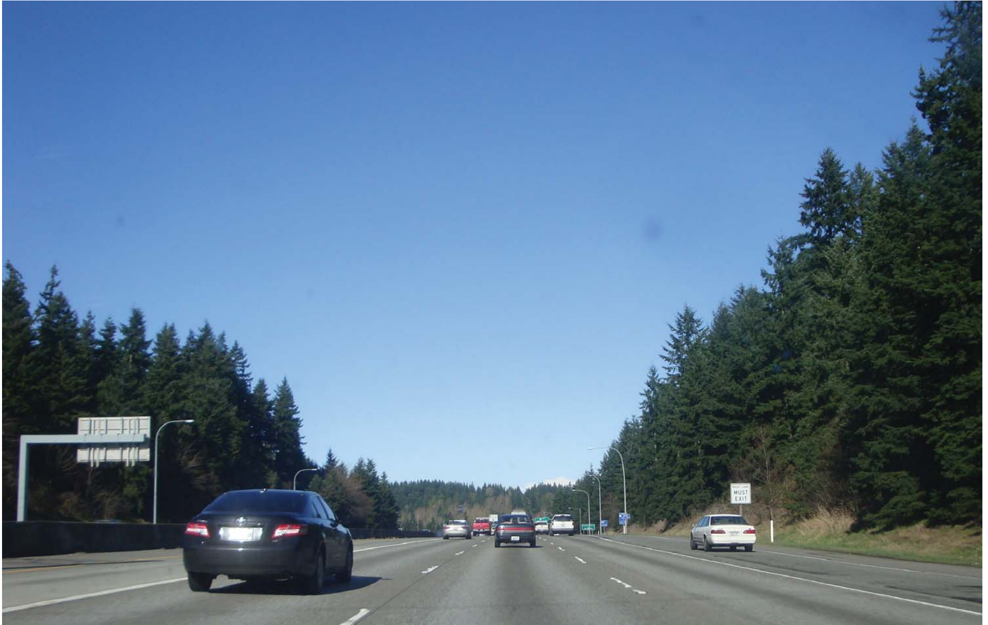
Figure G-99. Viewpoint 30 I-5 Northbound at NE 195th Street View to the north Existing View