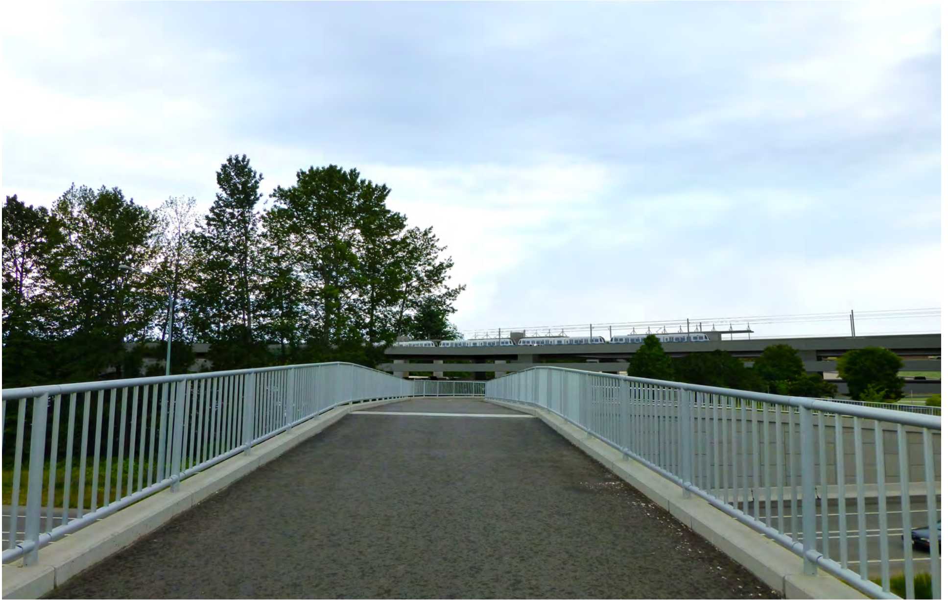
Figure G-154. Viewpoint 51 Interurban Trail at 44th Avenue West View to the west Simulation: Preferred Alternative