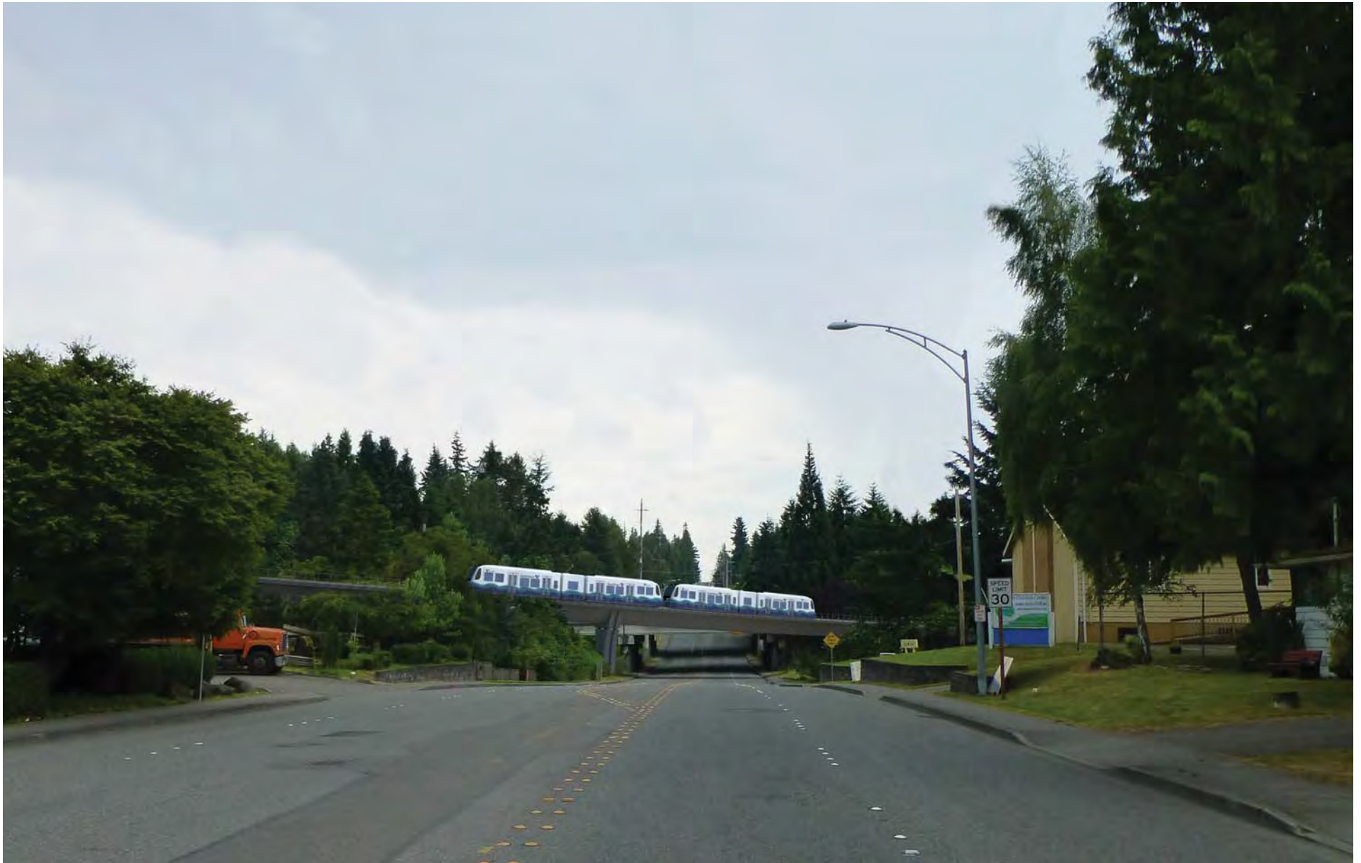
Figure G-135. Viewpoint 42 52nd Avenue West at 208th Street SW View to the south

Simulation: Preferred Alternative and Alternative C3 with Alignment Option 2 from west side of I-5