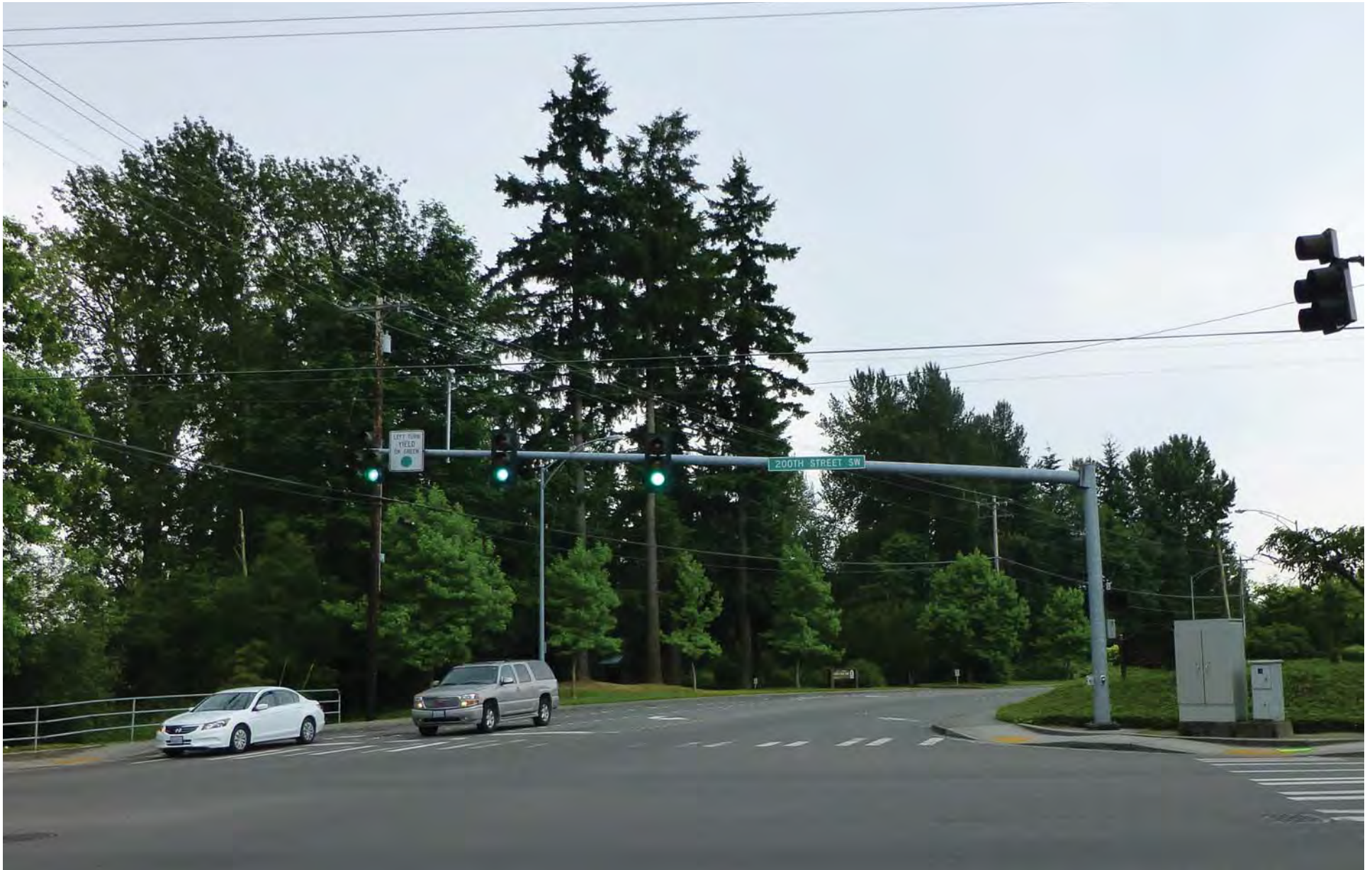
Figure G-139. Viewpoint 44 50th Avenue West at 200th Street SW View to the south Existing View