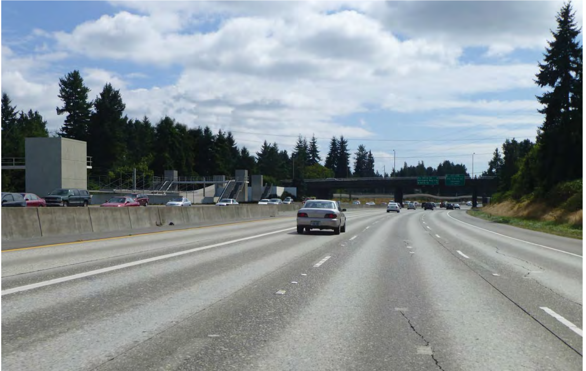
Figure G-97. Viewpoint 29 I-5 Southbound at NE 187th Street View to the south Simulation: Alternatives A5 and A10