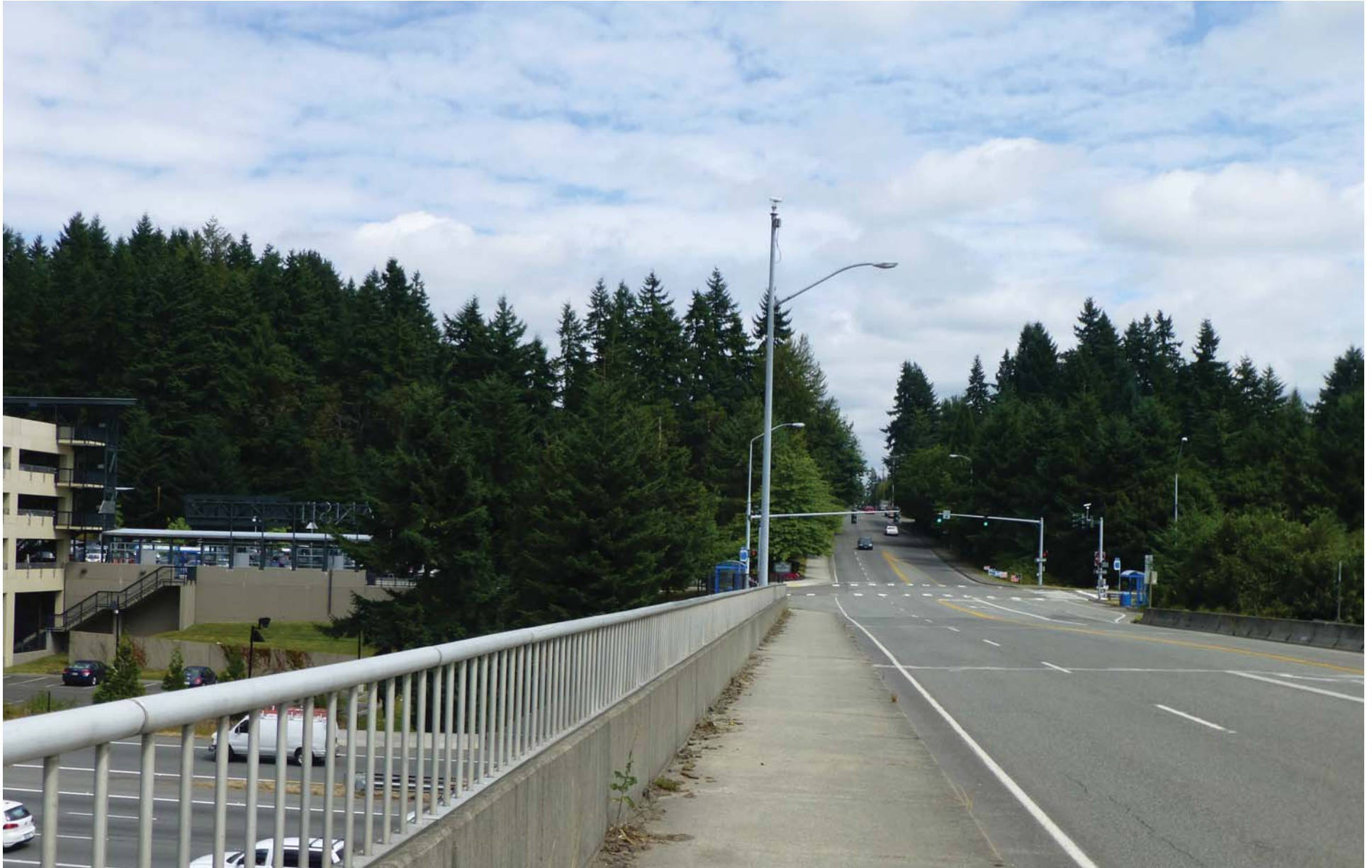
Figure G-104. Viewpoint 32 236th Street SW View to the east Existing View