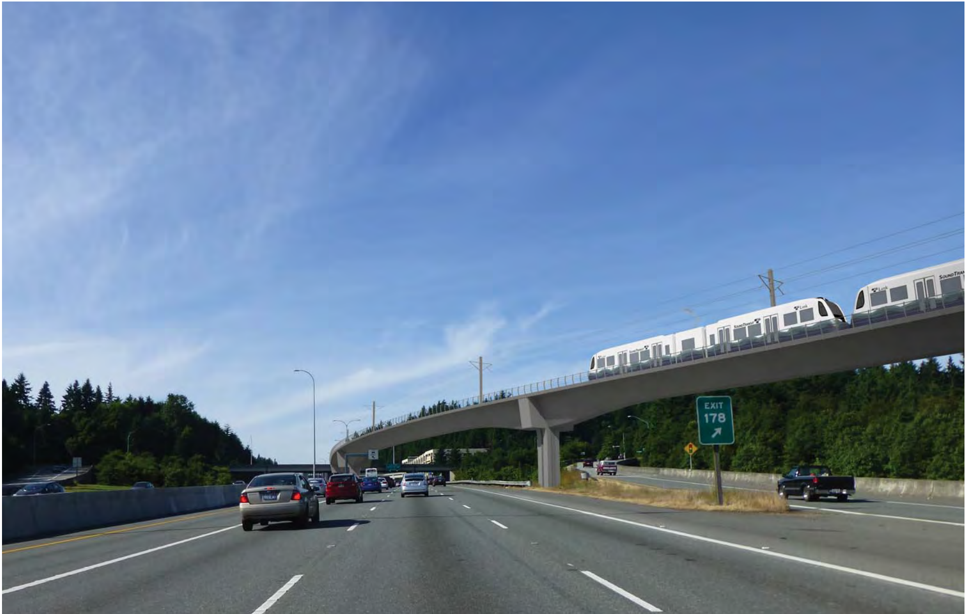
Figure G-103. Viewpoint 31 I-5 Northbound at 240th Street SW View to the north Simulation: Alternative B4