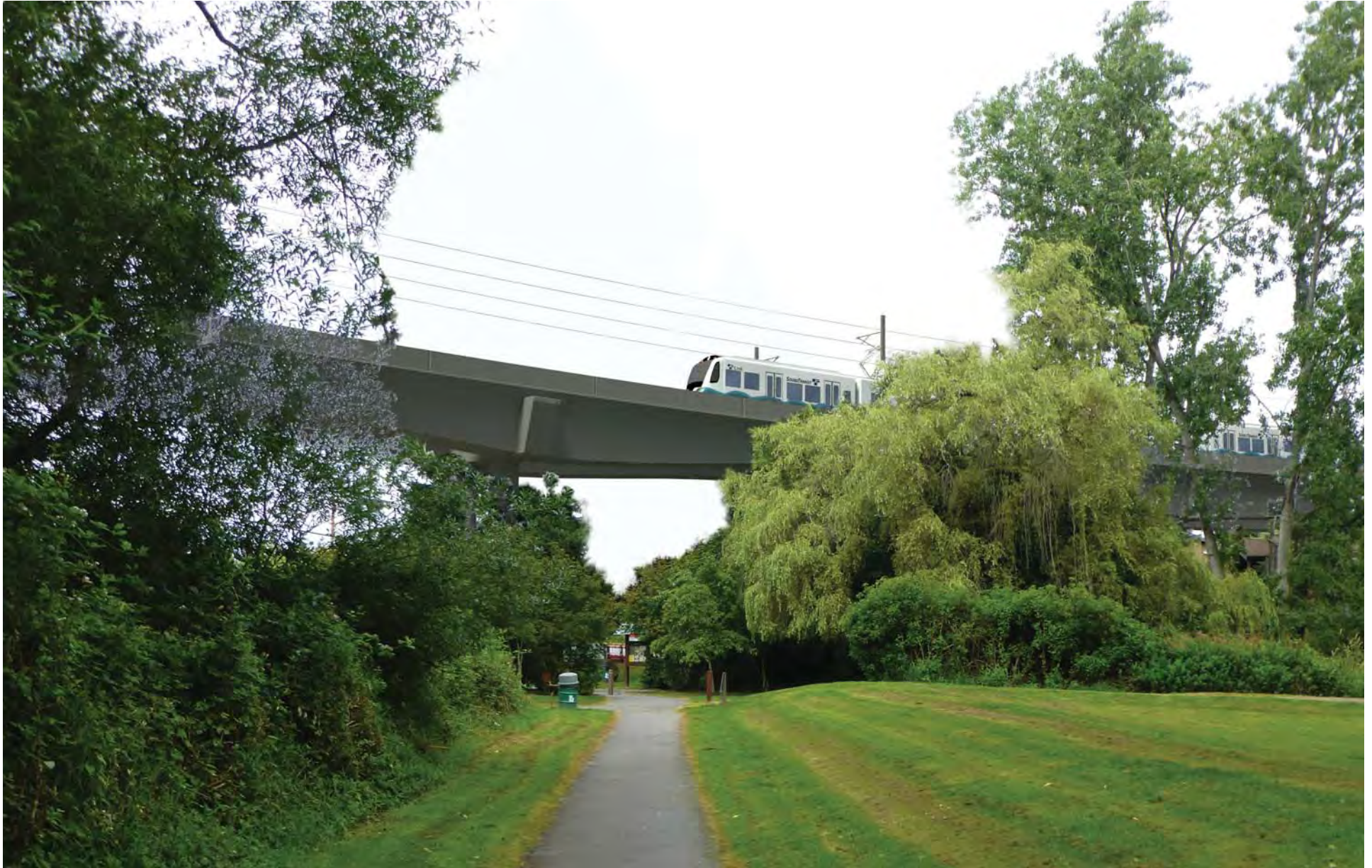
Figure G-138. Viewpoint 43 Scriber Creek Park View to the north Simulation: Alternative C1