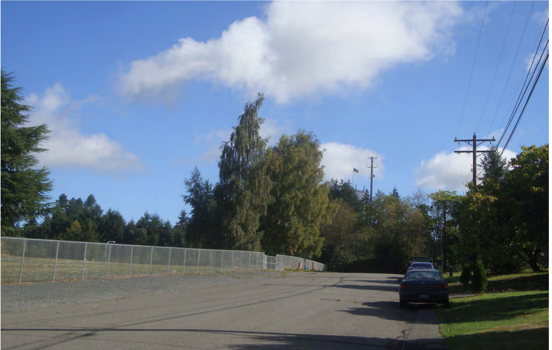
Figure G-119. Viewpoint 37 222nd Street SW east of 64th Avenue West View to the east Existing View