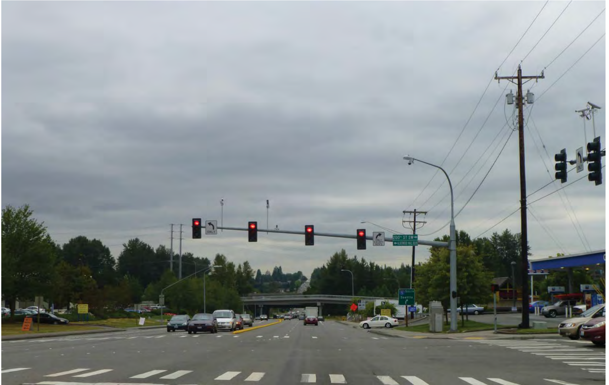
Figure G-151. Viewpoint 50 44th Avenue West from west of 200th Street SW View to the south Existing View