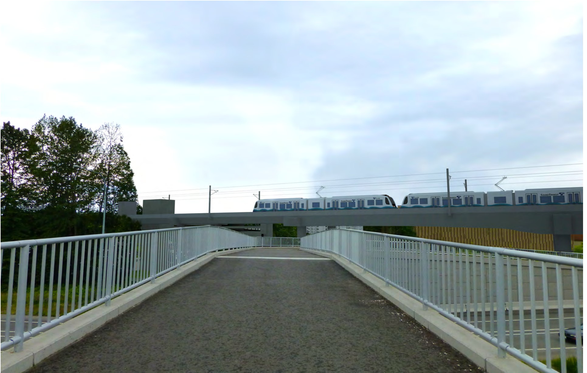
Figure G-156. Viewpoint 51 Interurban Trail at 44th Avenue West View to the west Simulation: Alternative C3