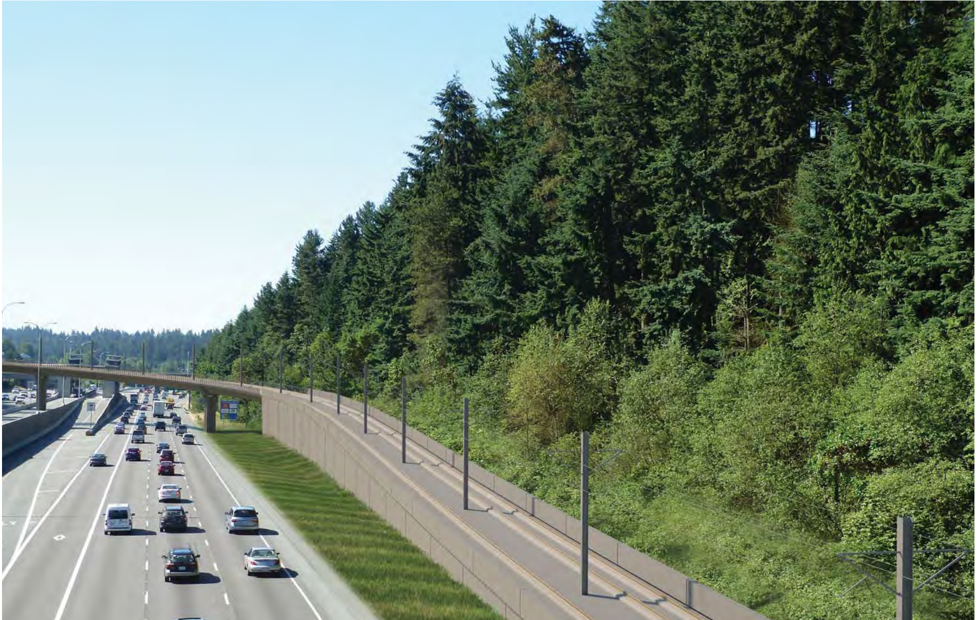
Figure G-118. Viewpoint 36 I-5 Southbound at 230th Street SW Overpass View to the south Simulation: Preferred Alternative and Alternative B2A