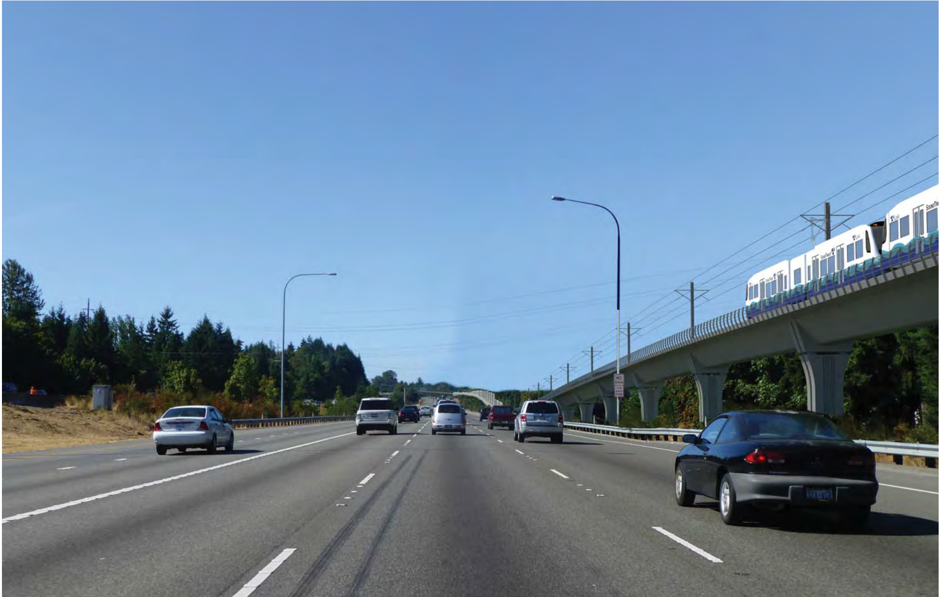
Figure G-131. Viewpoint 41 I-5 Southbound at 50th Avenue West View to the south Simulation: Preferred Alternative and Alternative C3 with Alignment Option 2 on west side