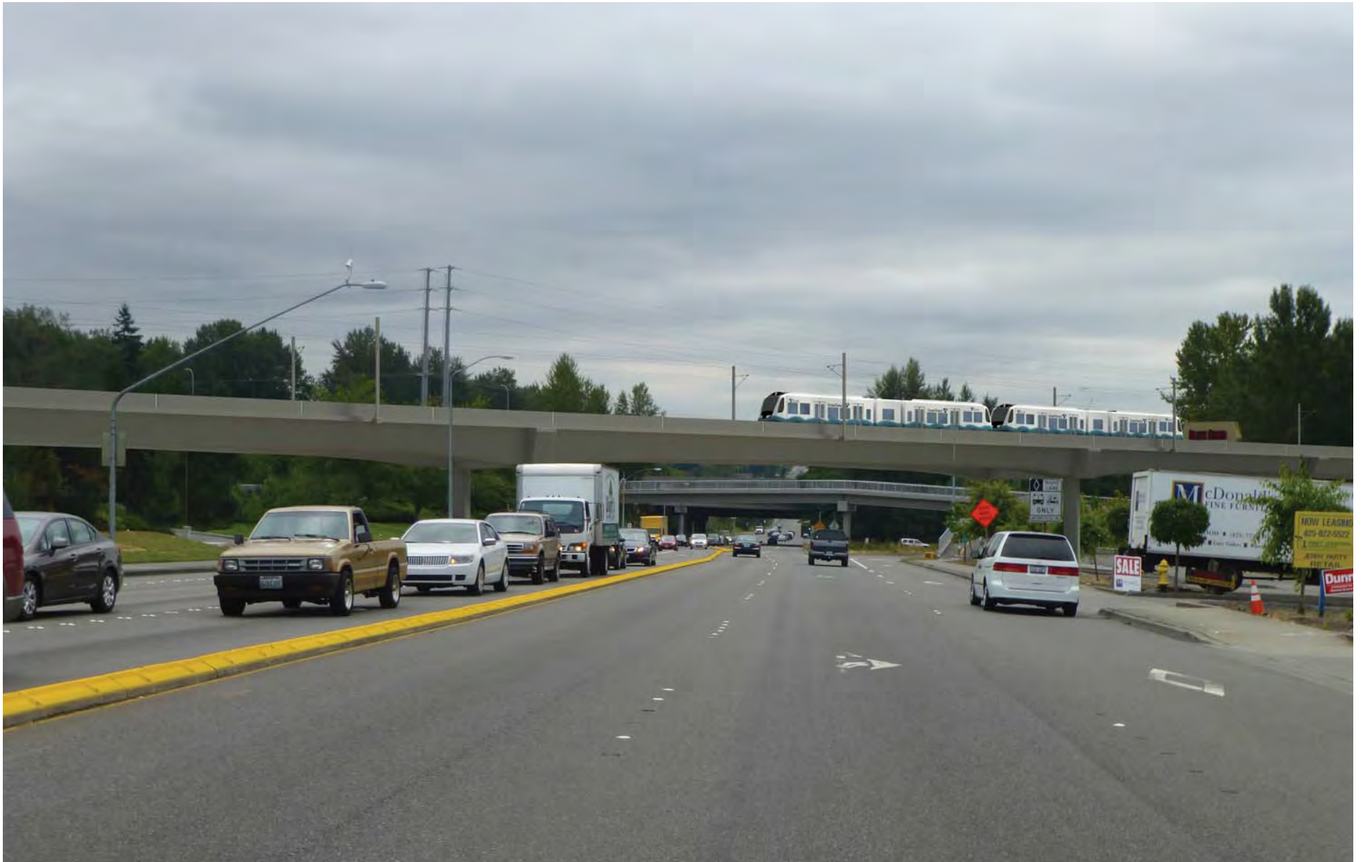
Figure G-150. Viewpoint 49 44th Avenue West View to the south Simulation: Alternative C3