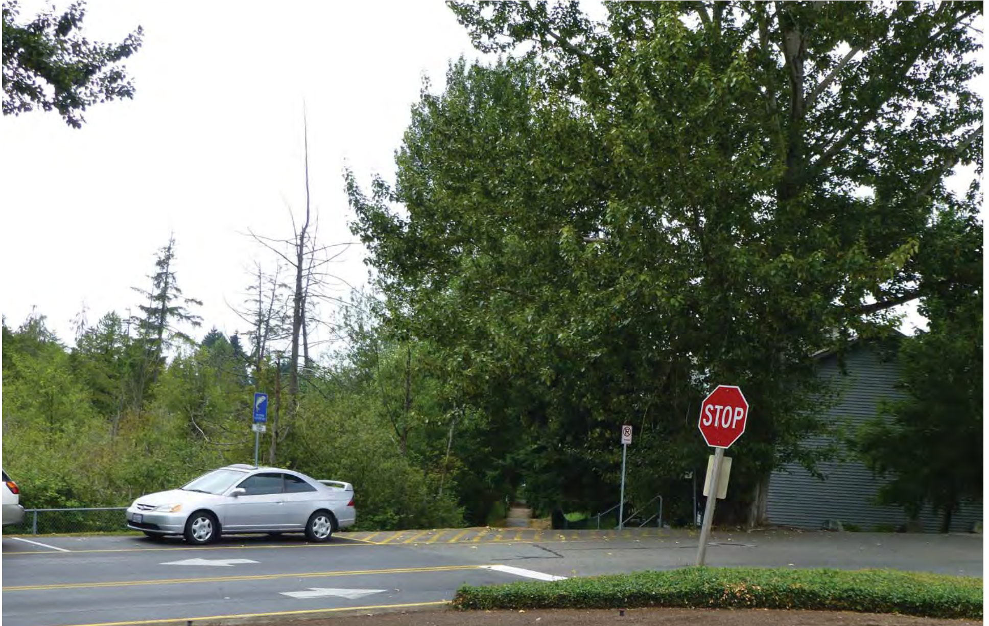
Figure G-145. Viewpoint 47 Lynnwood Transit Center View to the west to Scriber Creek Trail Existing View