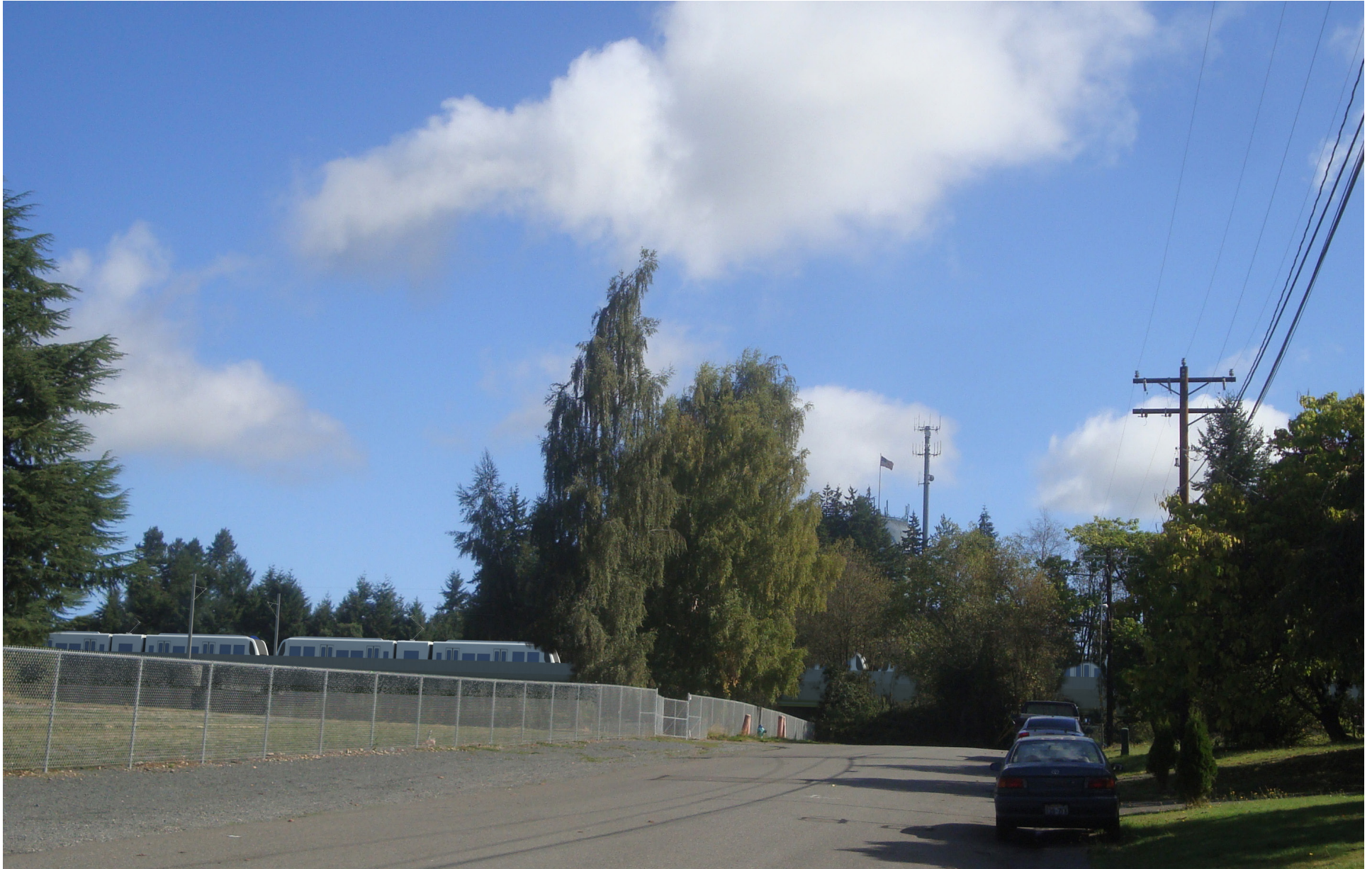
Figure G-120A. Viewpoint 37 222nd Street SW east of 64th Avenue West View to the east Simulation: Preferred Alternative and Alternative B2A