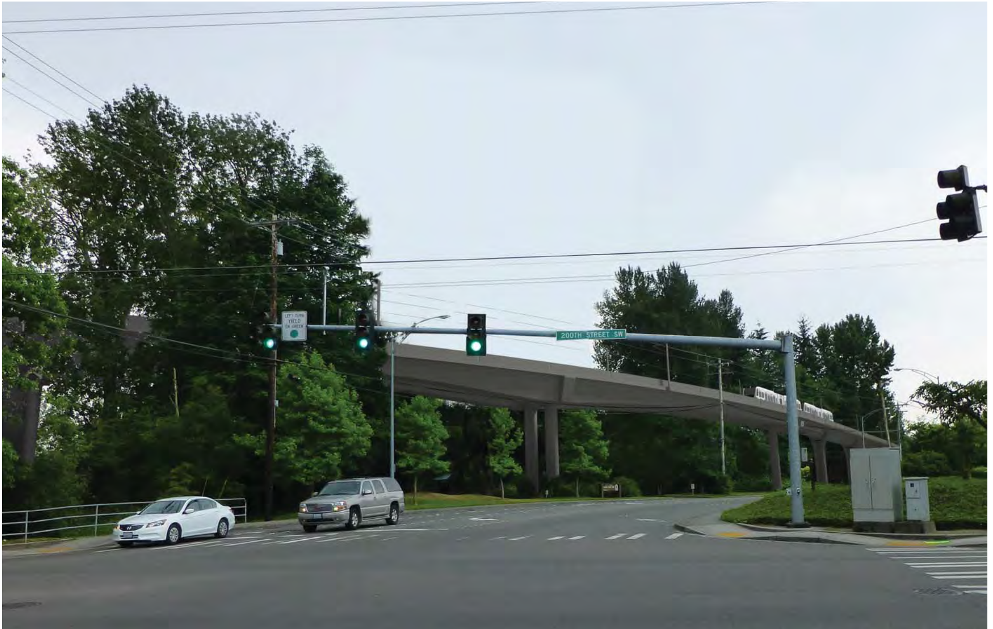
Figure G-140. Viewpoint 44 50th Avenue West at 200th Street SW View to the south Simulation: Alternative C1