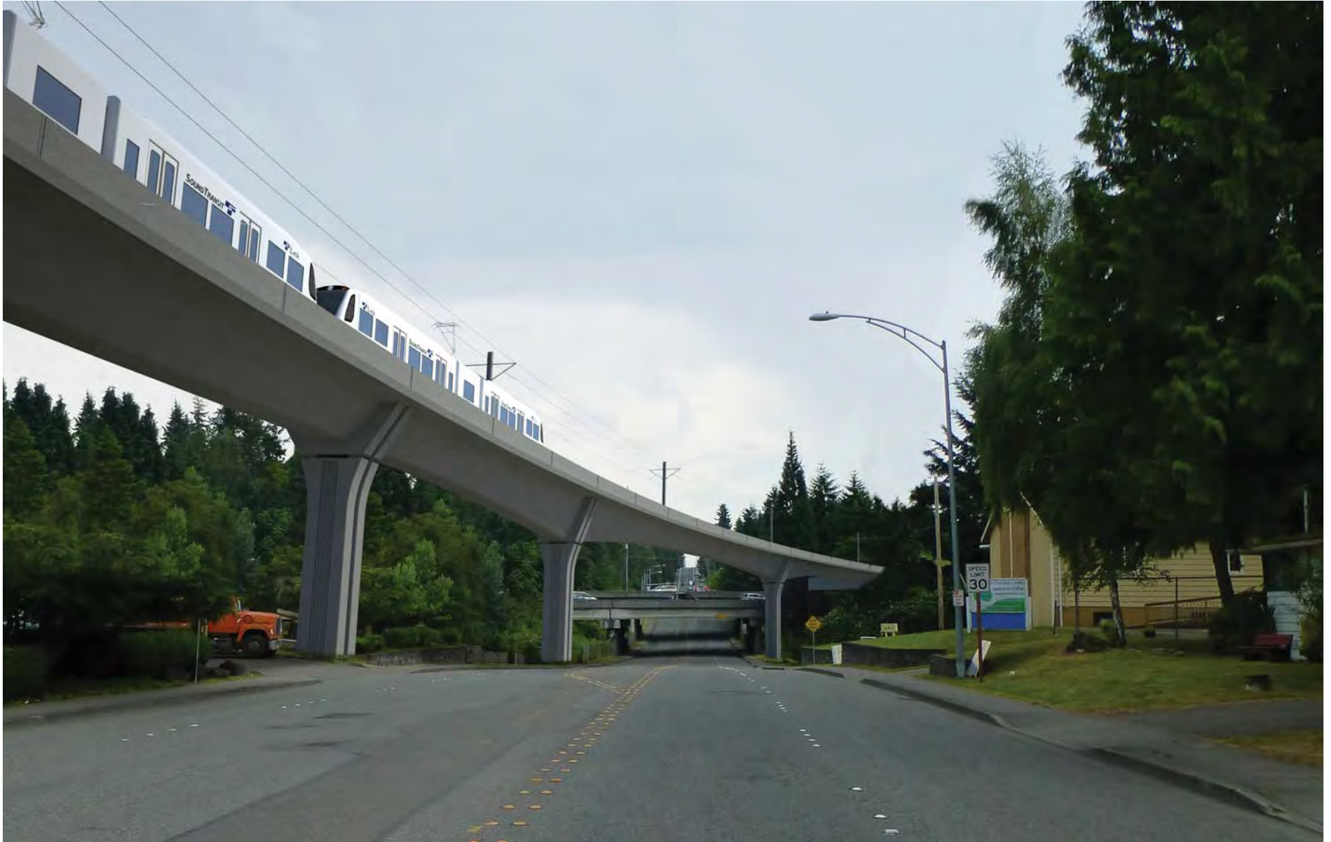
Figure G-136. Viewpoint 42 52nd Avenue West at 208th Street SW View to the south Simulation: Alternatives C1 and C2 with Alignment Option 1 from I-5 Median