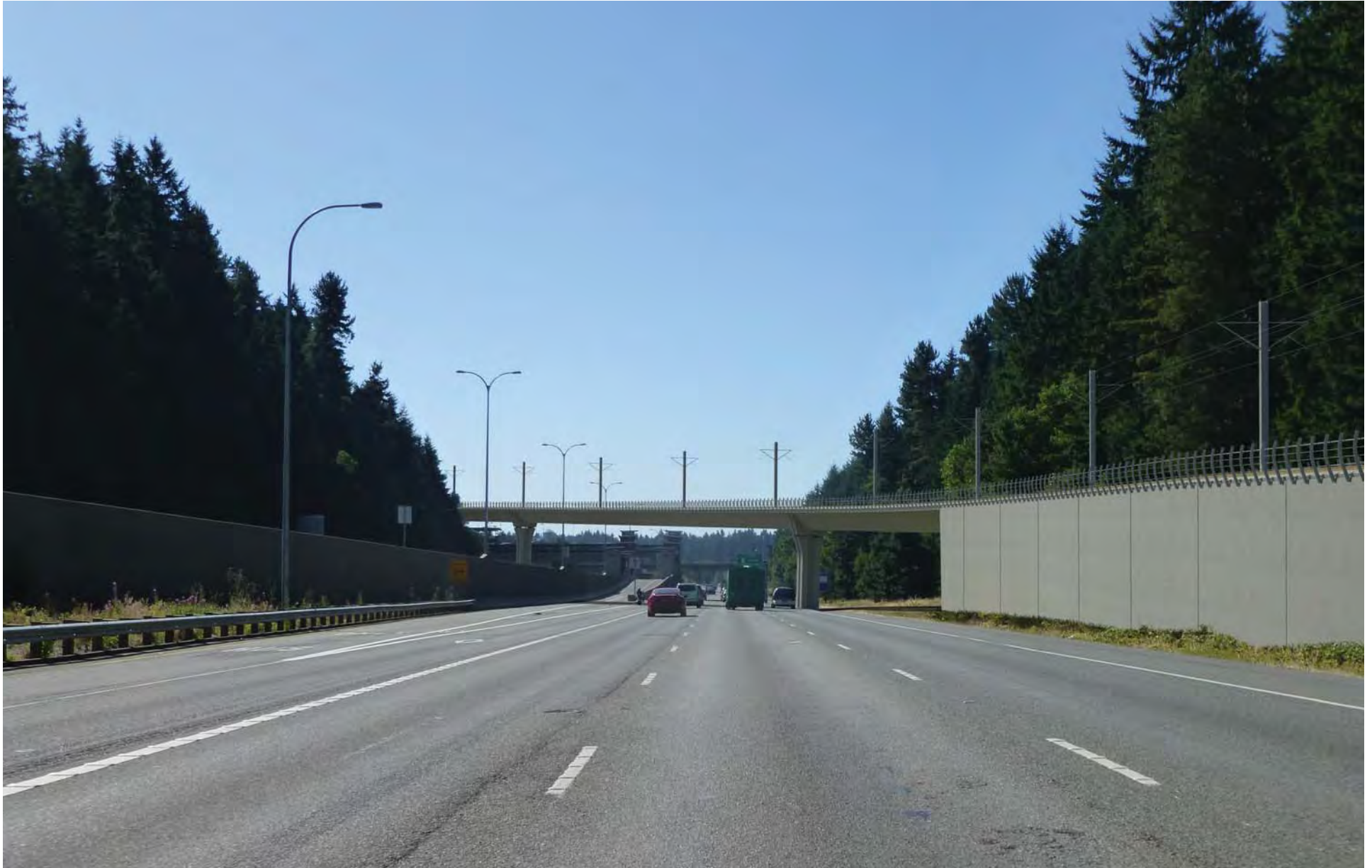
Figure G-112. Viewpoint 34 I-5 Southbound at 230th Street SW View to the south Simulation: Preferred Alternative and Alternative B2A