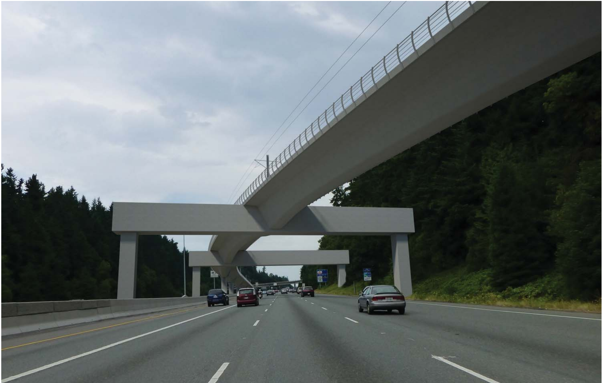
Figure G-109. Viewpoint 33 I-5 Northbound at 232nd Street SW View to the north Simulation: Alternative B1