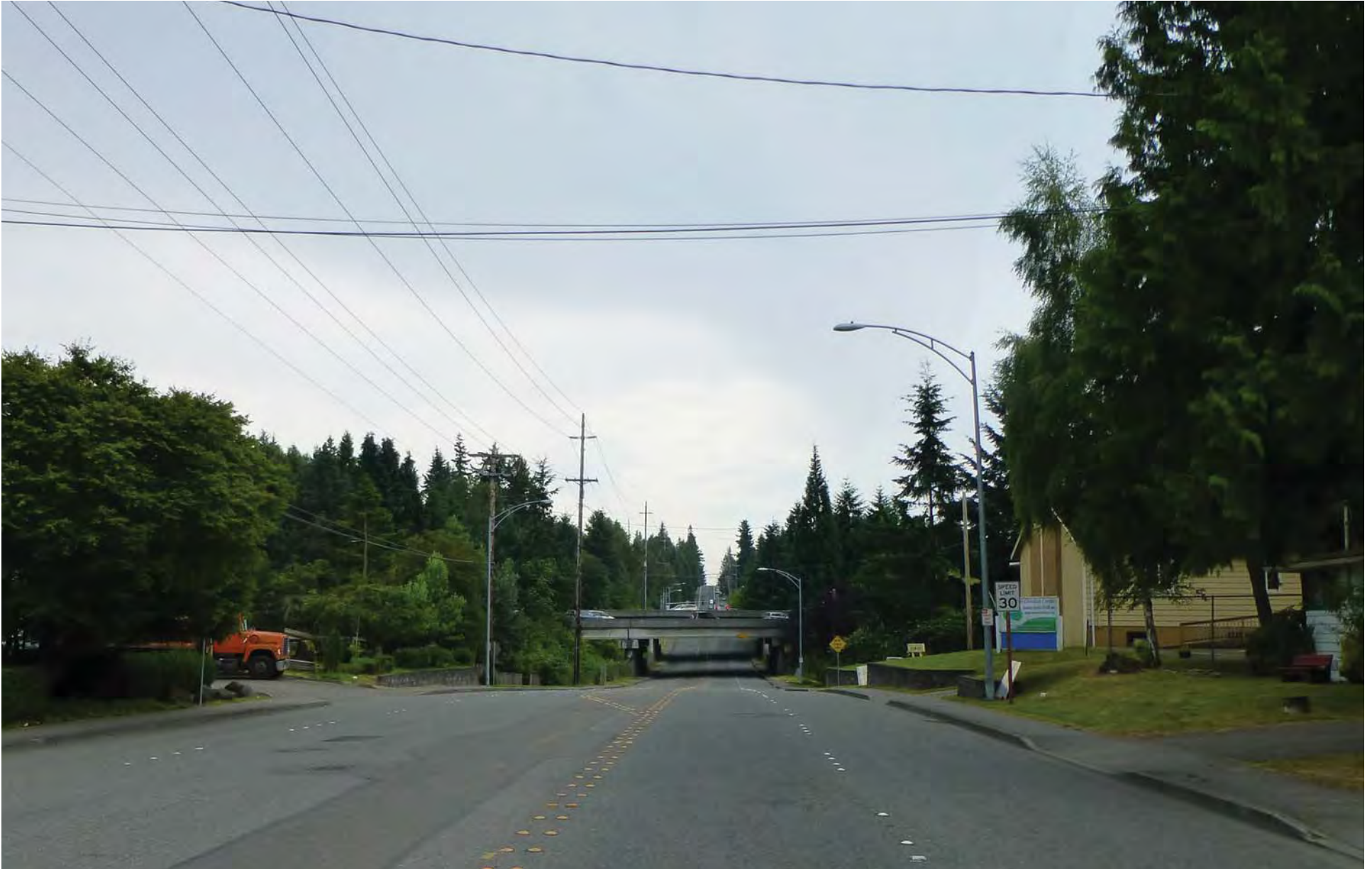
Figure G-134. Viewpoint 42 52nd Avenue West at 208th Street SW View to the south Existing View