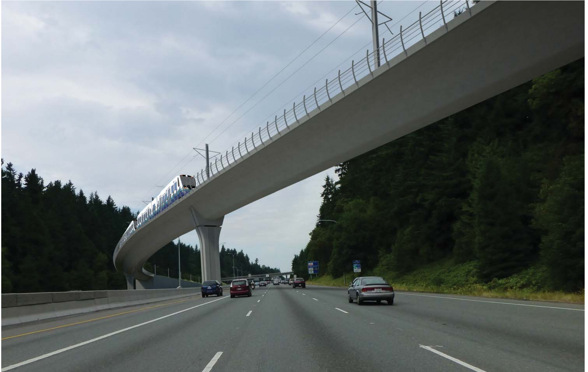
Figure G-108. Viewpoint 33 I-5 Northbound at 232nd Street SW View to the north Simulation: Preferred Alternative and Alternative B2A