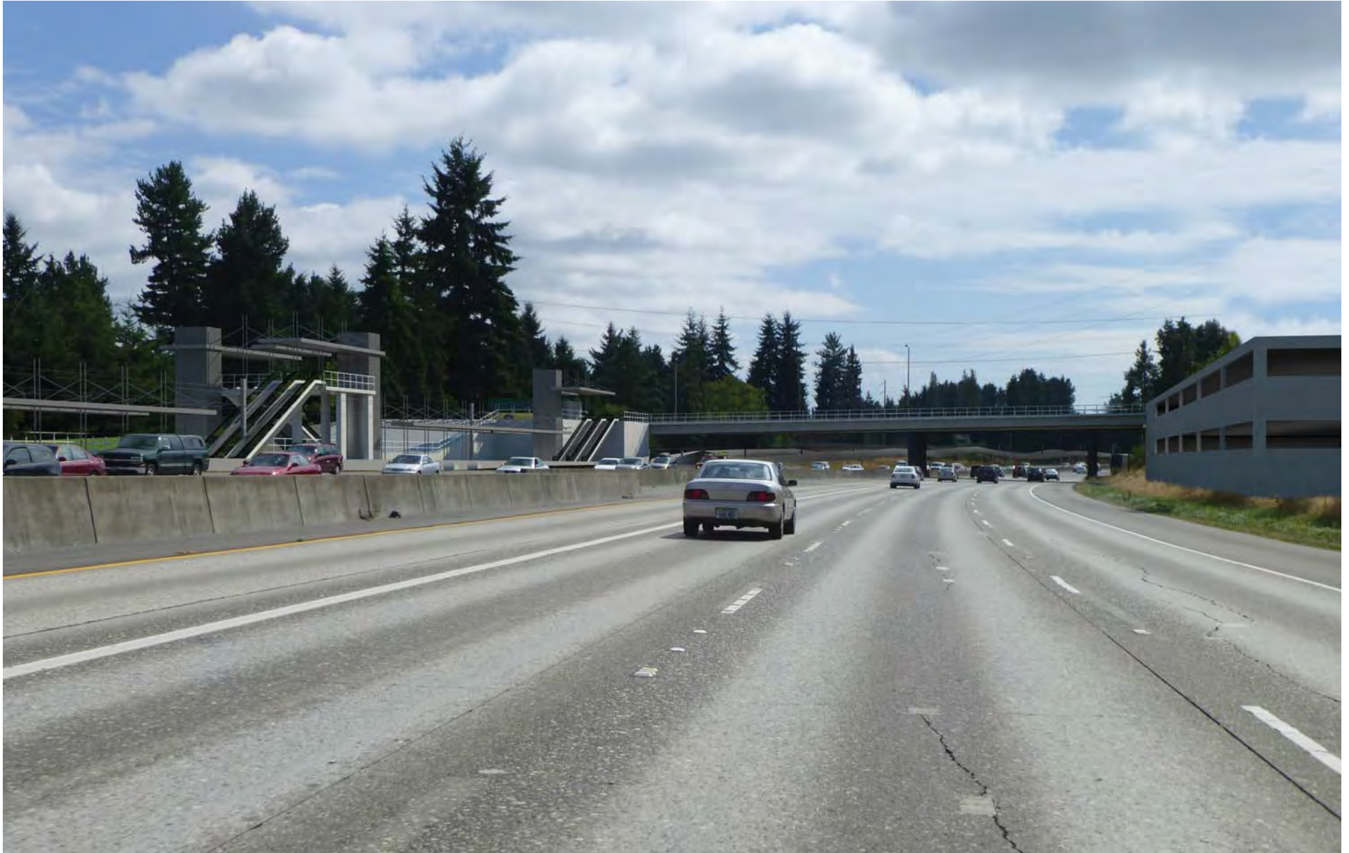
Figure G-95. Viewpoint 29 I-5 Southbound at NE 187th Street View to the south Simulation: Alternative A1