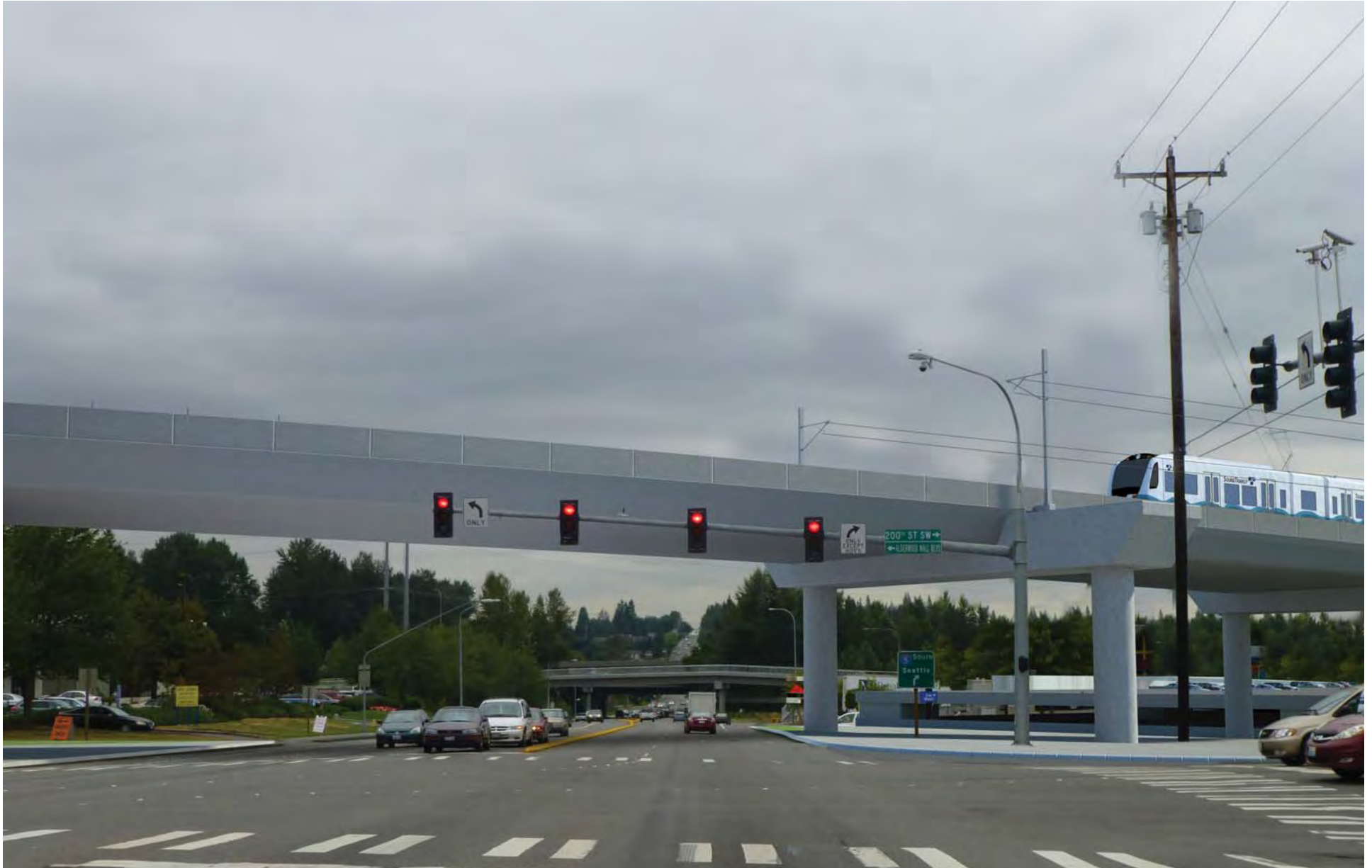
Figure G-152. Viewpoint 50 44th Avenue West from west of 200th Street SW View to the south Simulation: Preferred Alternative