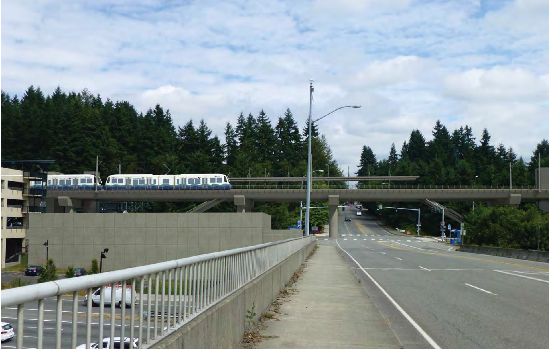
Figure G-105. Viewpoint 32 236th Street SW View to the east Simulation: Preferred Alternative and Alternatives B1 and B2A