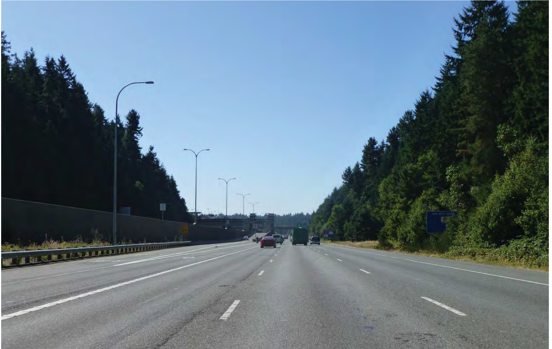
Figure G-111. Viewpoint 34 I-5 Southbound at 230th Street SW View to the south Existing View