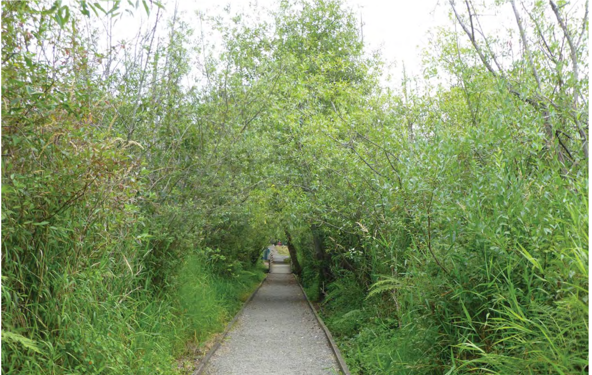
Figure G-143. Viewpoint 46 Scriber Park Trail View to the east Existing View