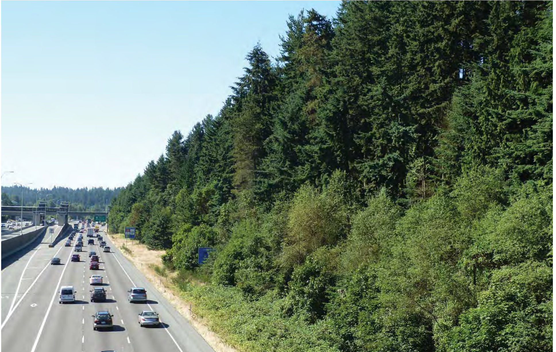
Figure G-117. Viewpoint 36 I-5 Southbound at 230th Street SW Overpass View to the south Existing View