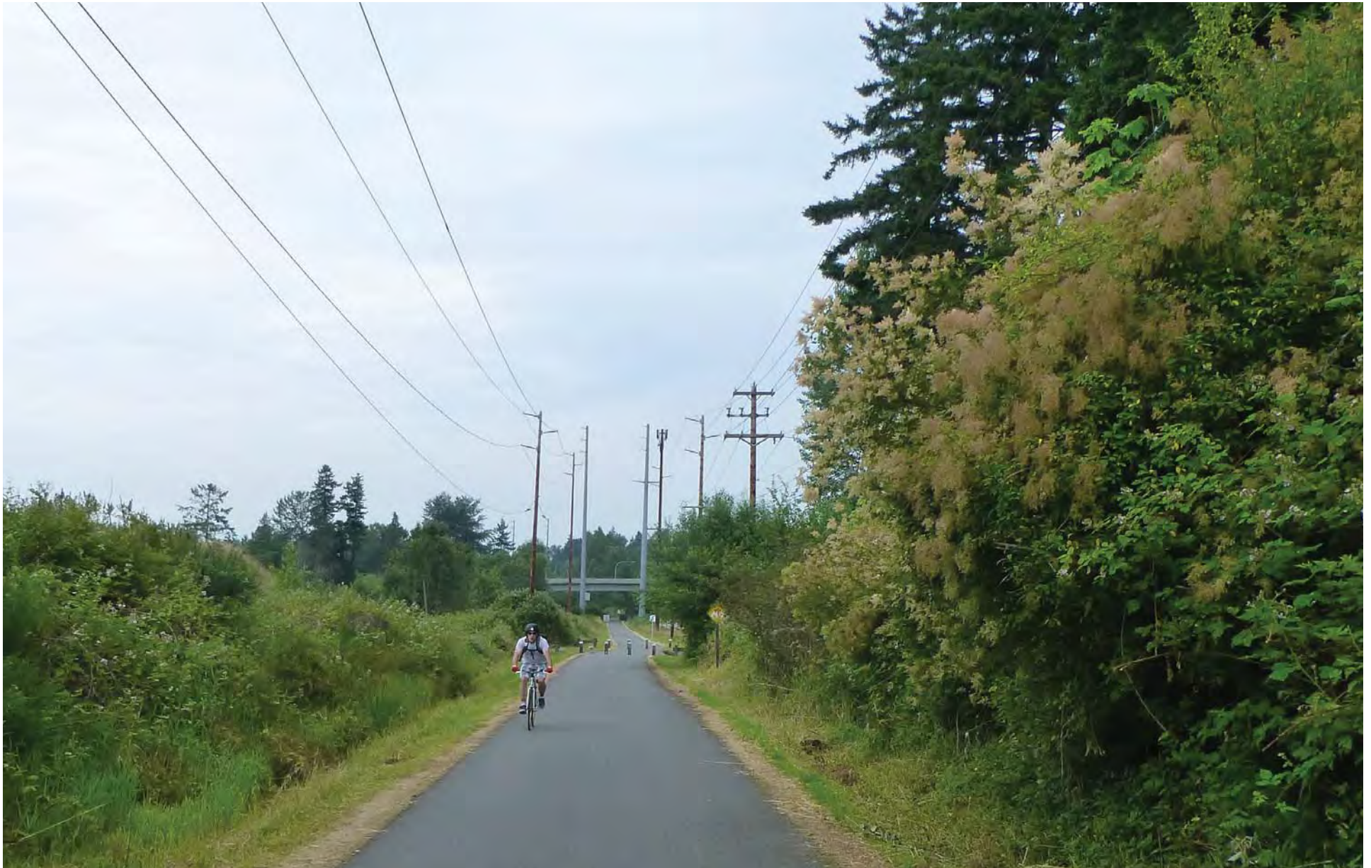
Figure G-147. Viewpoint 48 Interurban Trail at 48th Avenue West View to the west Existing View