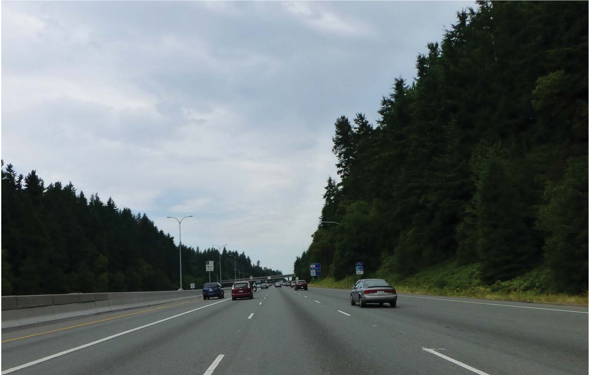
Figure G-107. Viewpoint 33 I-5 Northbound at 232nd Street SW View to the north Existing View