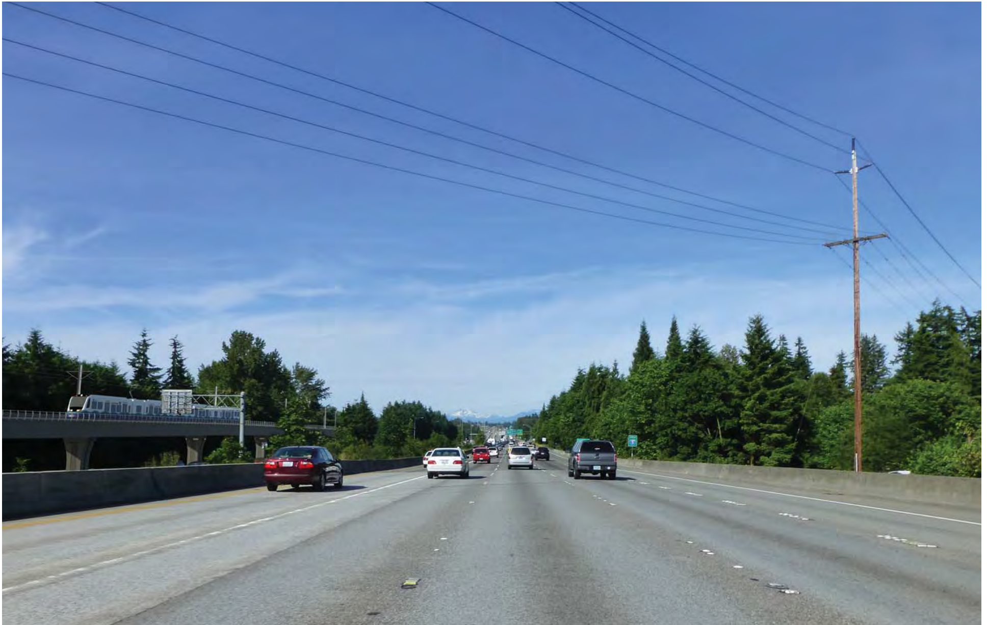
Figure G-125. Viewpoint 39 I-5 Northbound at 212th Street SW View to the north Simulation: Preferred Alternative and Alternative B2A (Transitioning to Segment C alternatives with west side option)