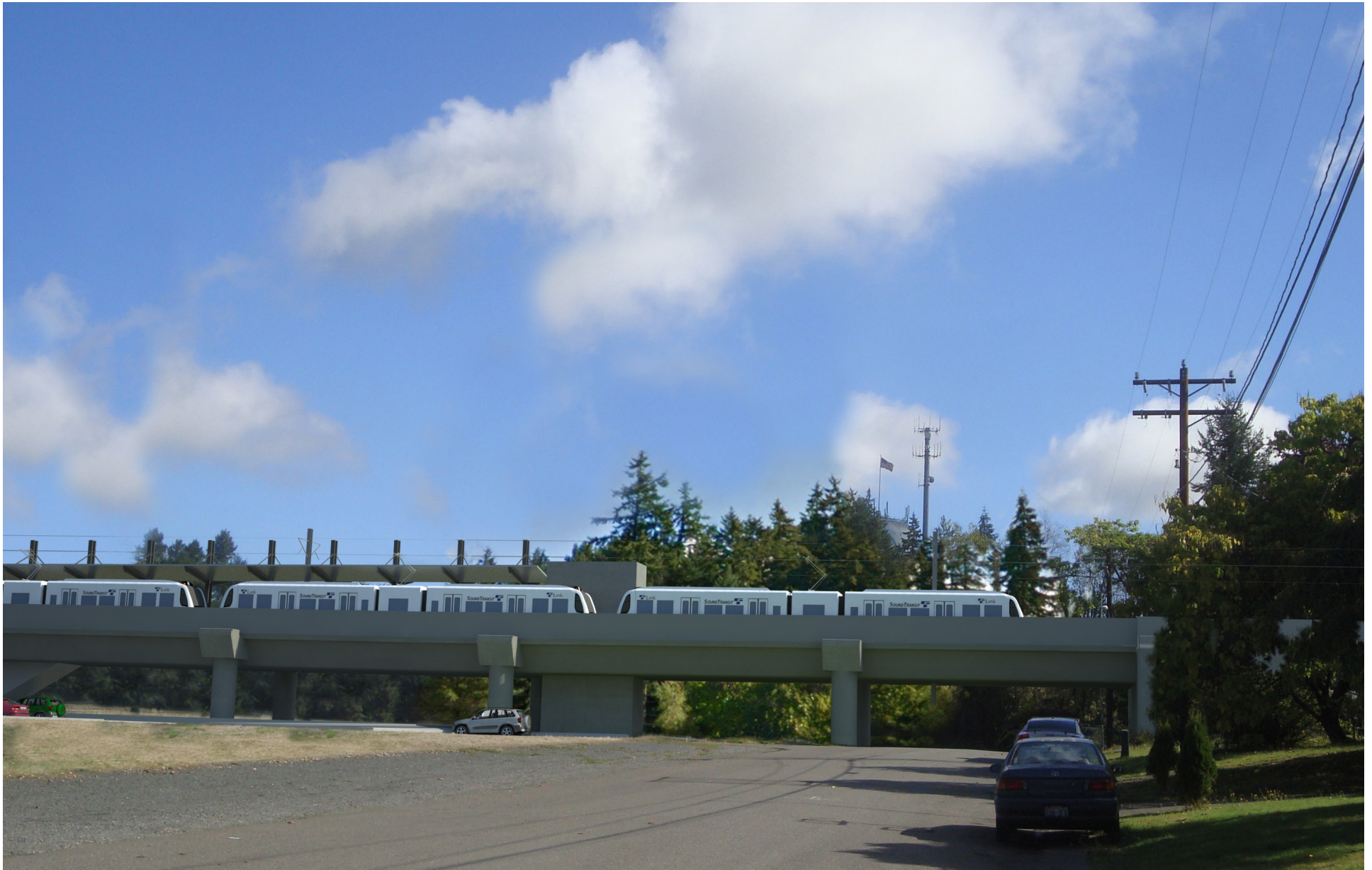
Figure G-120B. Viewpoint 37 222nd Street SW east of 64th Avenue West View to the east Simulation: Preferred Alternative with 220th Street SW Station Option