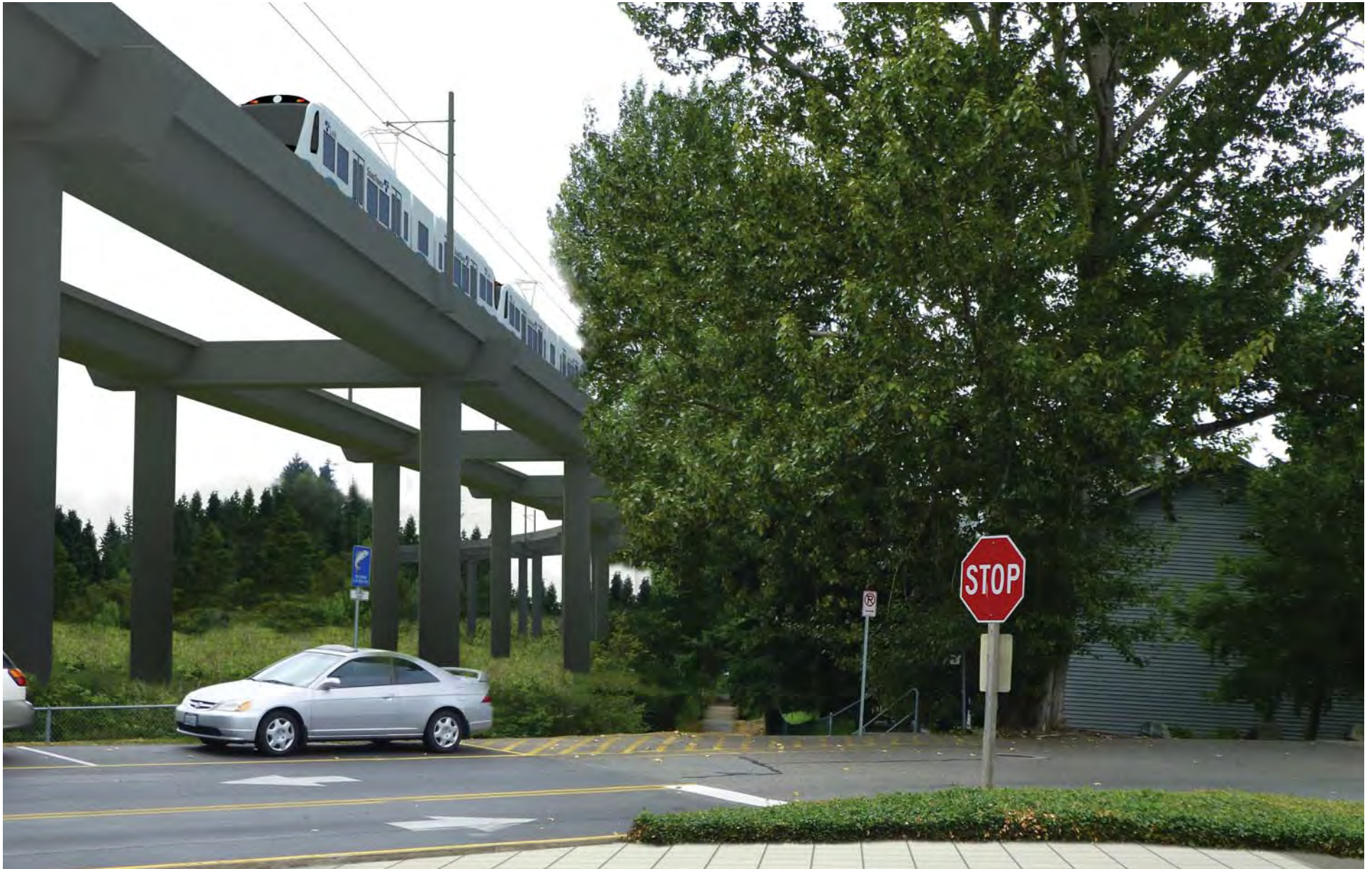
Figure G-146. Viewpoint 47 Lynnwood Transit Center View to the west to Scriber Creek Trail Simulation: Alternative C2