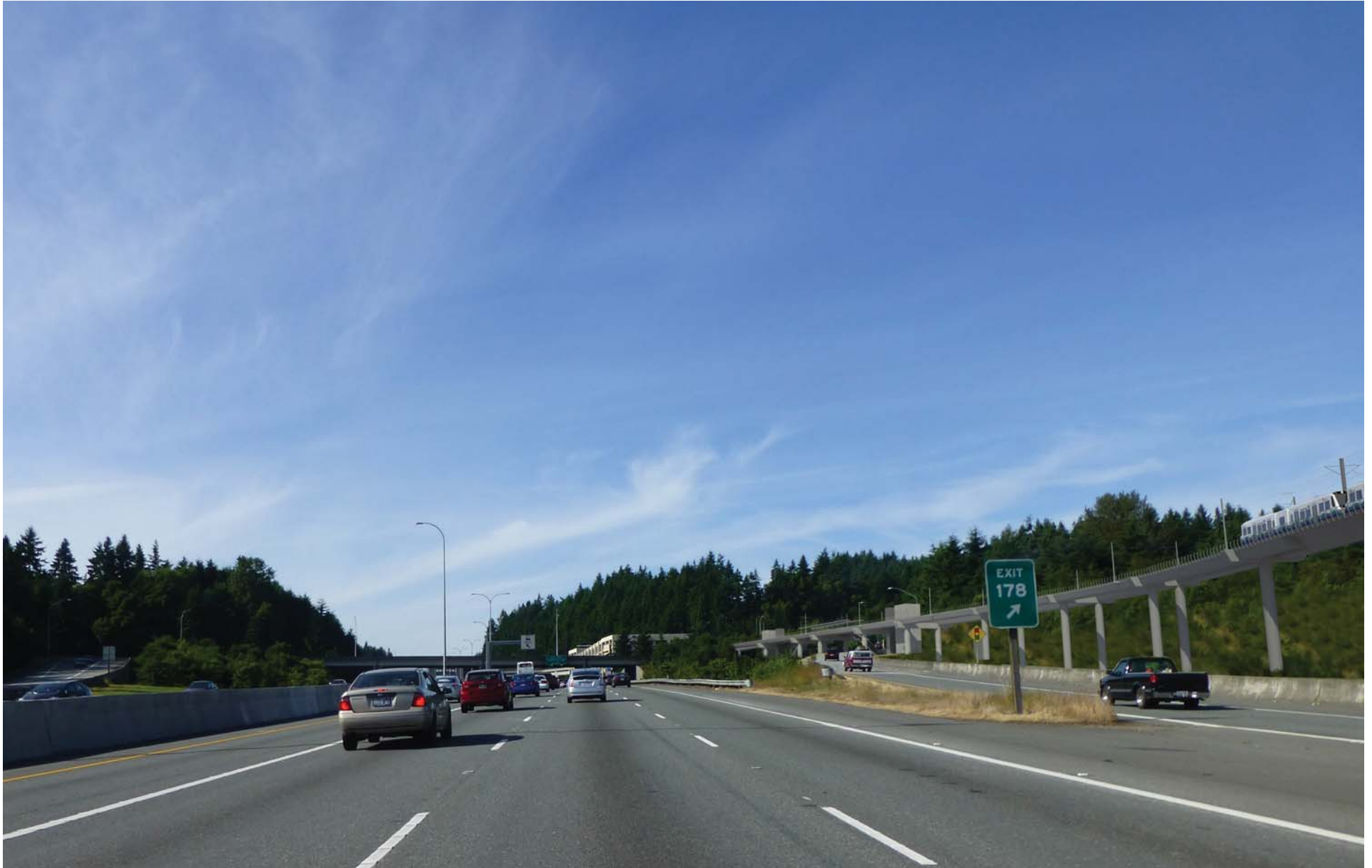
Figure G-102. Viewpoint 31 I-5 Northbound at 240th Street SW View to the north Simulation: Preferred Alternative and Alternatives B1 and B2A