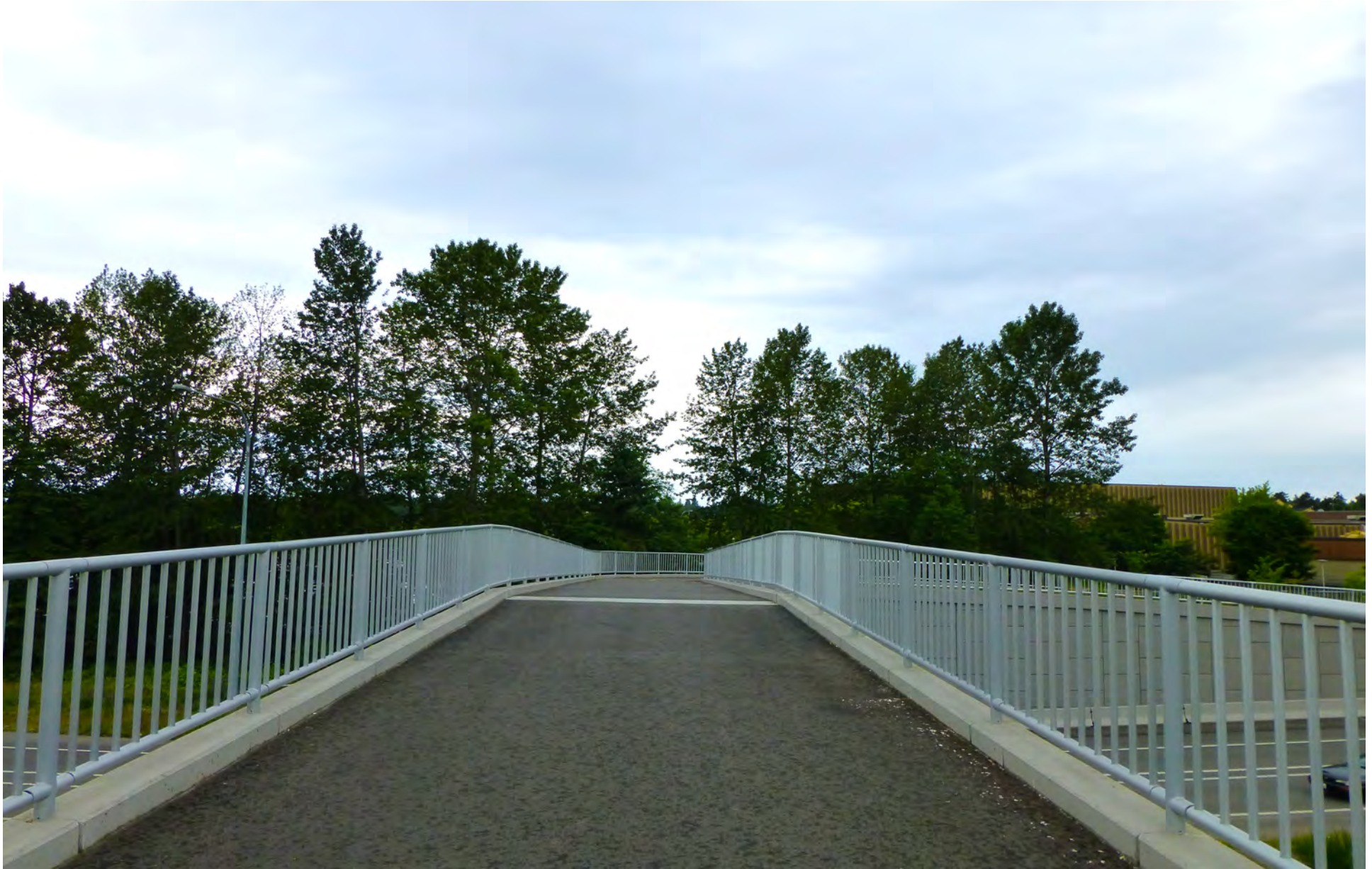
Figure G-153. Viewpoint 51 Interurban Trail at 44th Avenue West View to the west Existing View