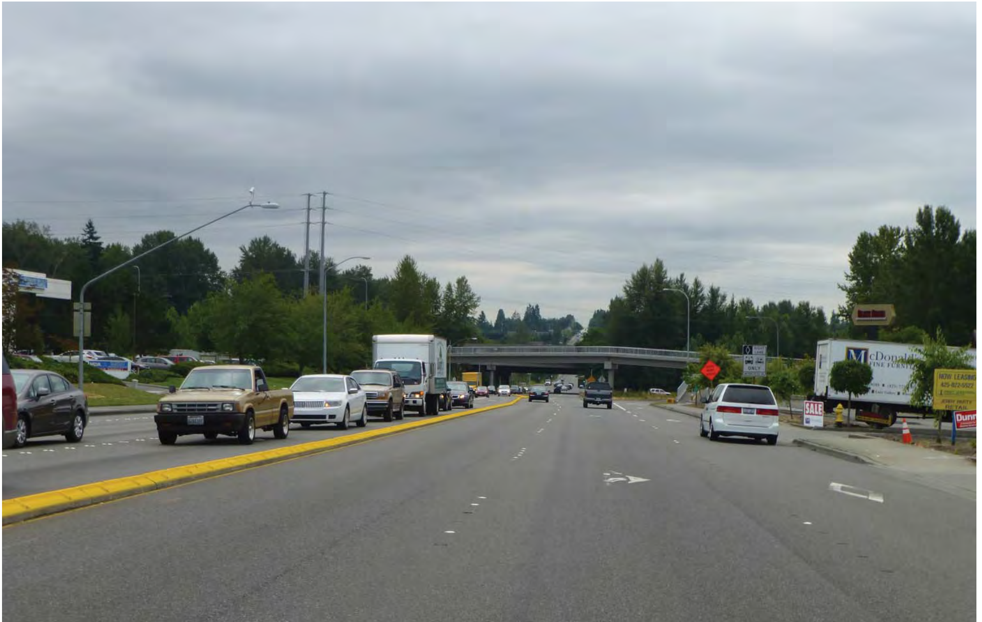
Figure G-149. Viewpoint 49 44th Avenue West View to the south Existing View