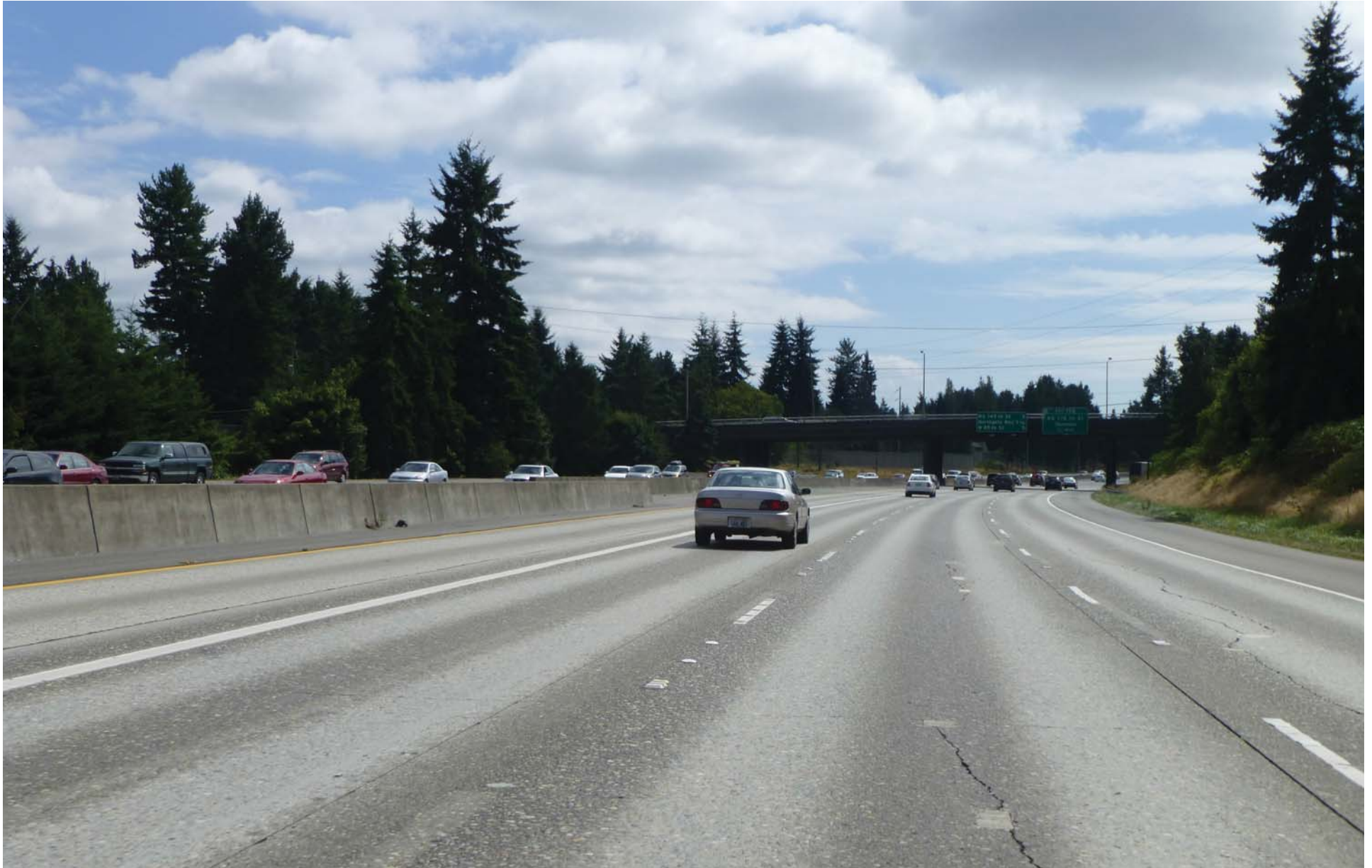
Figure G-93. Viewpoint 29 I-5 Southbound at NE 187th Street View to the south Existing View