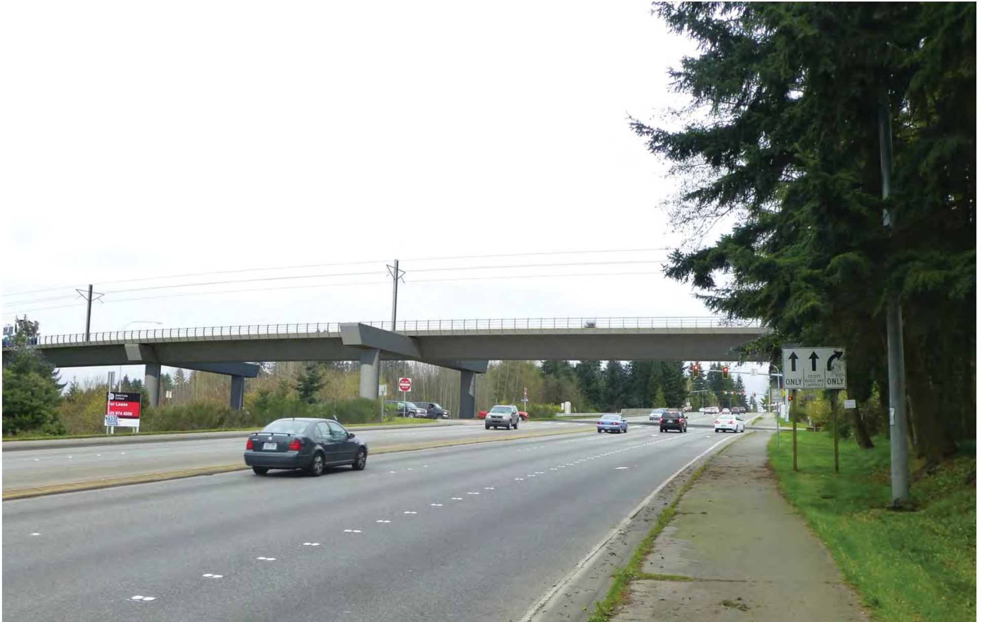
Figure G-122. Viewpoint 38 220th Street SW, west of I-5 View to the east Simulation: Preferred Alternative