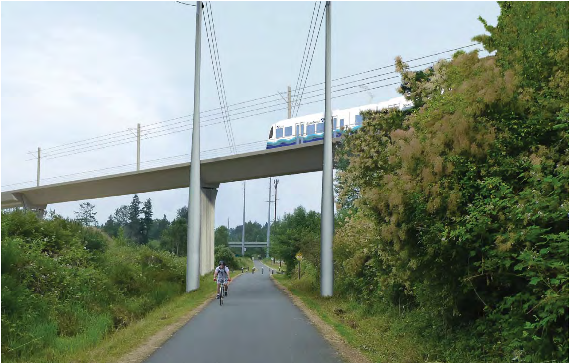
Figure G-148. Viewpoint 48 Interurban Trail at 48th Avenue West View to the west Simulation: Preferred Alternative and Alternative C3