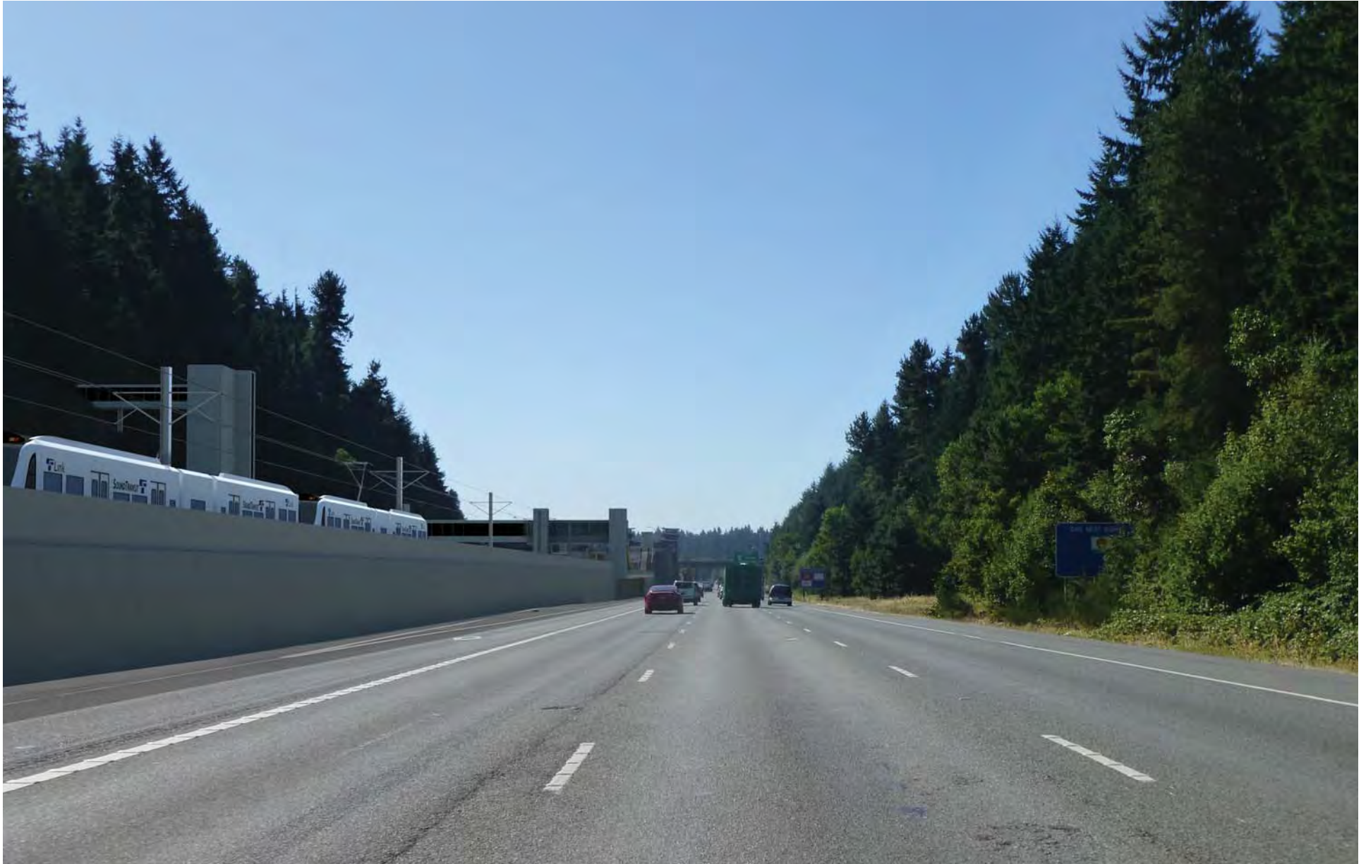
Figure G-114. Viewpoint 34 I-5 Southbound at 230th Street SW View to the south Simulation: Alternative B4