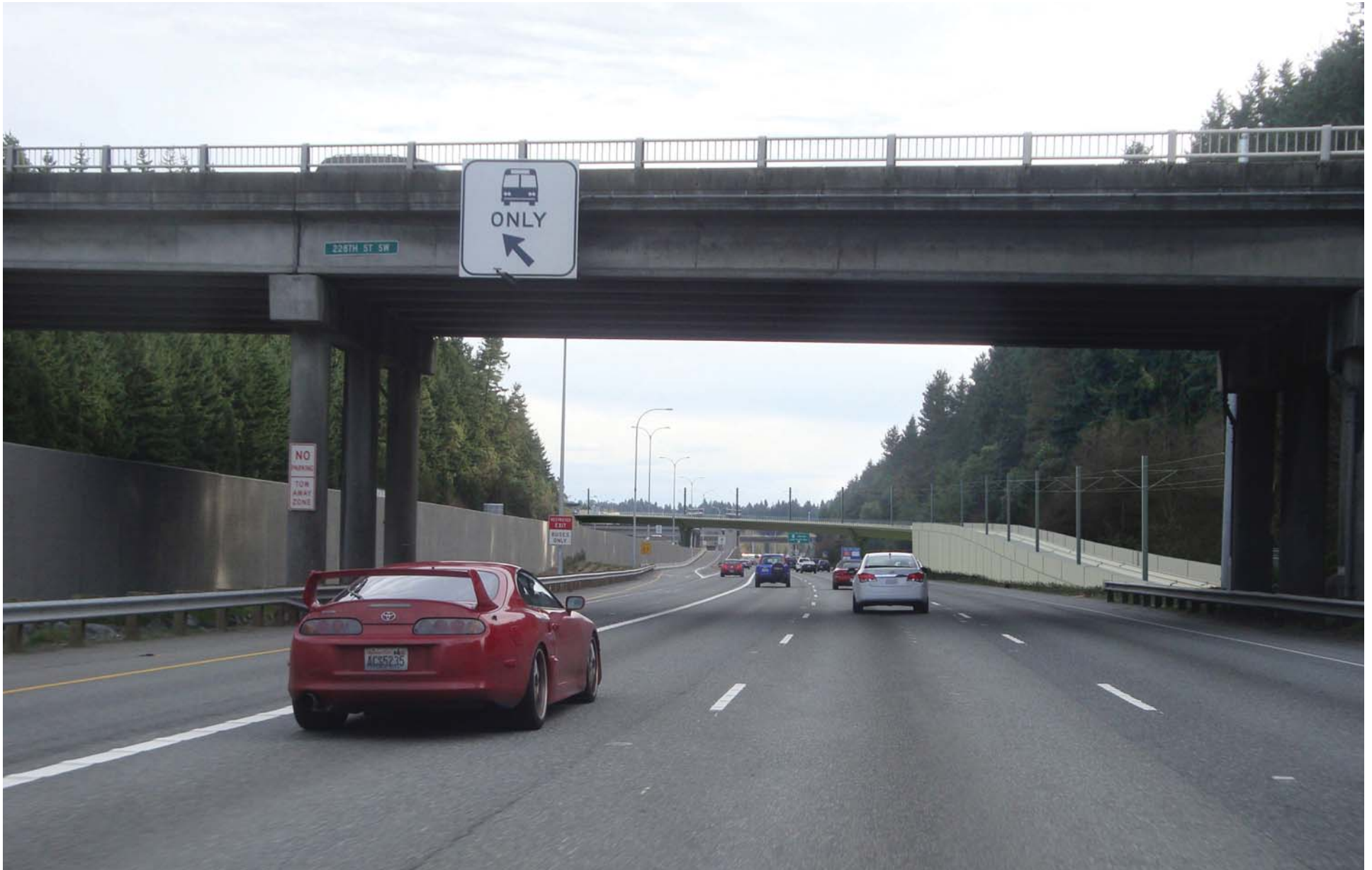
Figure G-116. Viewpoint 35 I-5 Southbound at 230th Street SW View to the south Simulation: Preferred Alternative and Alternative B2A