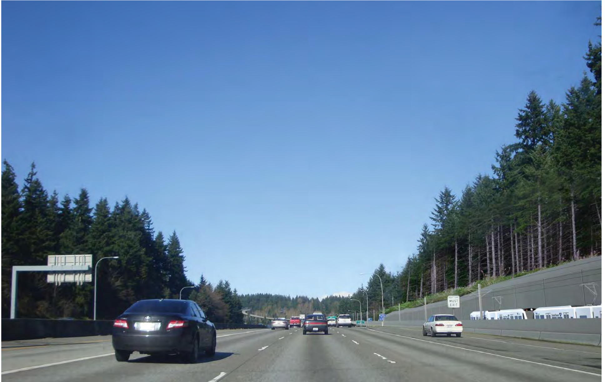
Figure G-100. Viewpoint 30 I-5 Northbound at NE 195th Street View to the north Simulation: All Alternatives