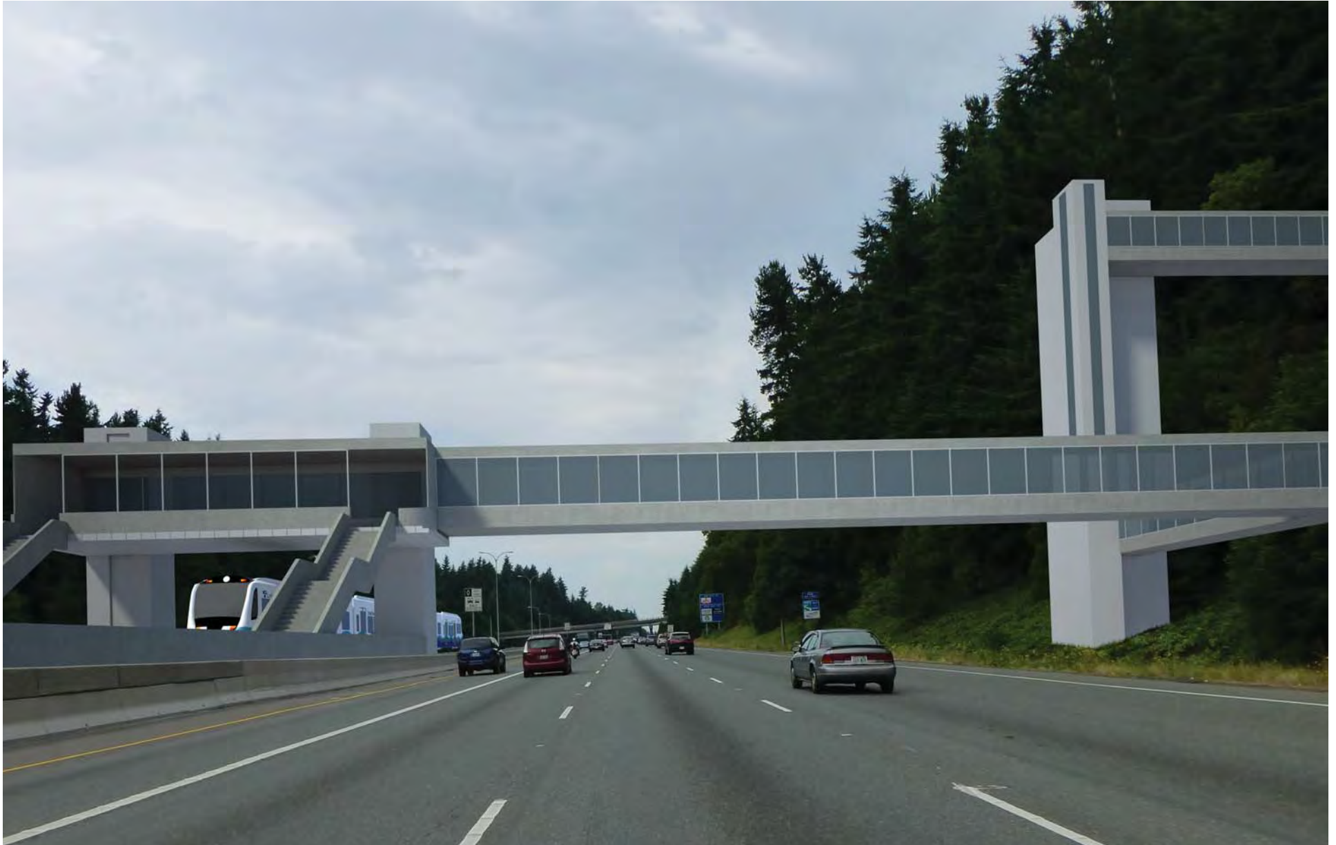
Figure G-110. Viewpoint 33 I-5 Northbound at 232nd Street SW View to the north Simulation: Alternative B4