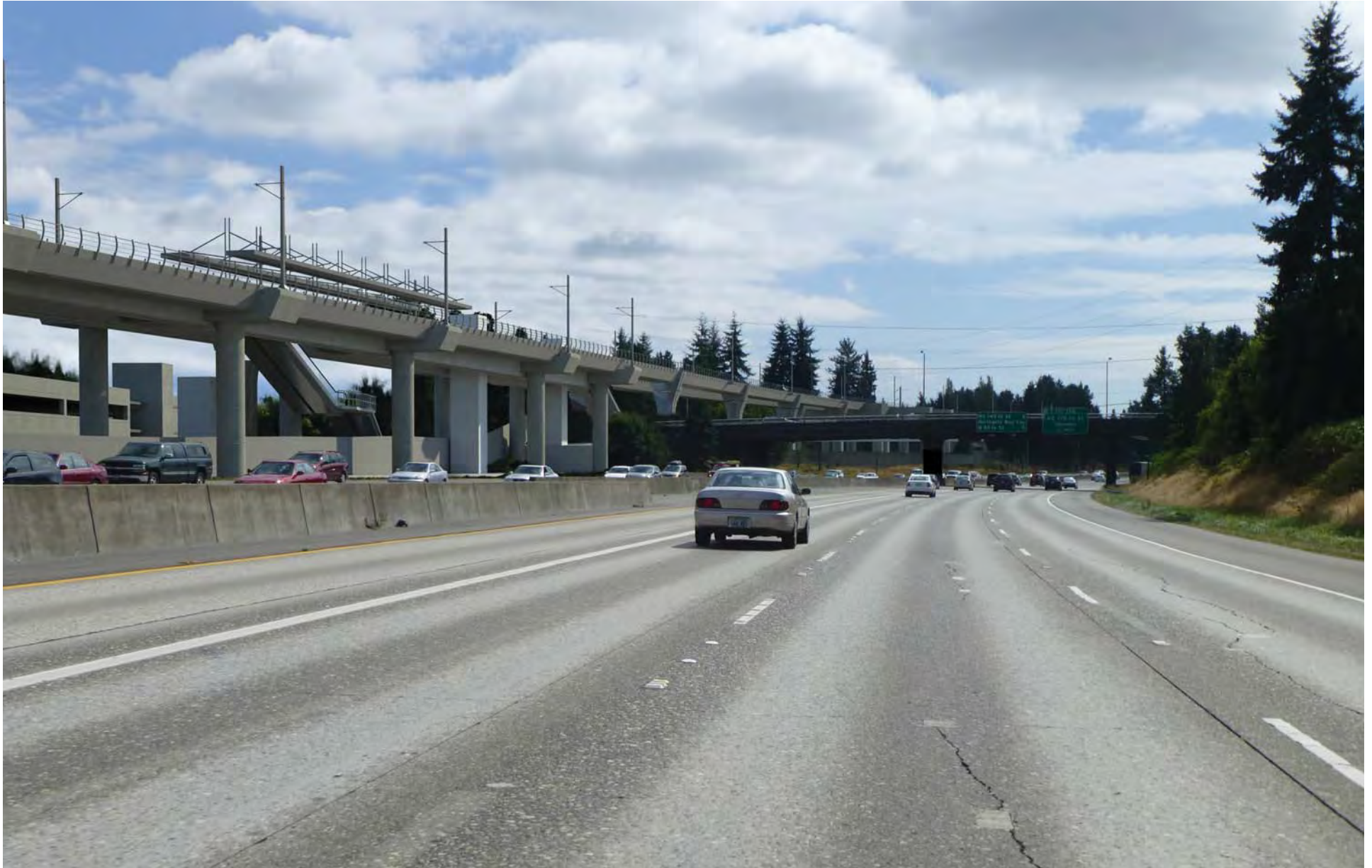
Figure G-96. Viewpoint 29 I-5 Southbound at NE 187th Street View to the south Simulation: Alternatives A3, A7, and A11