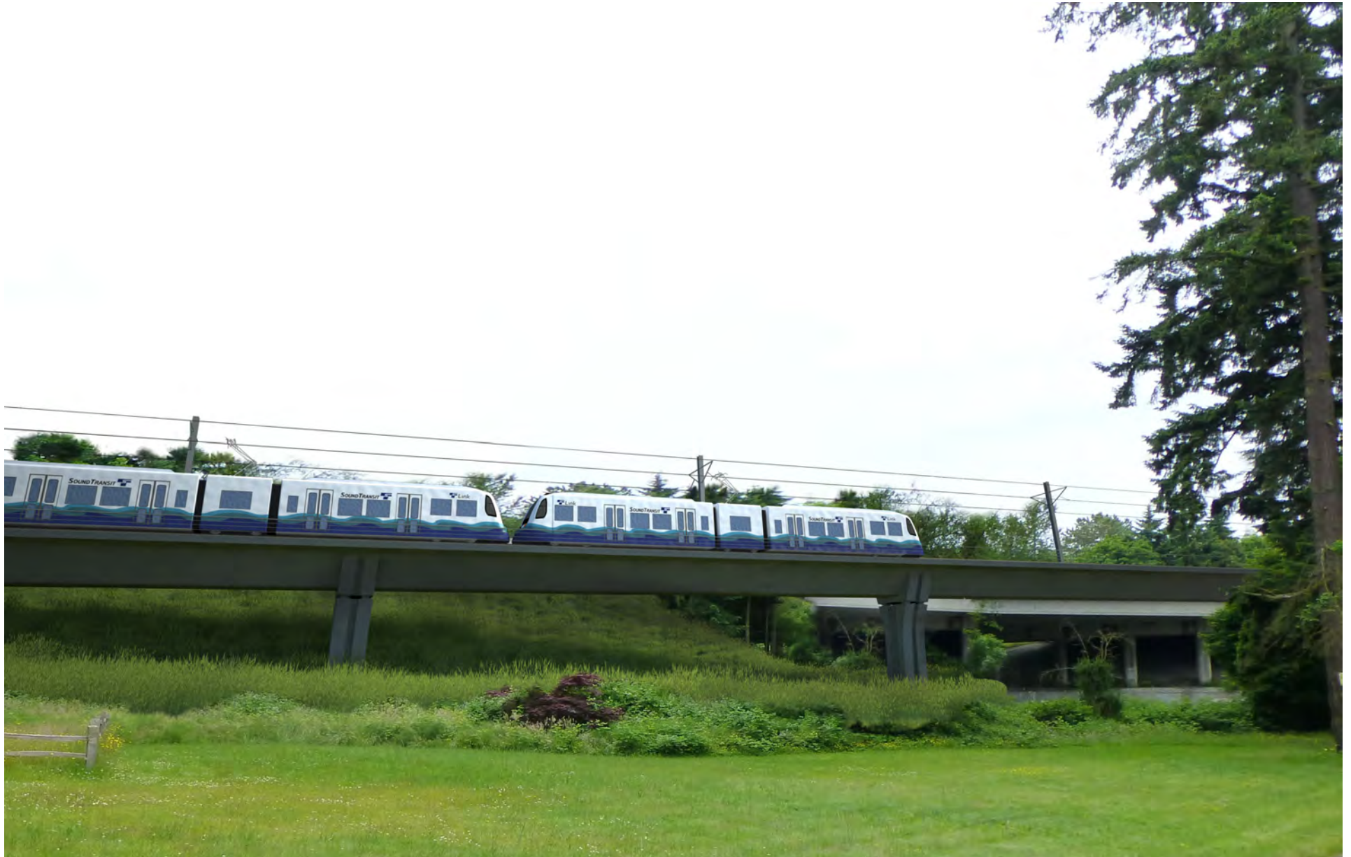
Figure G-128. Viewpoint 40 Hall Lake View to the east Simulation: Preferred Alternative and Alternative B2A