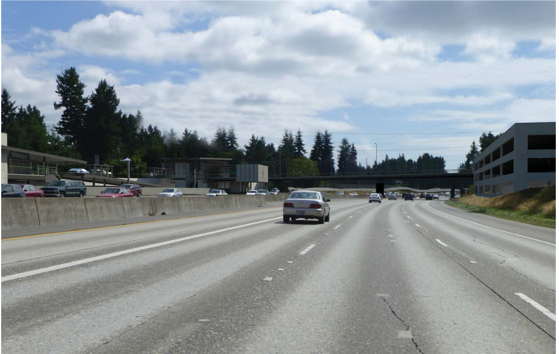
Figure G-94. Viewpoint 29 I-5 Southbound at NE 187th Street View to the south Simulation: Preferred Alternative