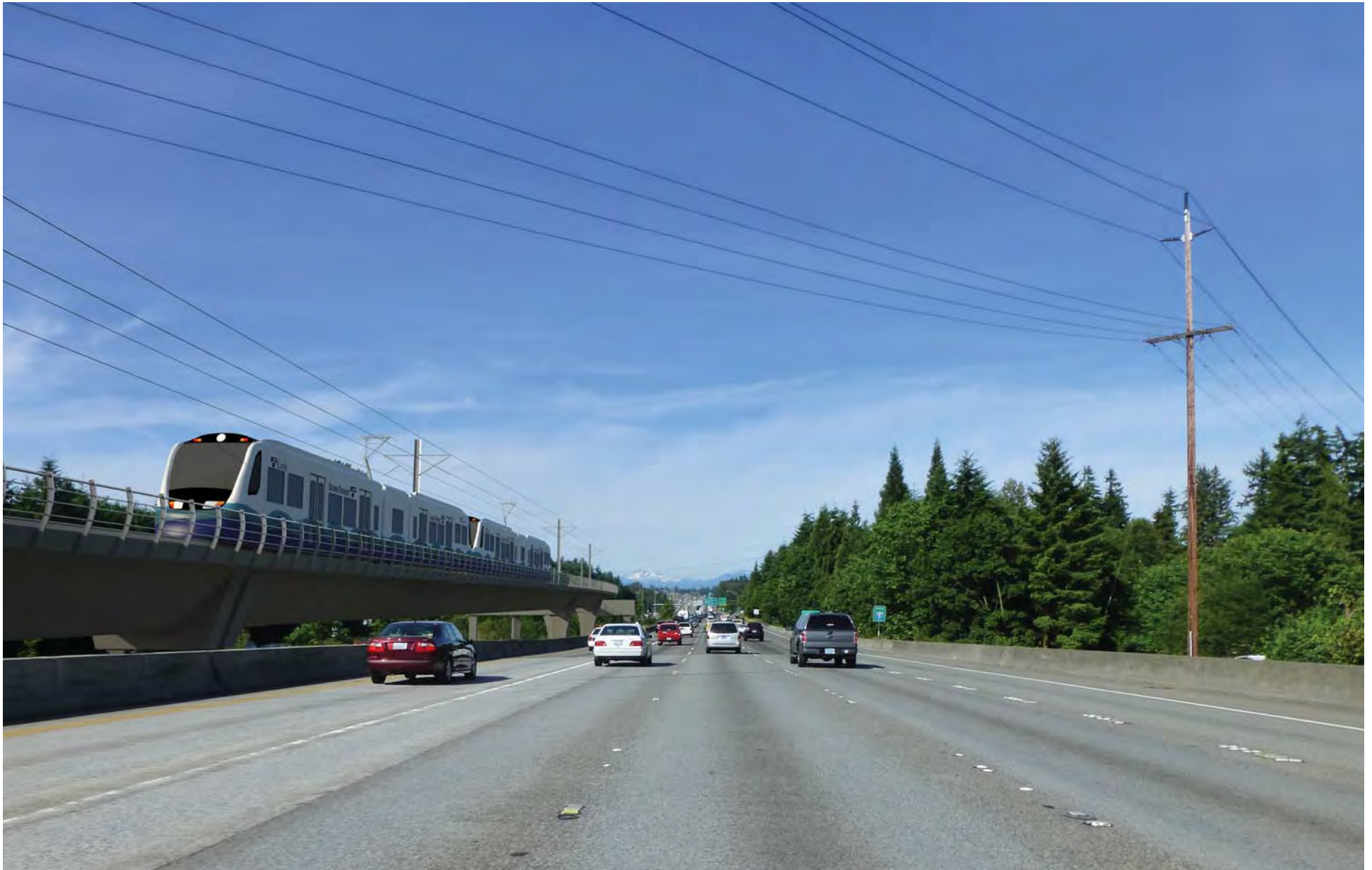
Figure G-126. Viewpoint 39 I-5 Northbound at 212th Street SW View to the north Simulation: Alternatives B1 and B4 (Transitioning to Segment C alternatives with a median option)