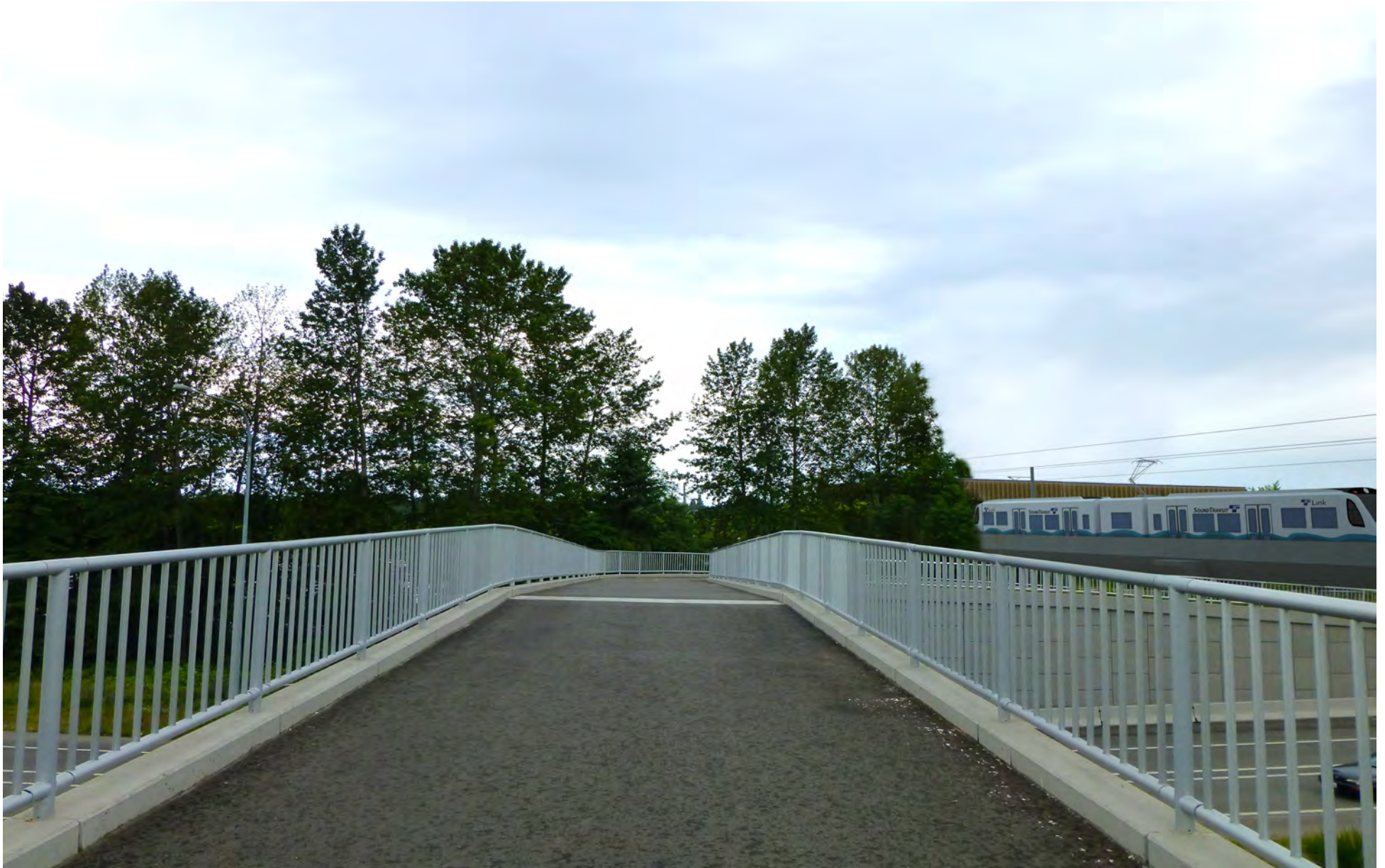
Figure G-155. Viewpoint 51 Interurban Trail at 44th Avenue West View to the west Simulation: Alternative C2