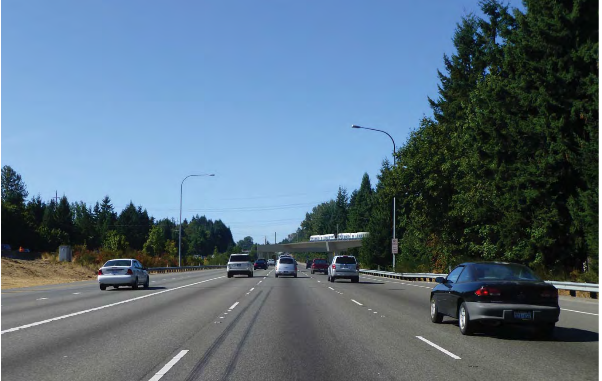
Figure G-132. Viewpoint 41 I-5 Southbound at 50th Avenue West View to the south Simulation: Alternatives C1 and C2 with Alignment Option 1 in Median