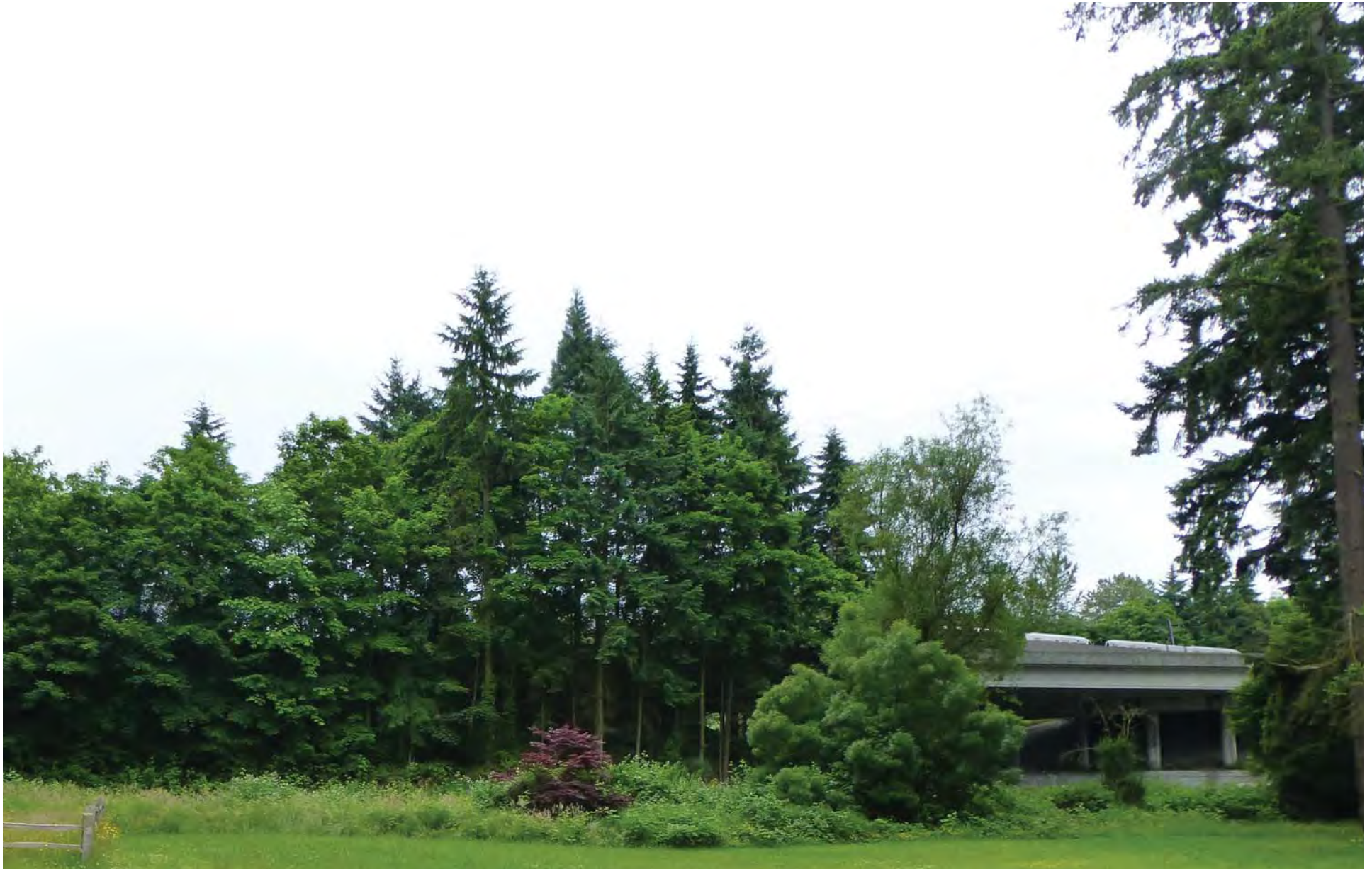
Figure G-129. Viewpoint 40 Hall Lake View to the east Simulation: Alternatives B1 and B4