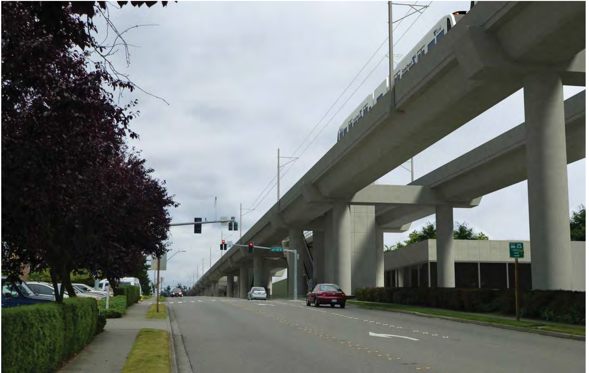
Figure G-142. Viewpoint 45 200th Street SW at 49th Avenue West View to the east Simulation: Alternative C1