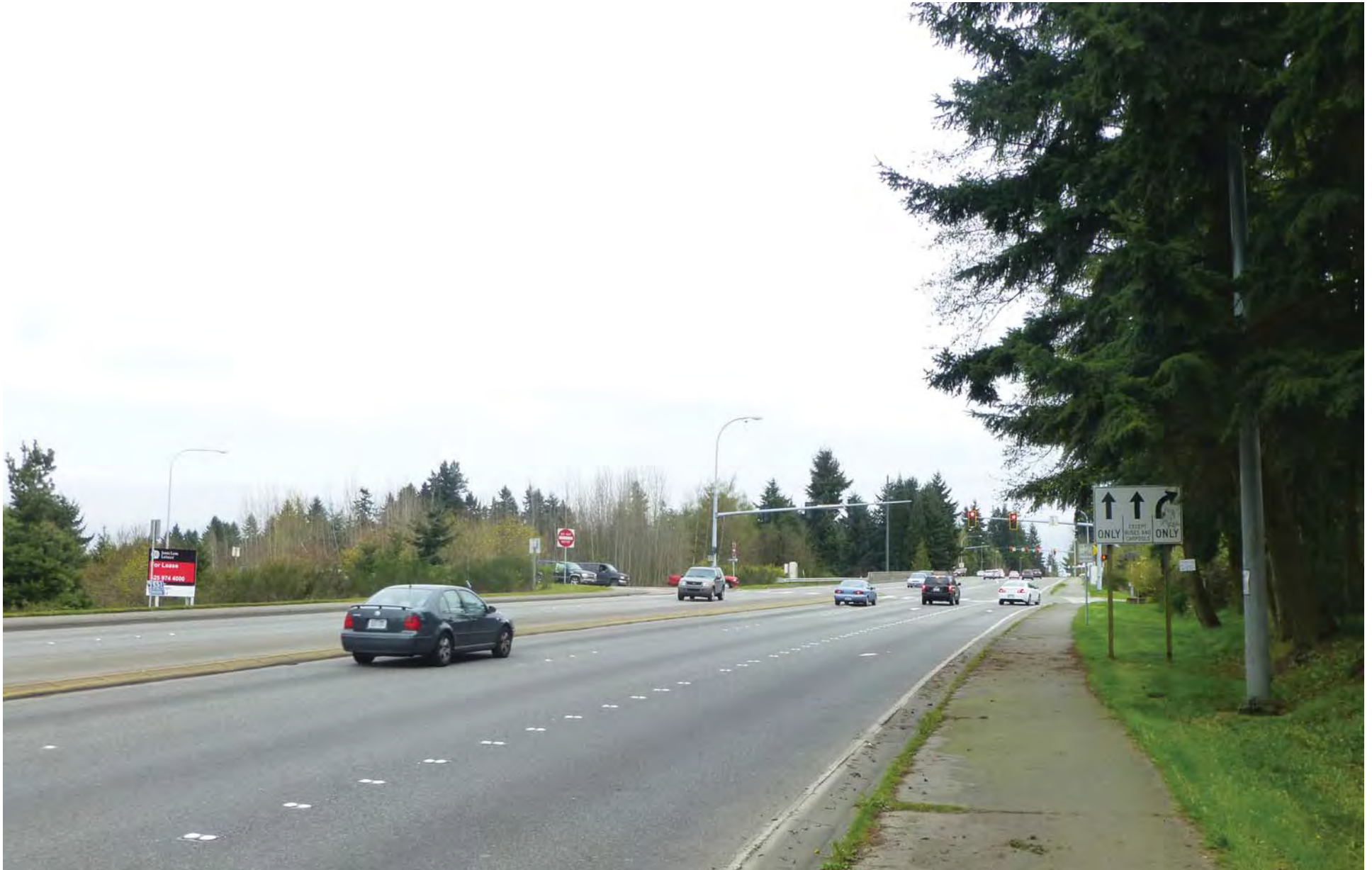
Figure G-121. Viewpoint 38 220th Street SW, west of I-5 View to the east Existing View