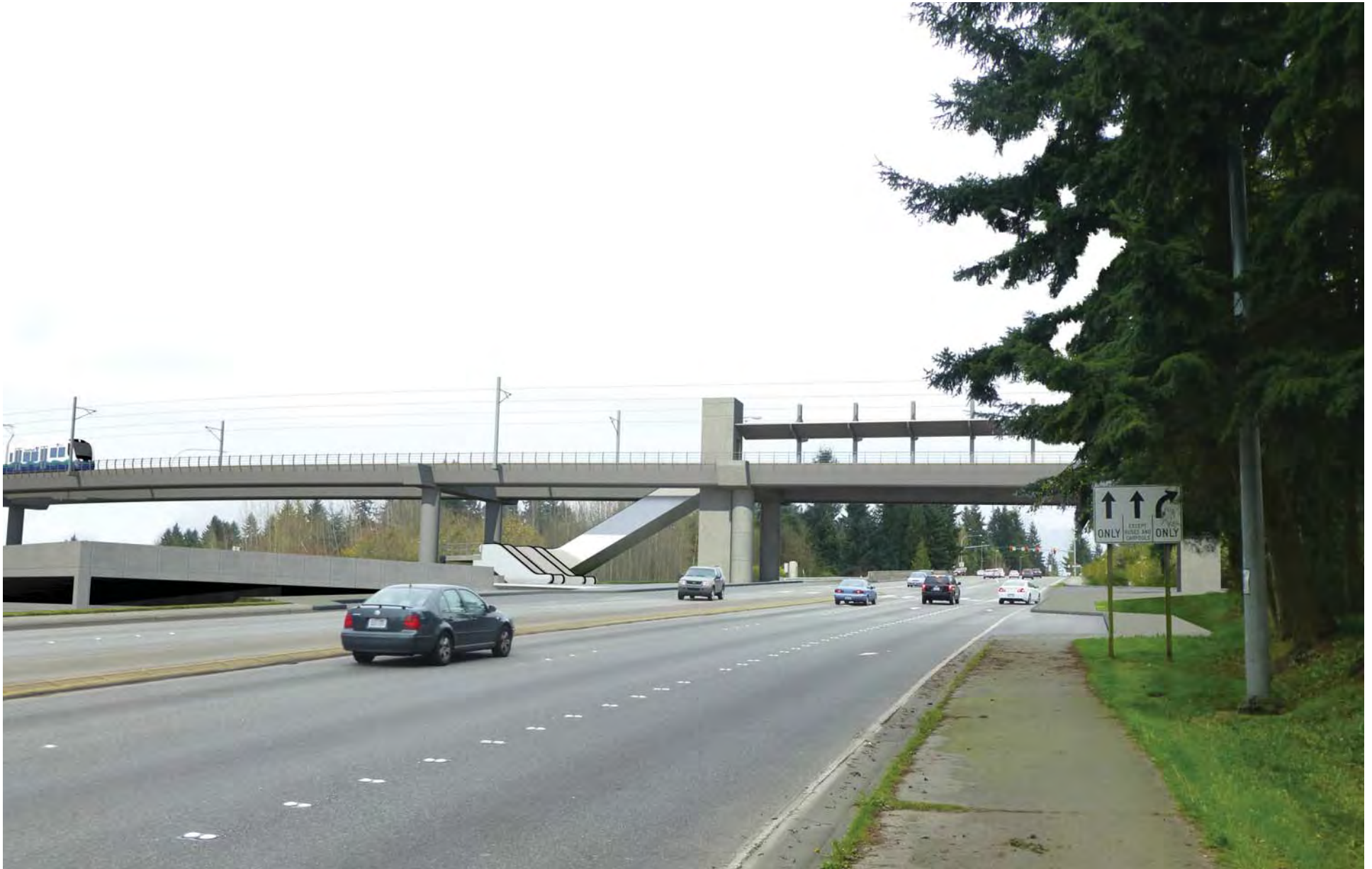
Figure G-123. Viewpoint 38 220th Street SW, west of I-5 View to the east Simulation: Alternative B2A