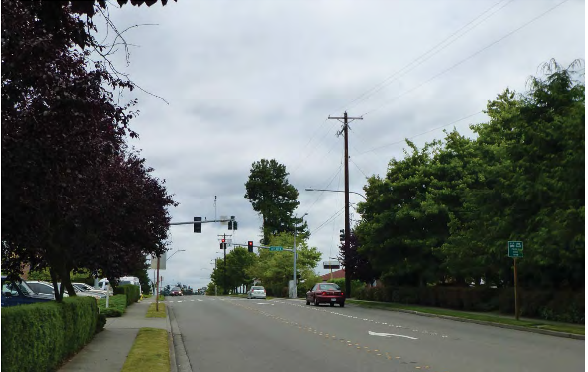
Figure G-141. Viewpoint 45 200th Street SW at 49th Avenue West View to the east Existing View