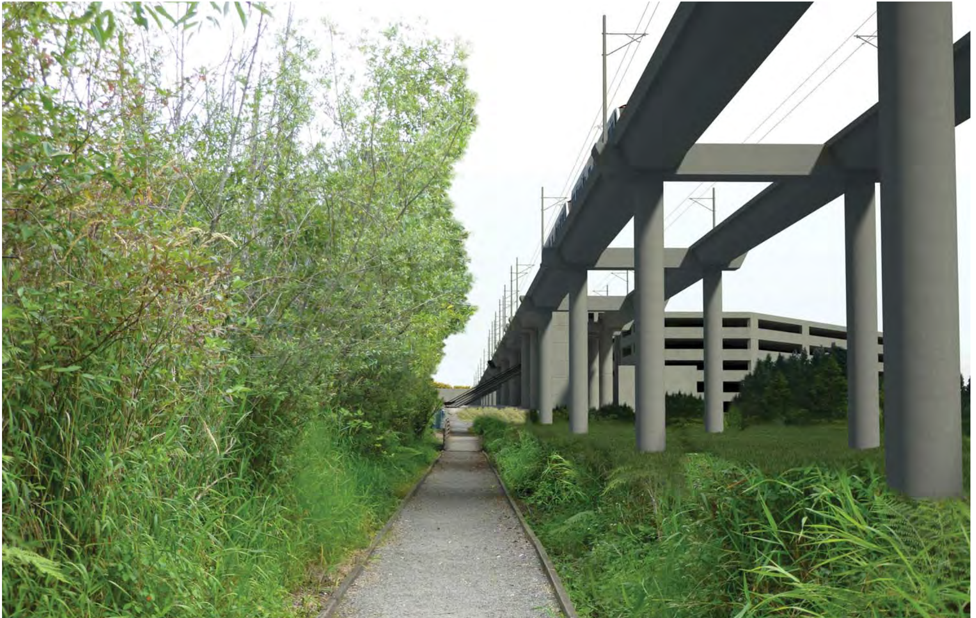
Figure G-144. Viewpoint 46 Scriber Park Trail View to the east Simulation: Alternative C2