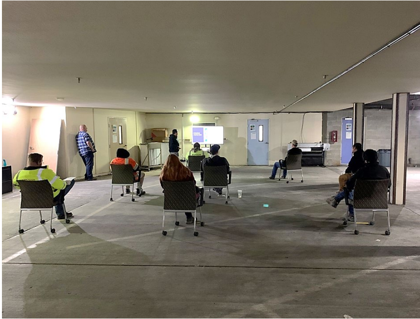
Hilltop Tacoma Link