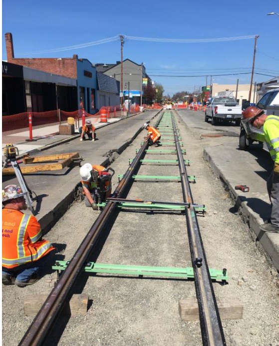
Hilltop Tacoma Link – Track installation