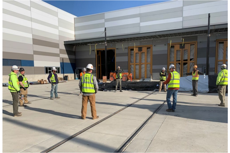
Operations & Maintenance Facility East