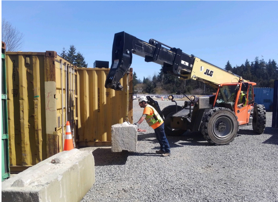
Lynnwood Link – Securing site during work suspension