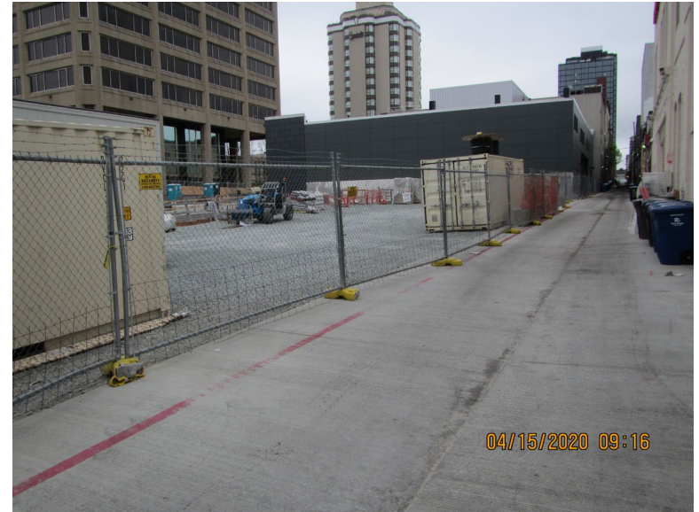
Northgate Link – U District Station secured site