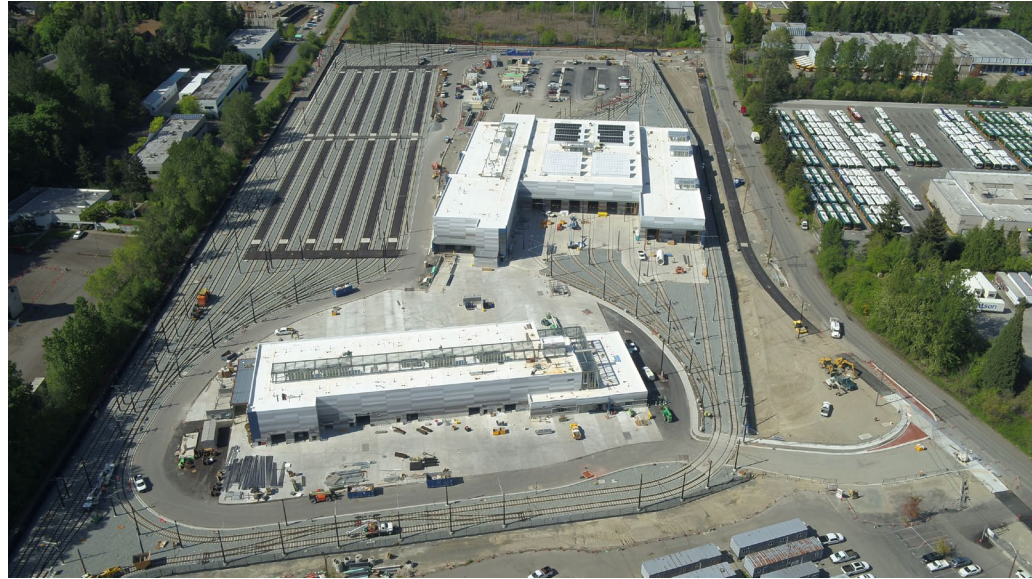
Operations & Maintenance Facility East