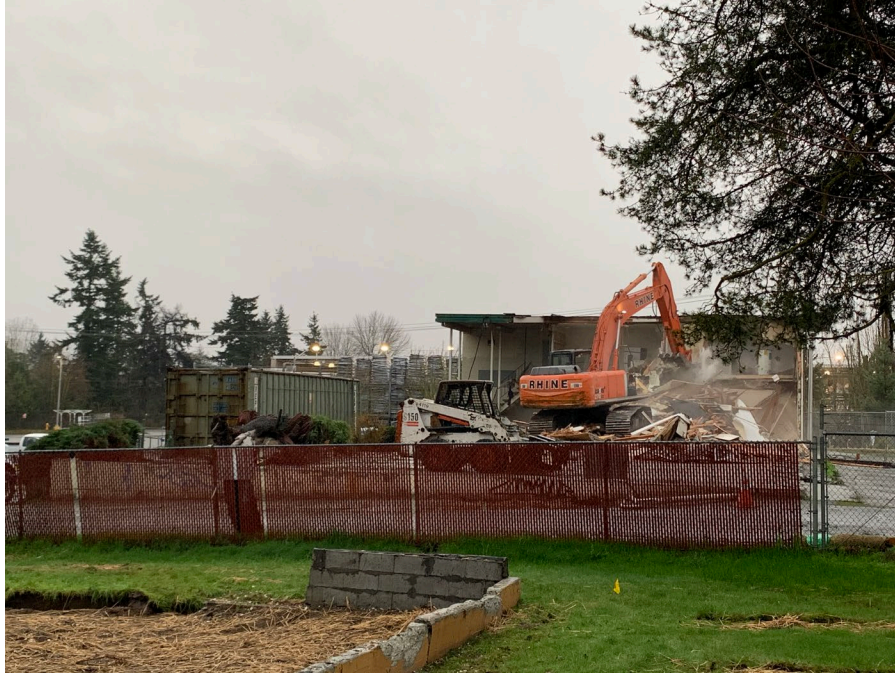
Federal Way Link – Demolition Work