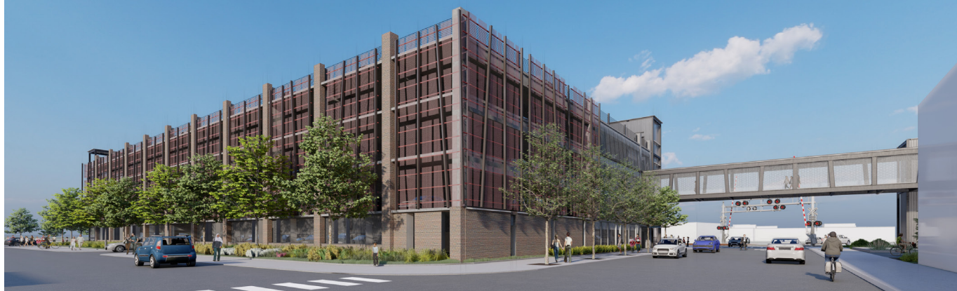
View of garage and pedestrian bridge from the intersection of 5th Street NW and 2nd Ave NW.

We expect to finish construction and open the new facilities to the public in the first half of 2022.