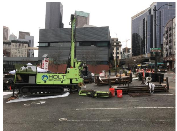
Geotechnical drilling rig in Chinatown-International District.