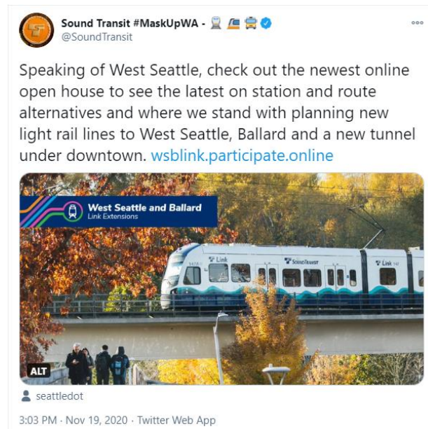
The online open house was shared on Facebook, Twitter, Instagram and other news outlets.