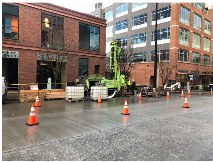
Geotechnical drilling rig in South Lake Union

Delivered flyers in West Seattle, West Seattle Duwamish Waterway, SODO, Downtown and Ballard to notify businesses and residences about geotechnical work.