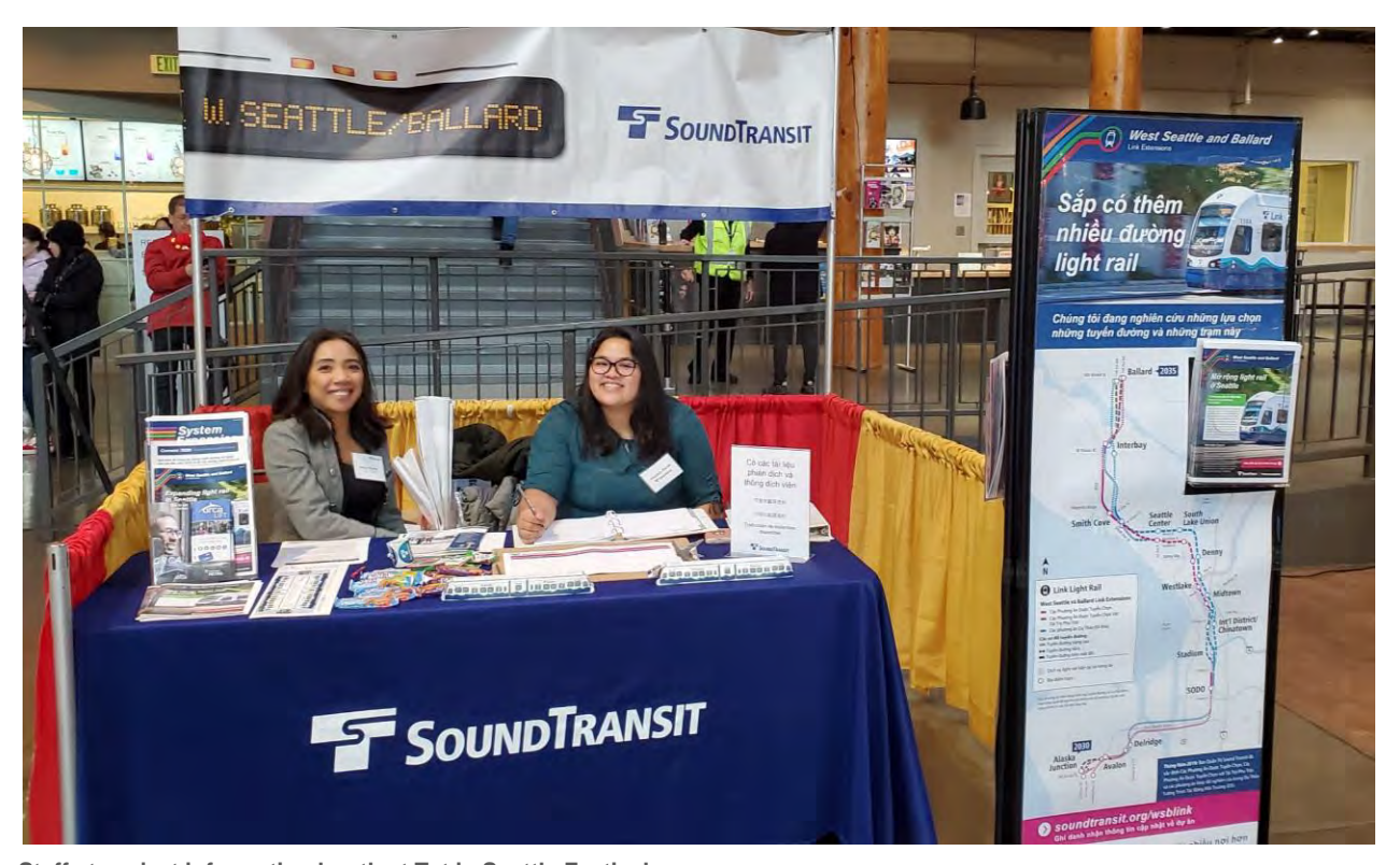
Staff at project information booth at Tet in Seattle Festival