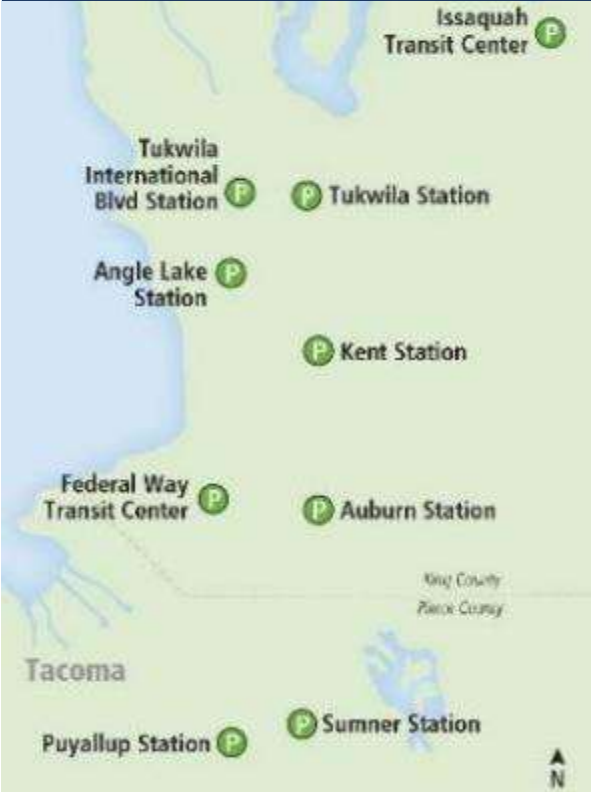
HOV permit program locations