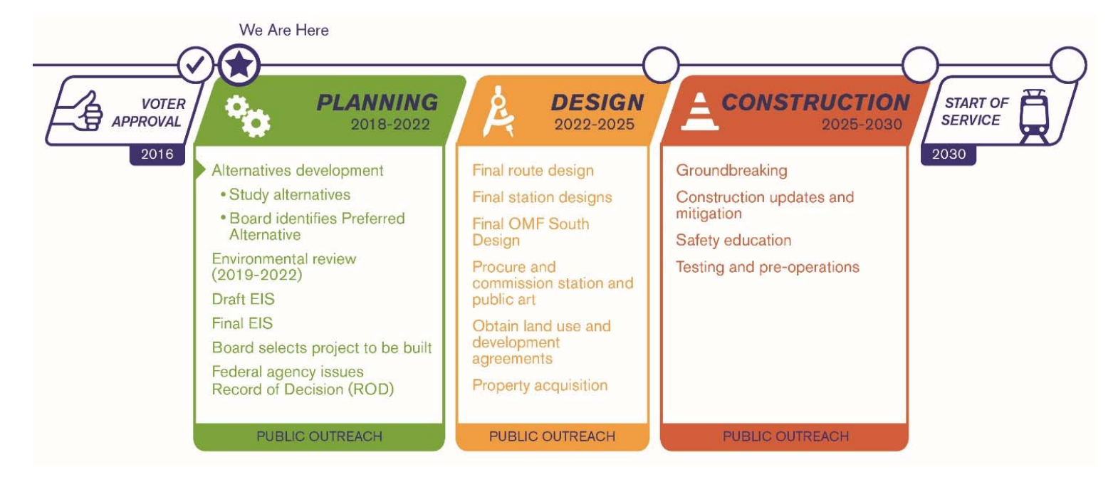
Exhibit 2. Project Timeline