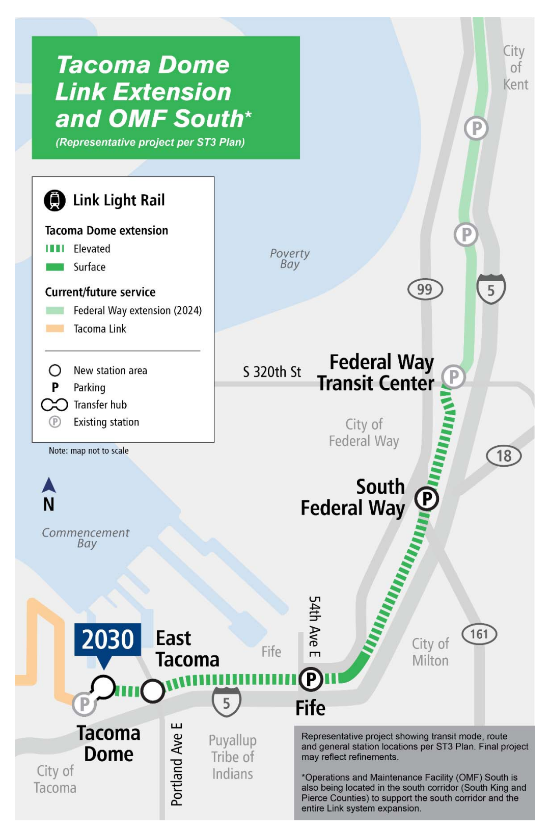
Exhibit 1. Representative Project for the Tacoma Dome Link Extension