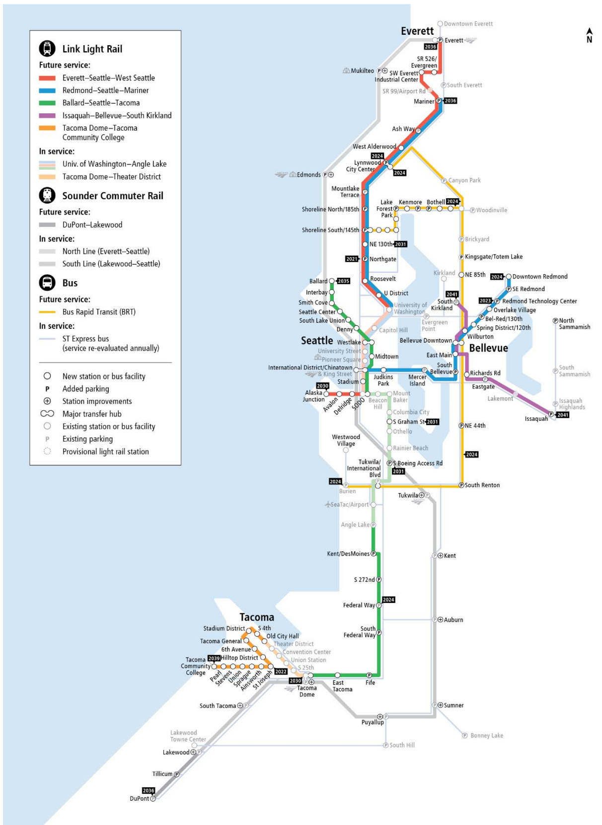
Exhibit 3. Regional Transit System