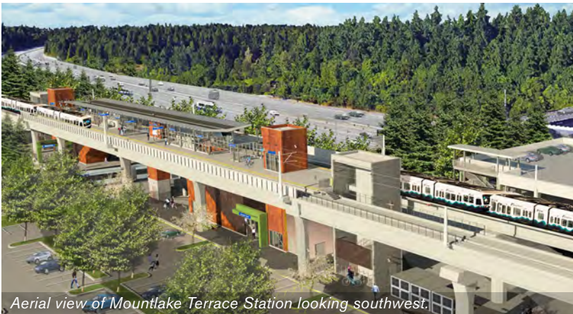
Aerial view of Mountlake Terrace Station looking southwest.

Located at the existing Lynnwood Transit Center, this elevated center platform station serves the south Lynnwood area, connecting light rail trains to buses at one of the busiest transit centers in the region. Surface parking and a new parking garage accommodate approximately 1,900 parking spaces. A pedestrian promenade and plaza incorporates art by Claudia Fitch and landscape and hardscape features that reflect the natural flow of the nearby daylight fish stream.