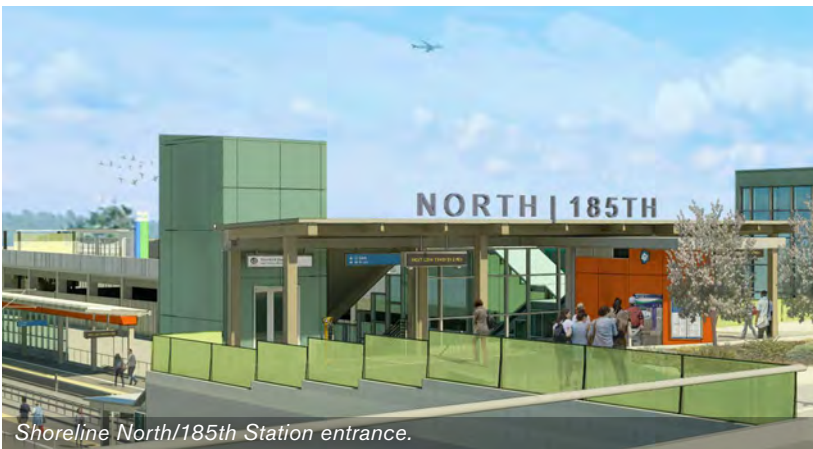
Shoreline North/185th Station entrance.