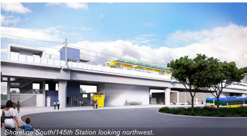
Shoreline South/145th Station looking northwest.

Located just east of I-5, this freeway-level station serves Shoreline Stadium, the Shoreline Conference Center and surrounding neighborhoods with entry at north and south ends of the station. The north entry offers safe and easy access up and over tracks to the west side platform. The project includes a new parking garage with approximately 500 spaces. Station walkways and seating designs incorporate a Douglas fir tree branch motif, while station art by Mary Lucking celebrates the community and urban forest.