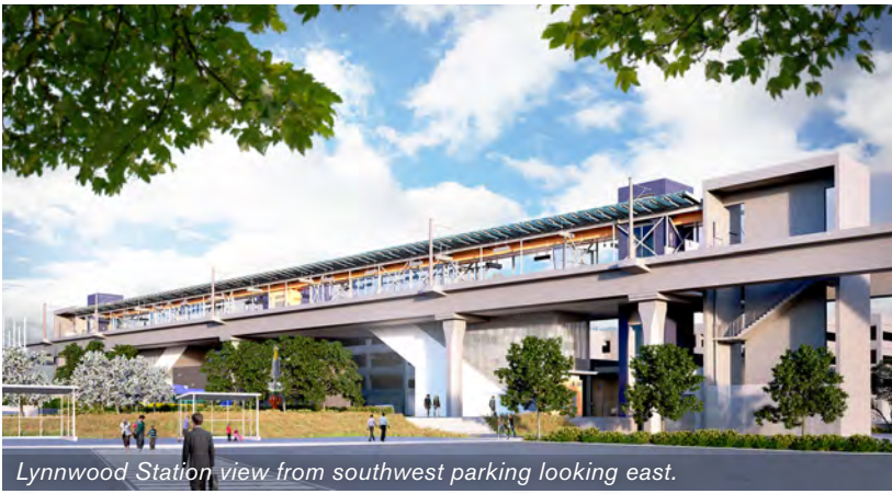
Lynnwood Station view from southwest parking looking east.