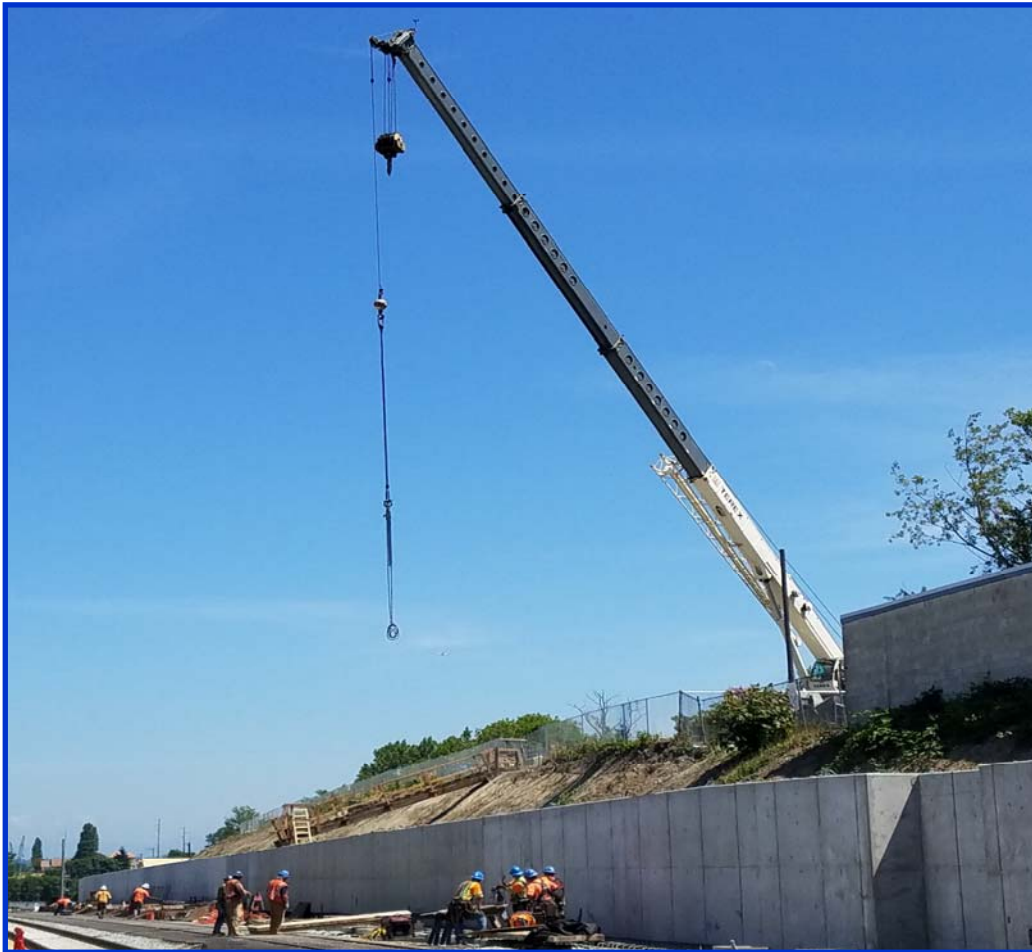
The Tacoma Trestle construction contractor's crane was used to move formwork and rebar for the south platform