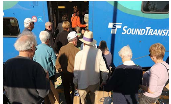
Additional morning and evening service between Seattle and Lakewood

BNSF is currently underway with the construction improvements and intends to incrementally complete construction as additional service is added. Additional Sounder South Service was implemented in 2016 and two more round trips will be added in September 2017.