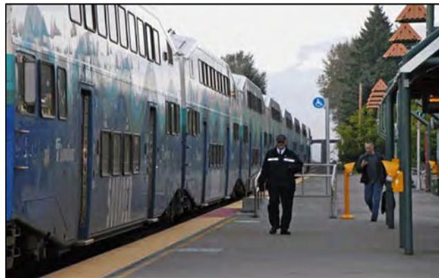
Improving safety along the Tacoma-to-Lakewood corridor

Congress acted to extend the deadline for implementing PTC to December 2018.