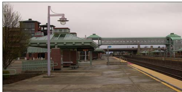
Improving access to Auburn Station

At the end of the alternative analysis phase, the ST Board will identify a preferred alternative to advance to conceptual and preliminary engineering.