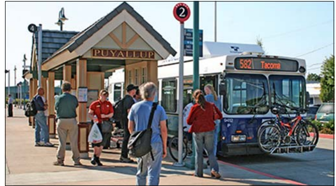
Improving access to Puyallup Station

Project scope for Final Design will be determined with the concurrence of community and municipal stakeholders, following completion of conceptual and preliminary engineering.