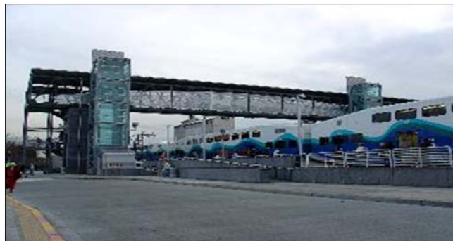
Improving access to Kent Station

At the end of the alternatives analysis phase, the ST Board will identify a preferred alternative to advance to conceptual and preliminary engineering.