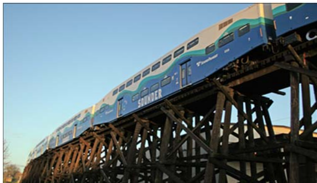
Project will replace existing Tacoma Trestle

Other improvements include building an extended passenger platform to accommodate Amtrak long-distance train, making minor street repair, relocating utilities, replacing retaining walls and upgrading railroad signals.