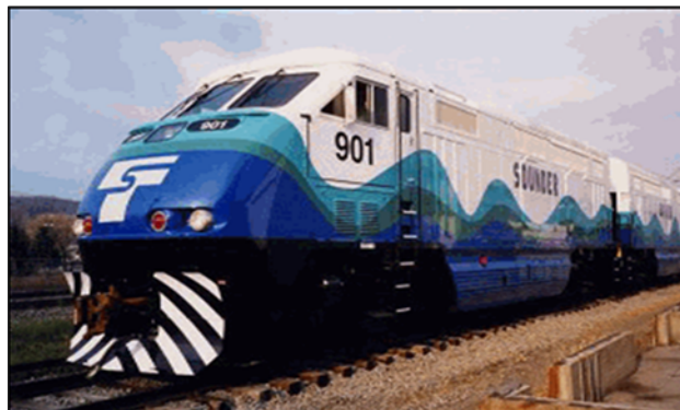
Sounder Yard Expansion will increase storage capacity for Sounder 7th train set

The additional capacity is necessary when additional Sounder South trains, approved in ST2, begin service between Tacoma and Seattle in 2016/17 in advance of completion of the Sounder Maintenance Base (formerly Yard & Shops) project.