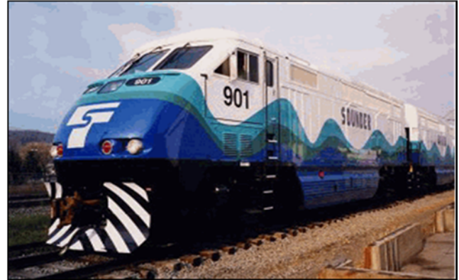
Point Defiance Bypass

Sound Transit is administering the construction of WSDOT's Point Defiance Bypass Project, which will construct a new second track adjacent to Sound Transit's existing main line between South Tacoma (South 66th St. Bridge) and Lakewood (Bridgeport Way) and install new rails, ties, ballast, and signaling and PTC systems on Sound Transit's existing track between Lakewood and Nisqually.