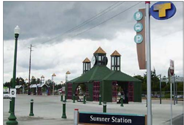
Improving access to Sumner Station

Project scope for Final Design will be determined with the concurrence of community and municipal stakeholders, following completion of conceptual and preliminary engineering.