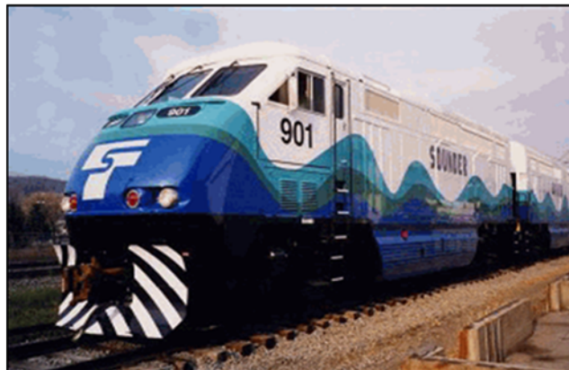
Amtrak currently provides Sounder vehicle maintenance

Preliminary project development activities (final planning, revised cost estimating and preliminary siting studies) have been completed; environmental analysis is completed.