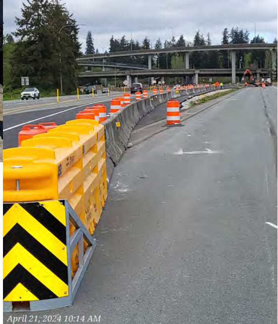
S2 - NE 85th Station/Interchange grading (above), SR522/I-405 Interchange start of construction, traffic control (photo at right)