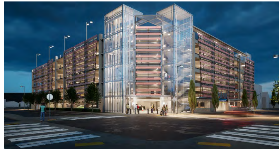
Auburn design-builder's proposal rendering