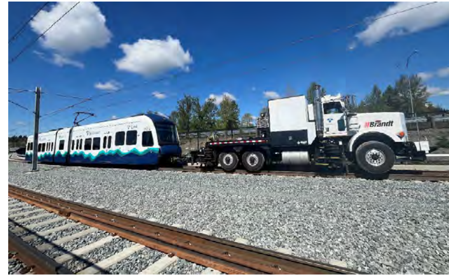
SIT: dead car tow