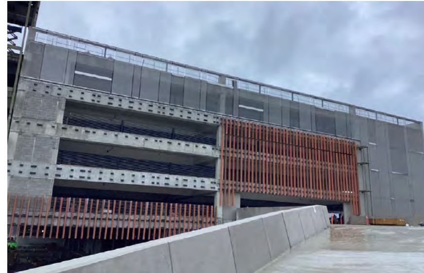
Marymoor Village Garage