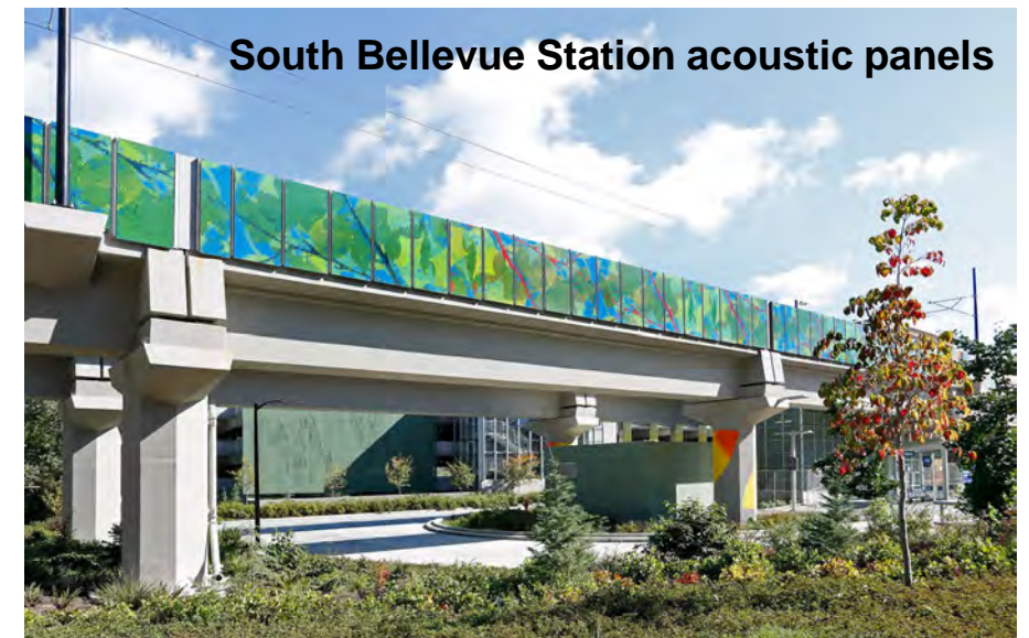
South Bellevue Station acoustic panels