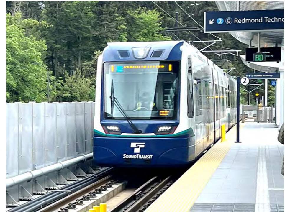
Series 2 LRV operating on 2 Line