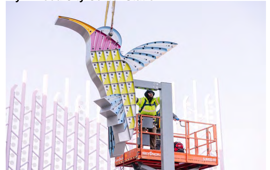
Hummingbird and Kitchen Curtin installation at Lynnwood City Center Station