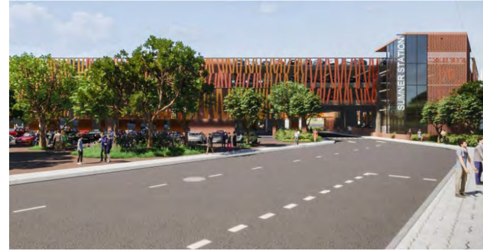
Sumner design-builder's proposal rendering