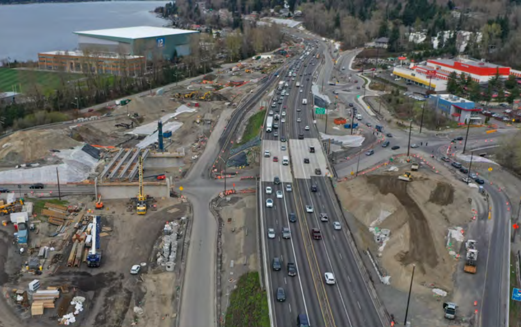
S1 - NE 44th Interchange and Station. Southbound bridge structure taking shape (center left in photo)