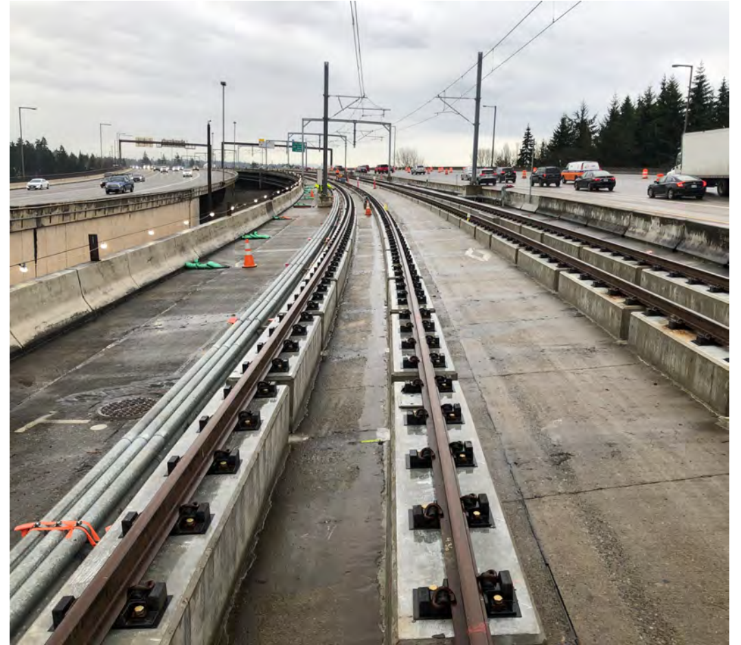
Completed Track on East Channel Bridge Looking West