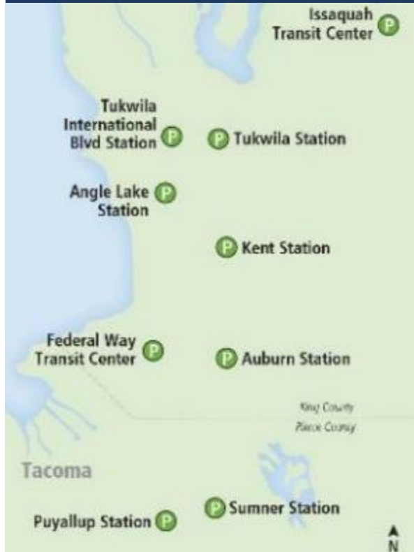
HOV permit program locations