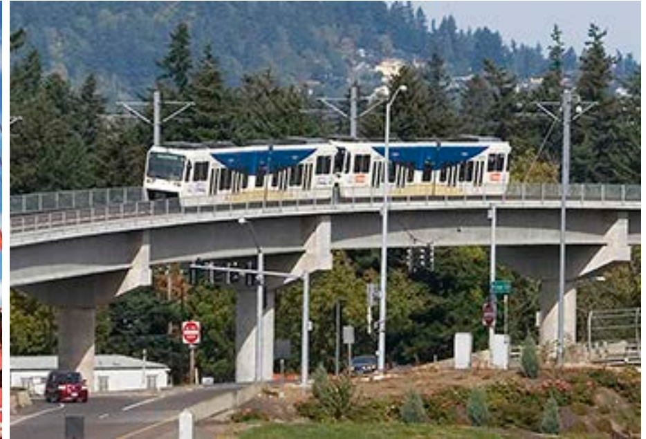
Precast Concrete Girders