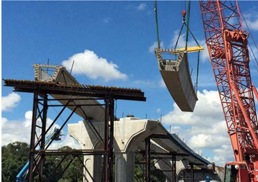
Precast Concrete Tubs