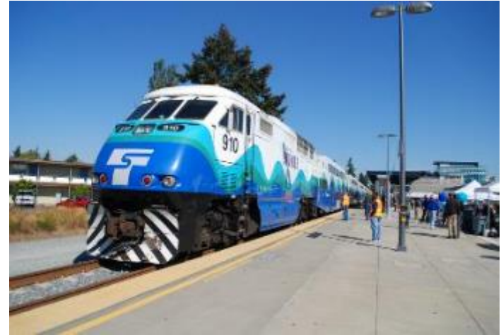
Sounder Maintenance Base will enable Sound Transit to maintain its Sounder vehicle fleet.