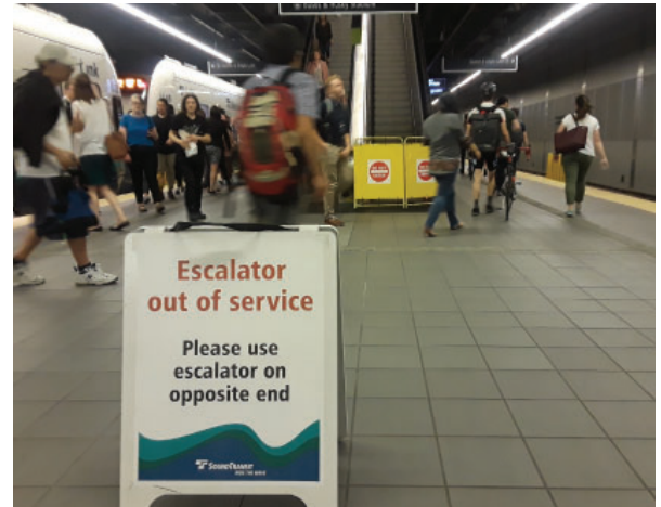
Travelers avoid an out-of-service escalator at the University of Washington light rail station.

The first example involves escalators at the University of Washington light rail station. The escalators specified in the plans and subsequently installed were designed to be somewhat more robust than a typical commercial grade escalator. Sound Transit chose these escalators because they were less expensive, but still met design specifications. However, installation issues, maintenance issues and heavy use resulted in repeated breakdowns. They have been closed intermittently since the station opened in 2016. The situation was further exacerbated because the station did not have public stairs near the escalators, causing inconvenience and delays for transit riders. After an investigation into why the escalators were breaking down, the agency could find no records of any maintenance done before the station was opened to the public. Sound Transit plans to spend at least $20 million to replace the escalators at least 15 years ahead of schedule.