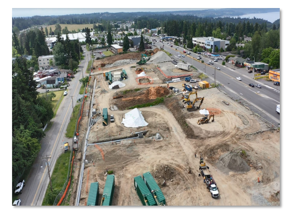
Looking South Across Portion of Site