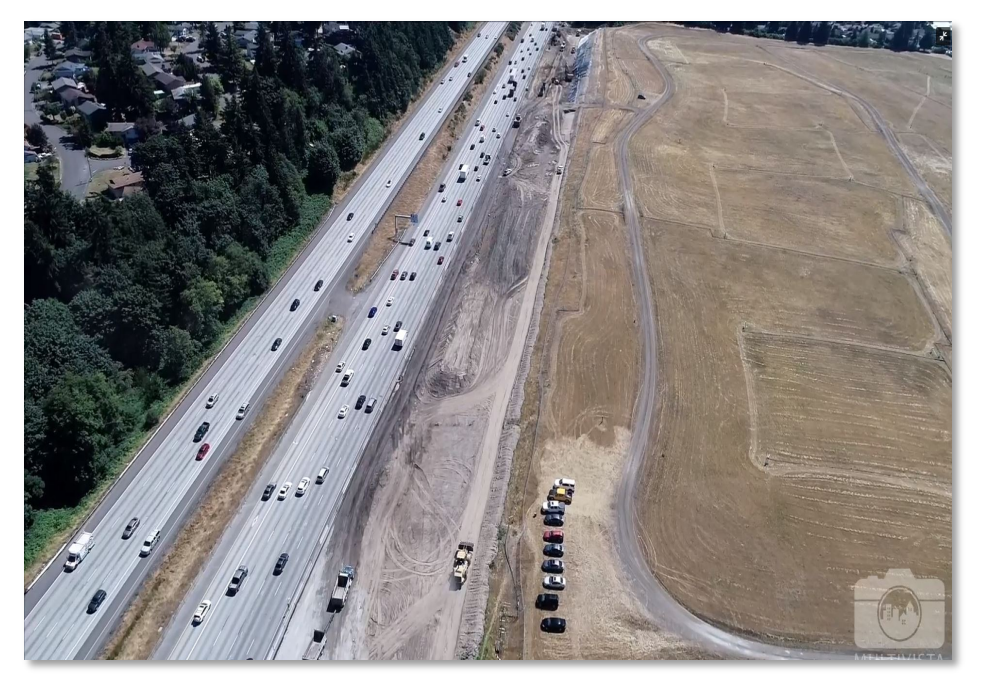
Looking South Along Landfill Limits