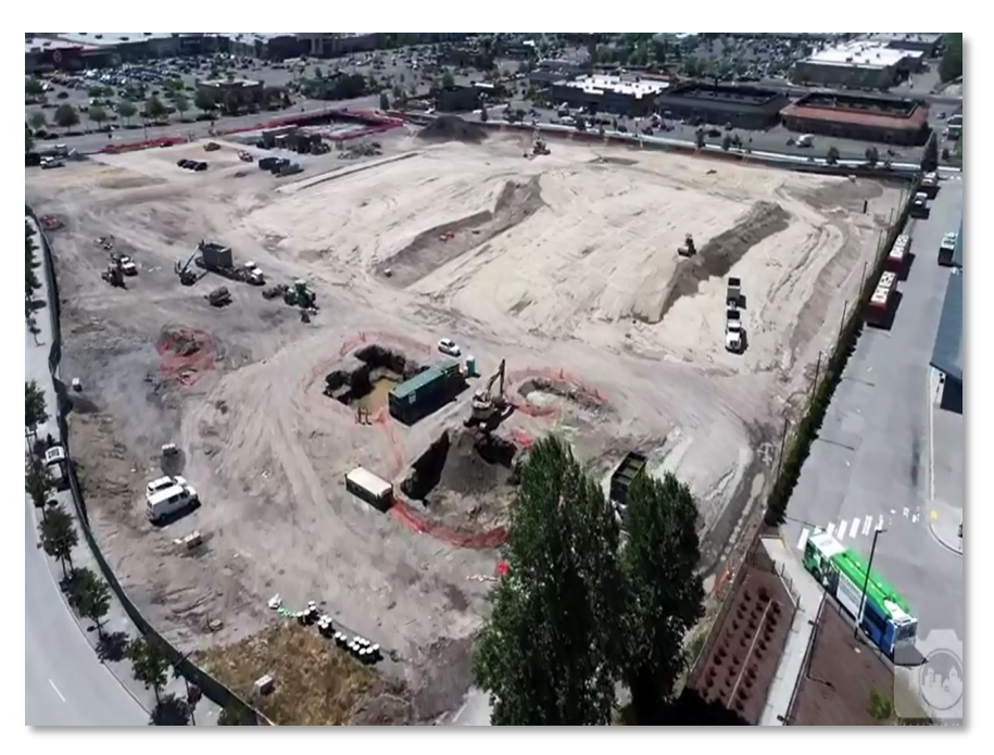
Looking West Across the Site