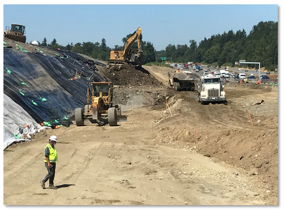
Excavation Work, South end of Landfill