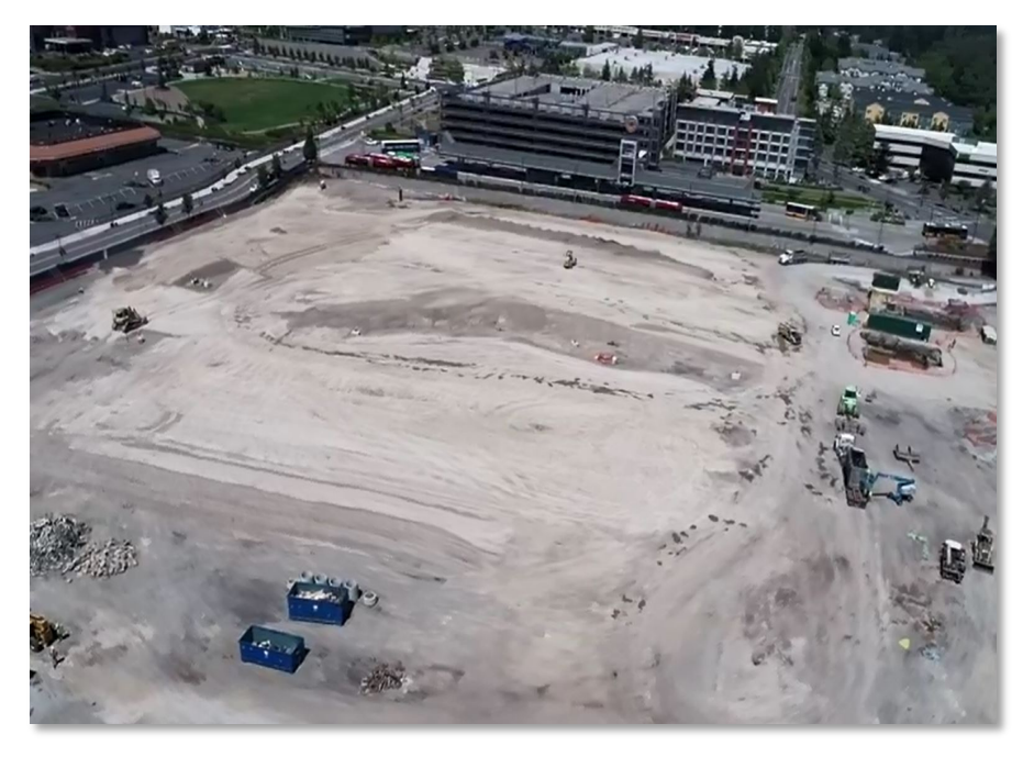
Looking North Across the Site